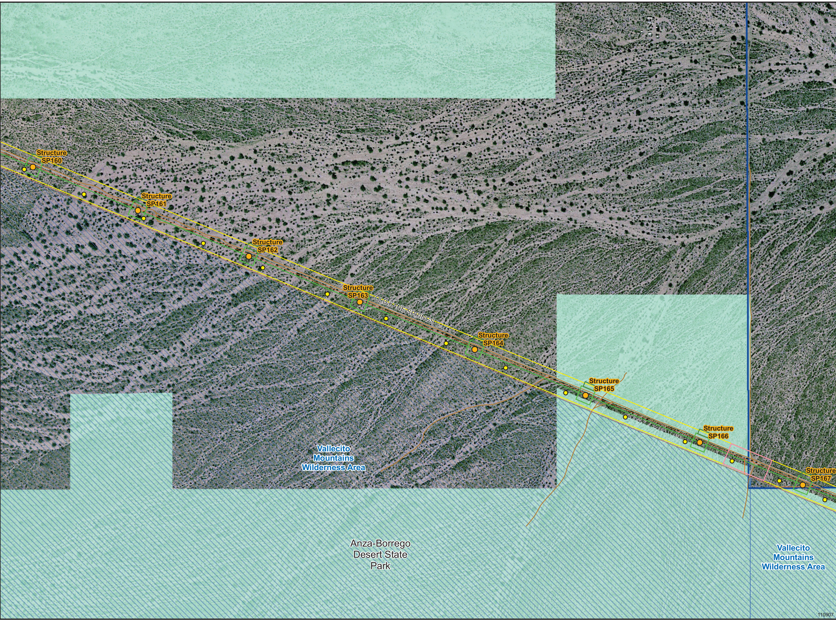
Appendix 11B, ABDSP Detail. Figure 11B-7