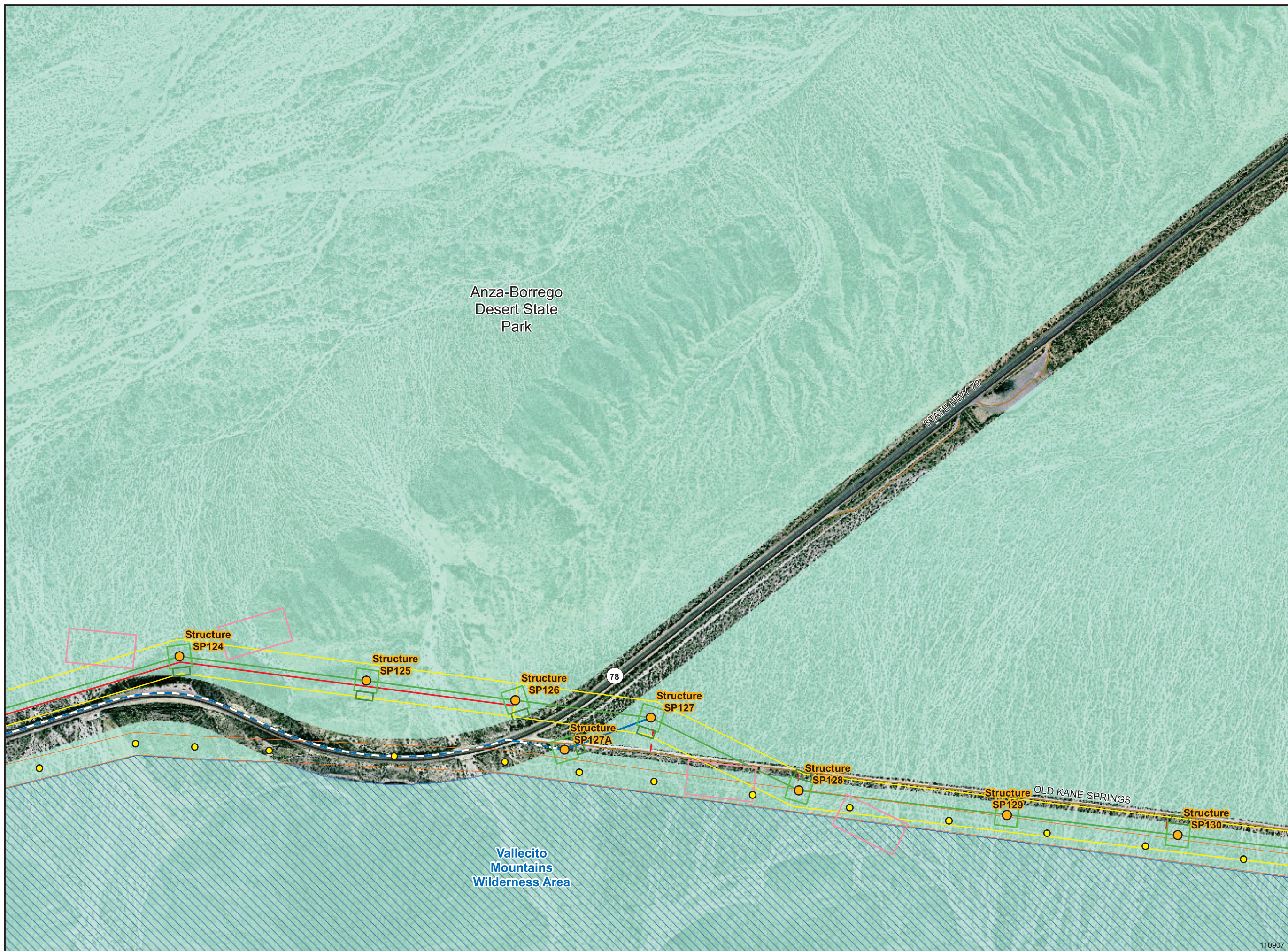
Appendix 11B, ABDSP Detail. Figure 11B-12