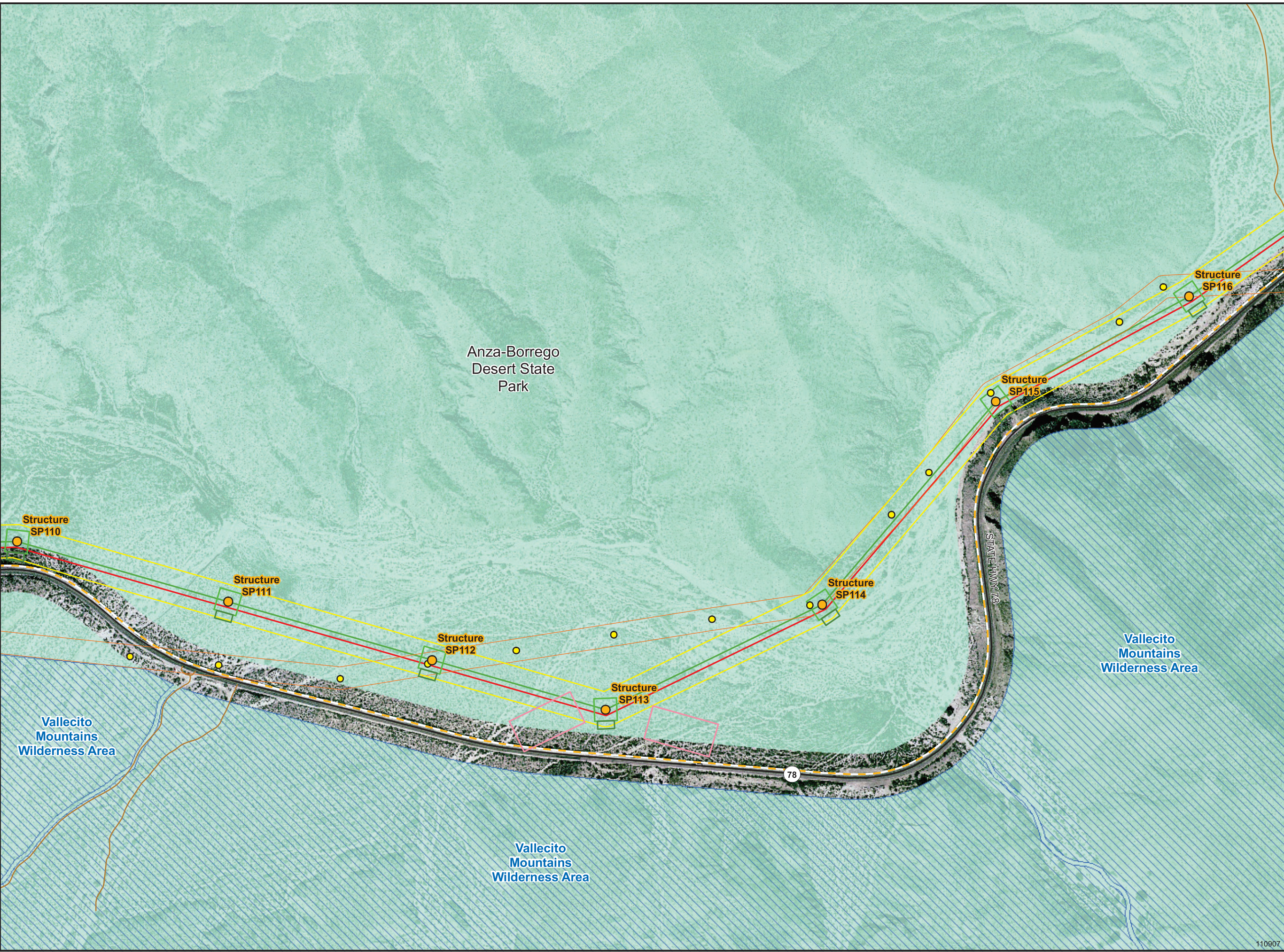
Appendix 11B, ABDSP Detail. Figure 11B-14