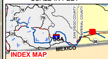
Figure 3 STRUCTURES EP333 TO EP324 (CULTURAL AVOIDANCE MODIFICATION)