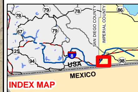
Figure 6 STRUCTURES EP255-2 TO EP276-1