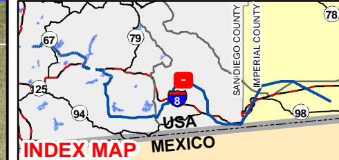
Figure 15 STRUCTURES EP170 to EP141 (JAM)