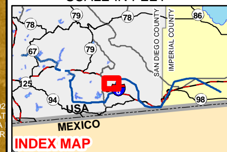
Figure 16 STRUCTURES EP141 to EP122