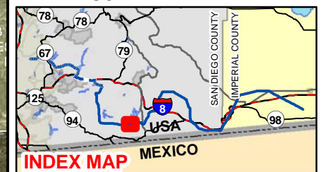
Figure 21 STRUCTURES EP79 TO EP67 (PACIFIC CREST TRAIL)