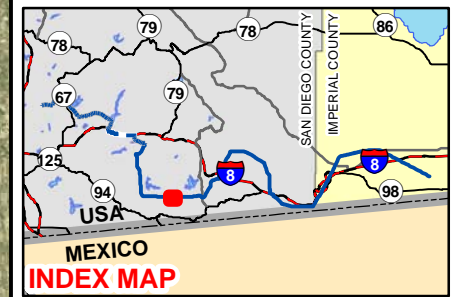
Figure 22 STRUCTURES EP67 TO EP62A-1