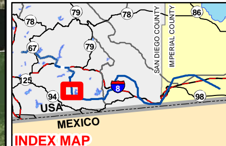
Figure 25 STRUCTURES EP39-1 TO EP22-1 (HERMES)