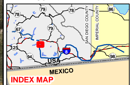
Figure 28 STRUCTURES EP9-1 TO EP1-3 (JUST)