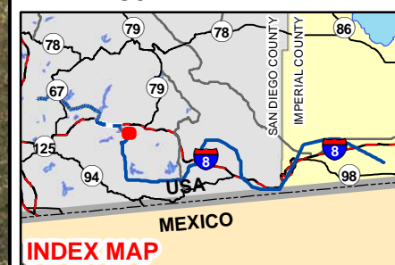
Figure 30 STRUCTURES CP109-1 TO CP106-1