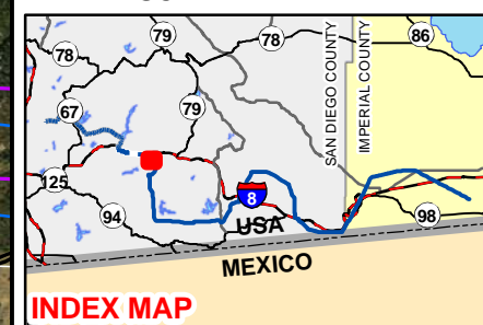
Figure 31 STRUCTURES CP106-1 TO CP98-1 (JERNEY)