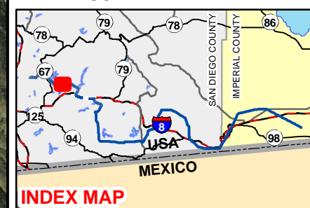
Figure 35 STRUCTURES CP64-2 TO CP53-1