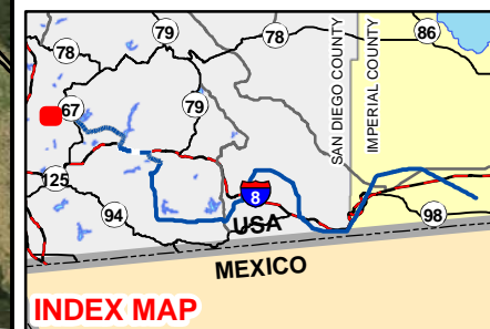
Figure 40 STRUCTURES CP12-1 TO CP3 (STONEBRIDGE)