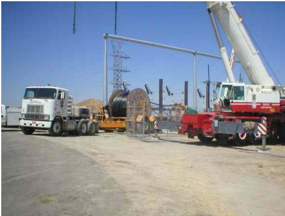
Figure 2 – Cable being pulled at Vault 8 located at the Transition Station, July 21, 2006.