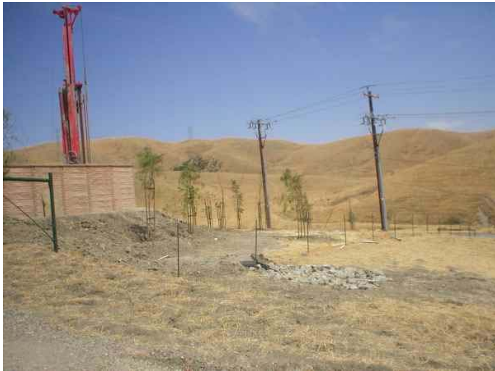
Figure 4 – Vitale and Sons have planted trees around the North Dublin Substation. July 21, 2006.