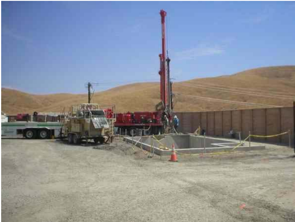
Figure 5 – Martel Water Systems crews conducted well drilling for an irrigation line at the North Dublin Substation. July 21, 2006.