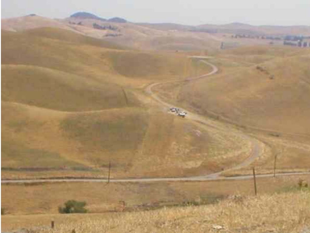
Figure 1 – Cable pulling operations at Vault 7 along Road 7, July 21, 2006.