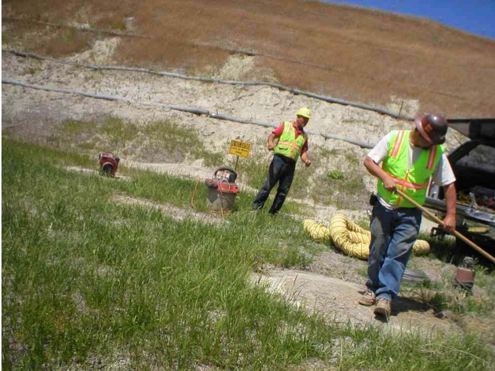
Figure 1 – Wilson crew cleaning the Vault 7 area, May 11, 2006.