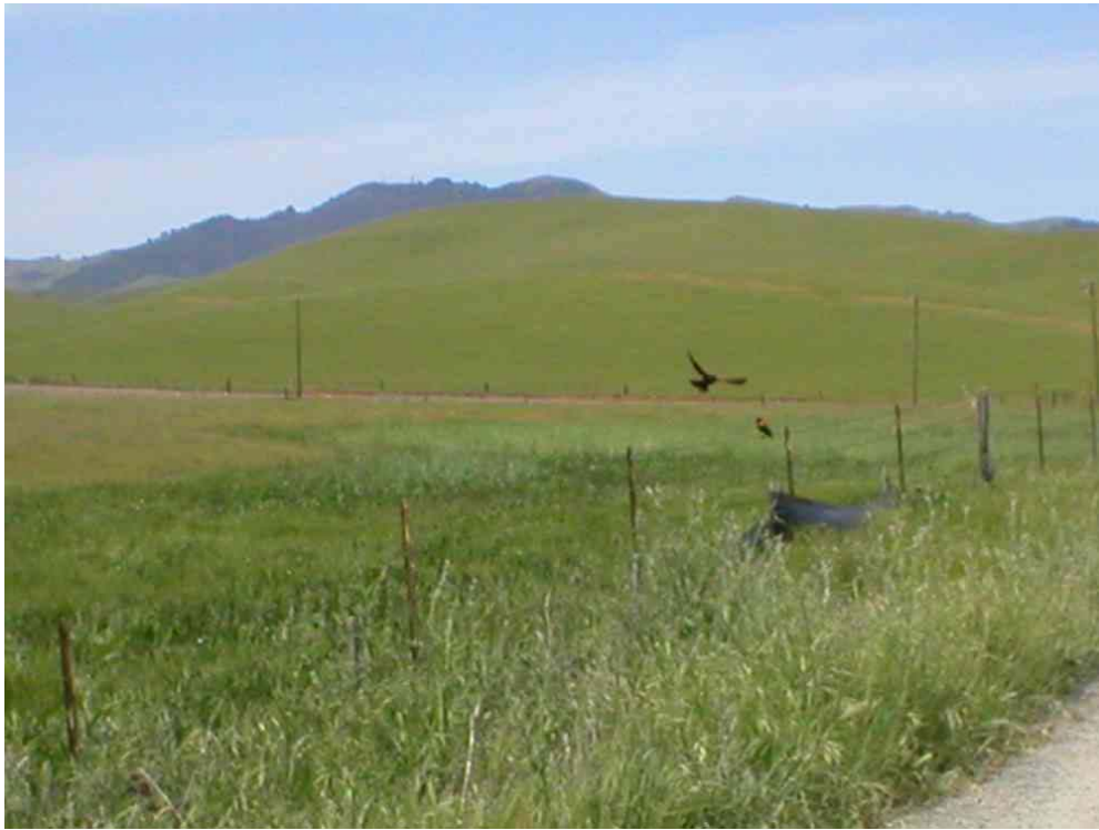
Figure 3 – Redwing and potential tri-color black birds located along Road 5, May 10, 2006.