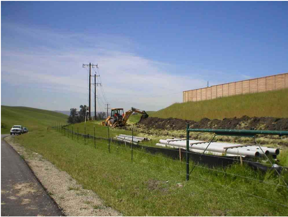
Figure 5 – “Gas-stubbing” work connecting the North Dublin Substation to the distribution line, May 11, 2006.