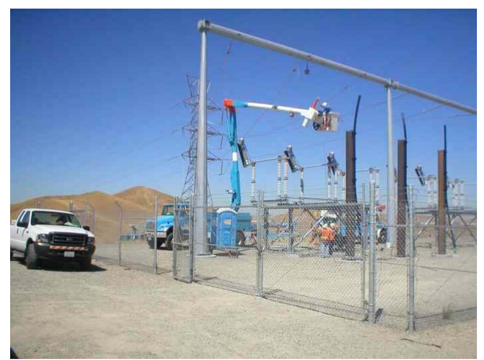
Figure 2 – Transition Station, August 10, 2006.