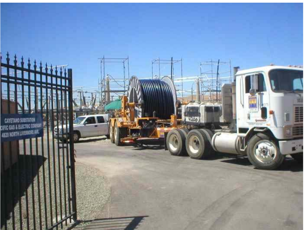
Figure 1 – At the Cayetano Substation, cable was pulled through Vault 2. August 10, 2006.