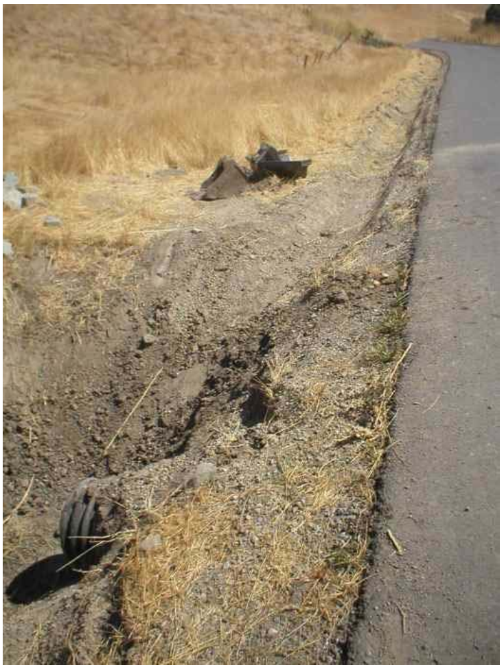
Figure 4 - NVC cleaned out culverts and v-ditch area along Moller Road during restoration activities, August 10, 2006.