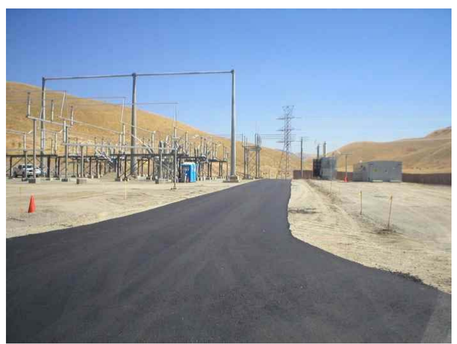
Figure 5 – Granite laid asphalt at the North Dublin Substation, August 10, 2006.