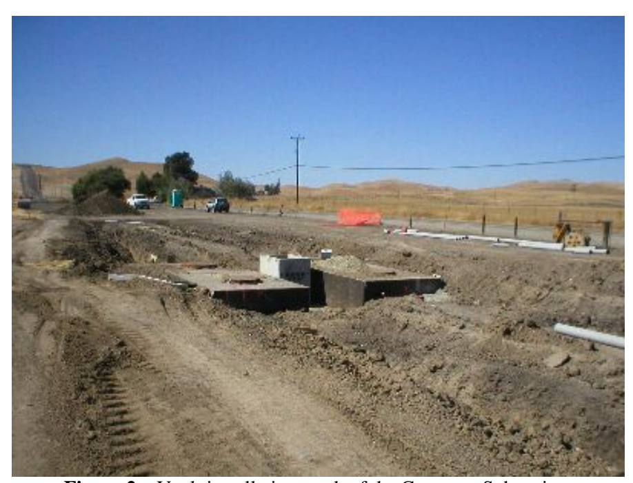
Figure 2 – Vault installation north of the Cayetano Substation, October 5, 2005.