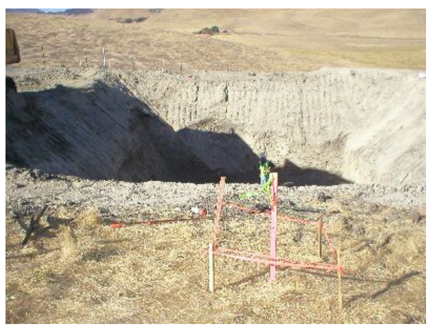
Figure 4 – Vault excavation at the transition station, October 5, 2005.