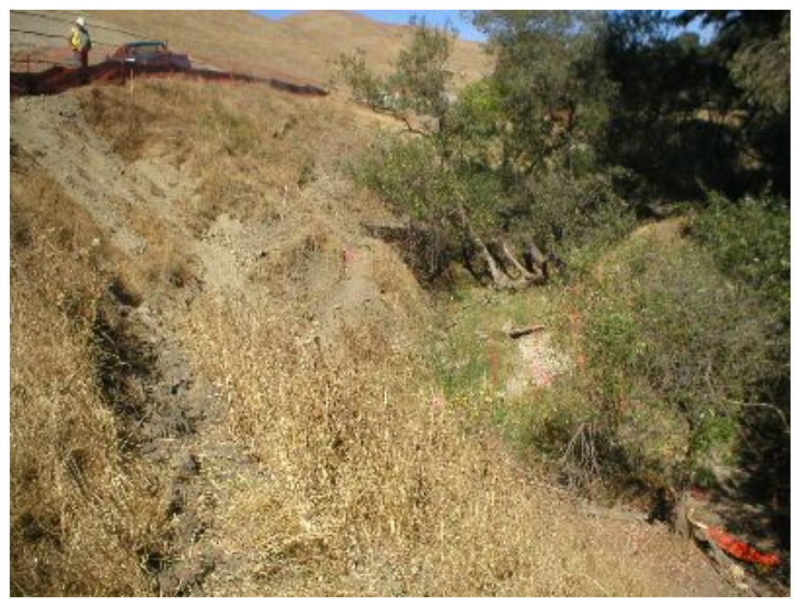
Figure 1 – Bank stabilization area within Tassajara Creek, October 4, 2005.