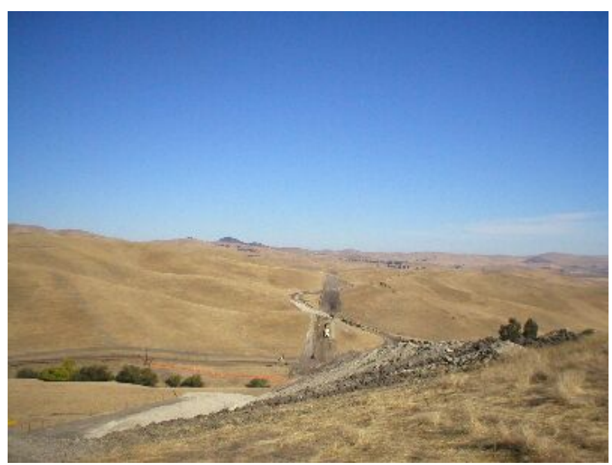
Figure 3 – Road 7 and underground alignment, October 5, 2005.