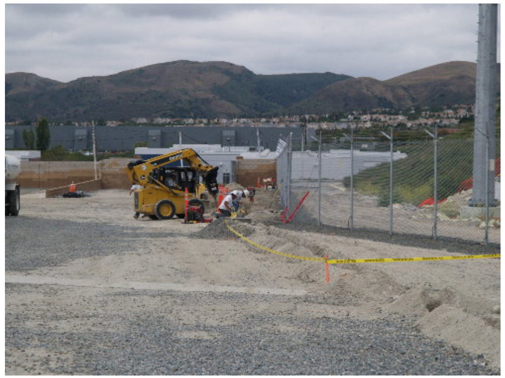
Figure 3 – KGC continued working on the trenching for the electrical needed for the light standards around the substation site.