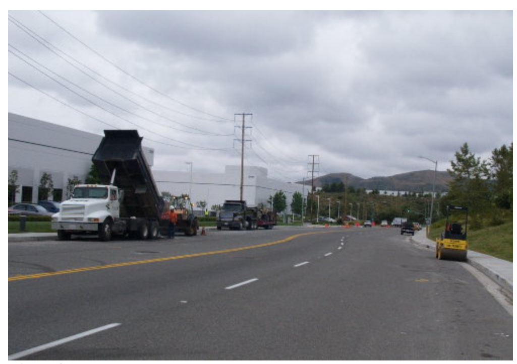
Figure 4 – Arizona Pipeline paved the trench-line and vault locations on Ellipse Road and across the intersection of Glenn Ranch Road.