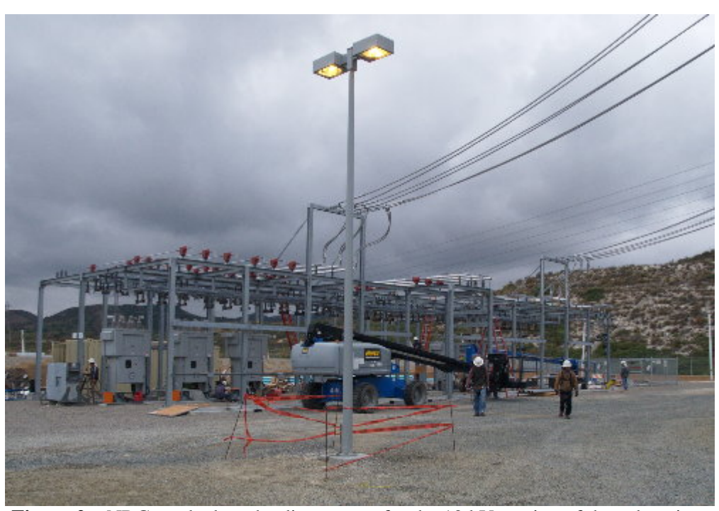
Figure 2 – NRG worked on the disconnects for the 12 kV portion of the substation.