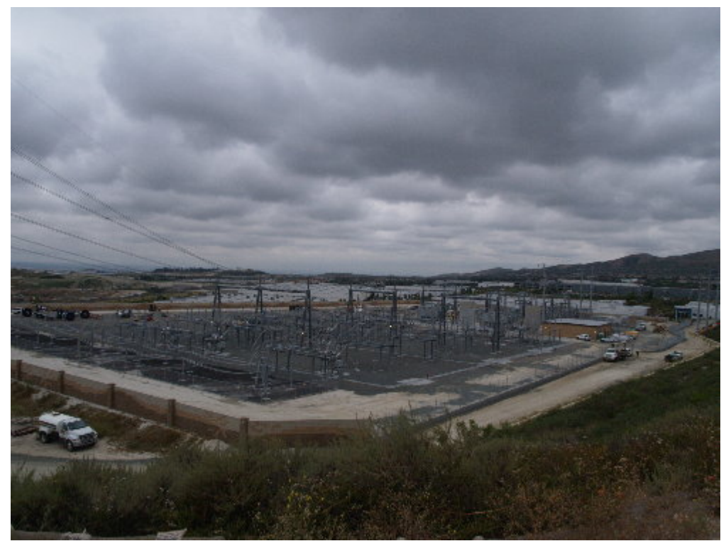
Figure 1 – Overview of the substation site after the 220 kV and 66 kV portions have been energized (66 kV section energized on May 31<sup>st</sup>).