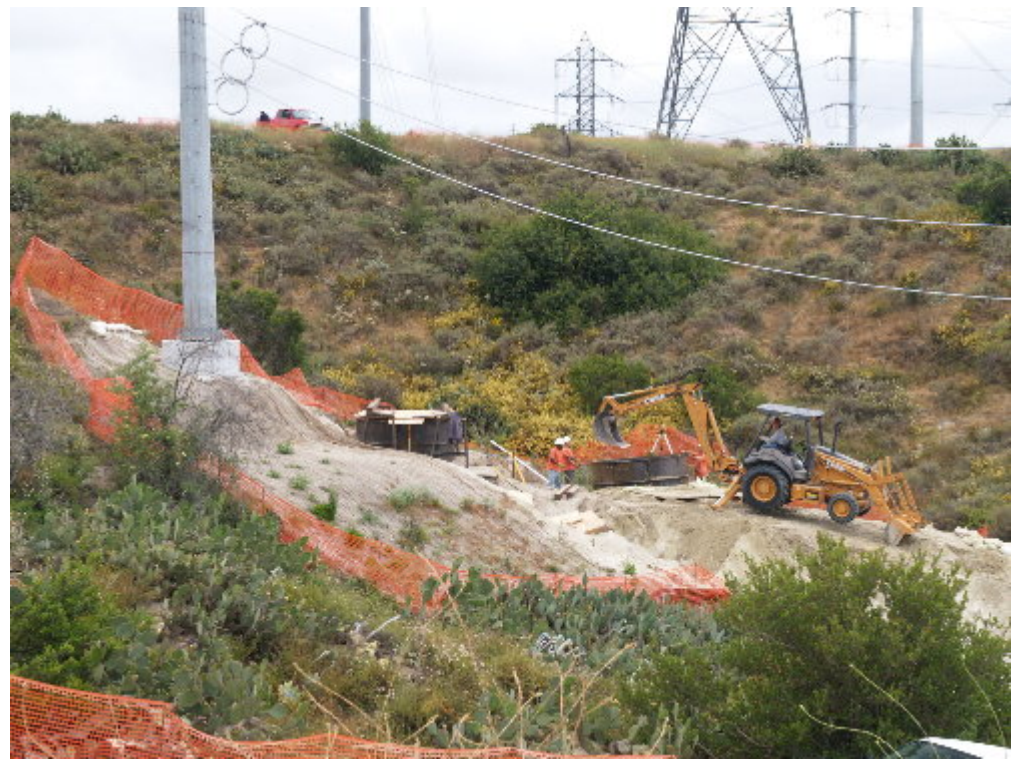
Figure 5 – The forms for the new foundations for Structure 13 were set during the site visit. The tops of the forms were covered for safety.