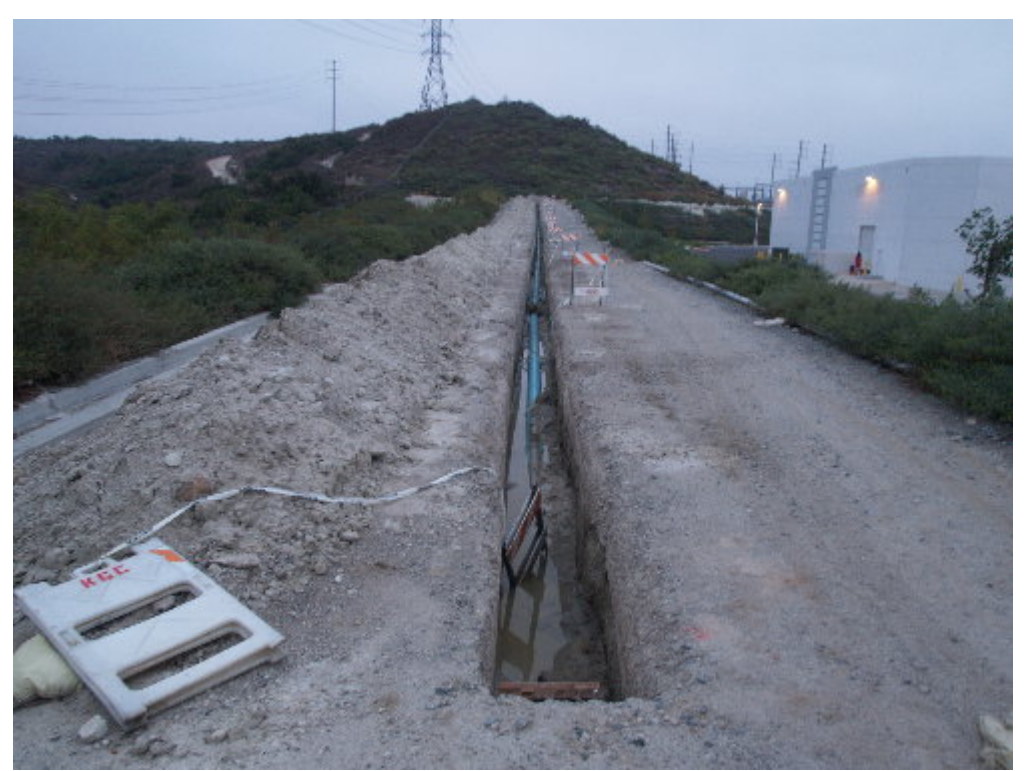
Figure 1 – The open trench on the main entrance to the Viejo Substation has partially drained, but water remains. Some of the pipe is now covered with silt.