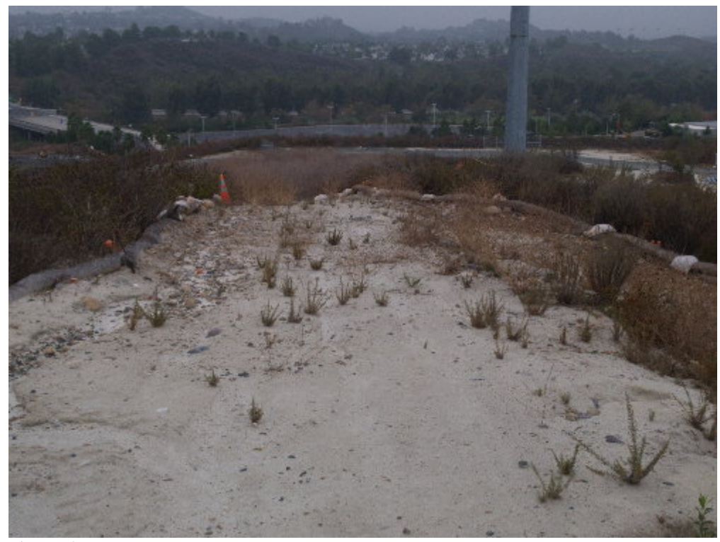
Figure 3 – Native vegetation is naturally returning to sections of the 220 kV right-of-way that have been undisturbed for several months.