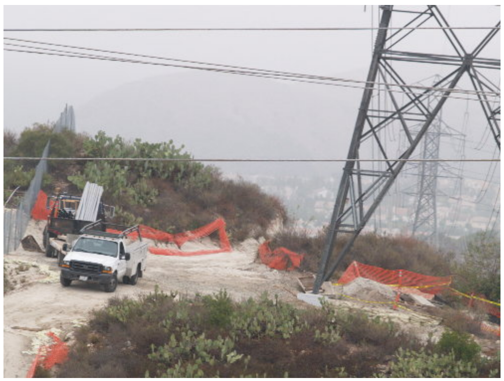
Figure 2 – A crew unrelated to the Viejo System Project installed communication conduit in the SCE right-of-way above the Viejo Substation.