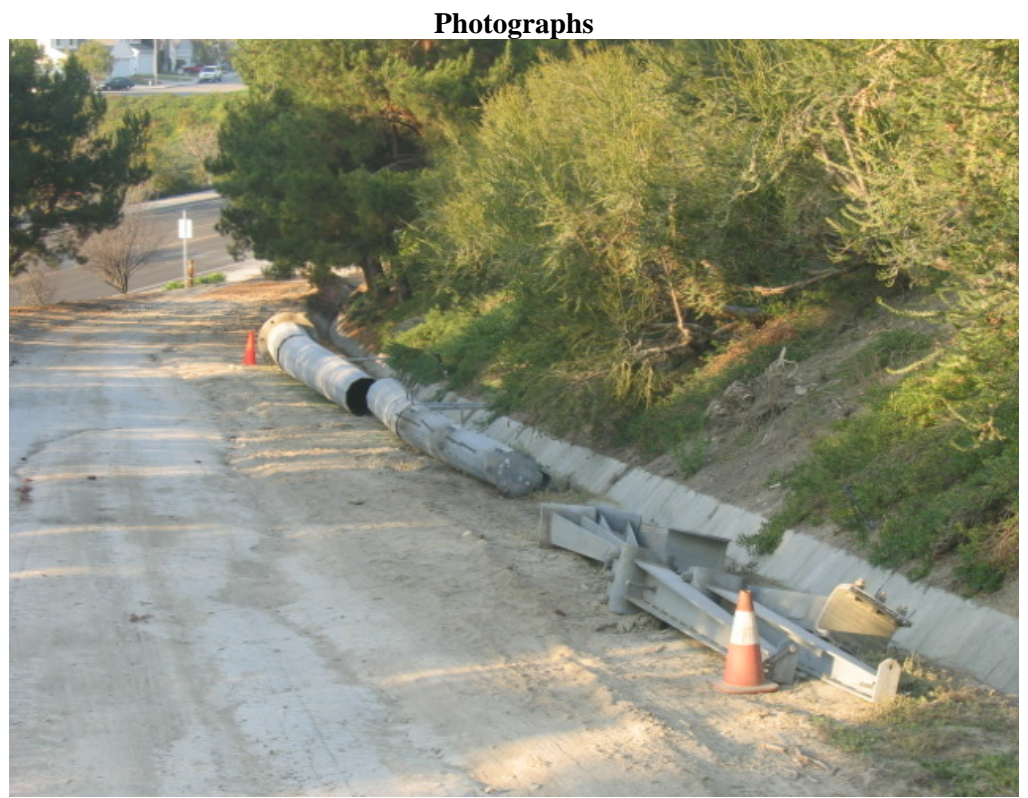
Figure 1 – Dismantled steel poles are cut up and removed from the right-of-way.