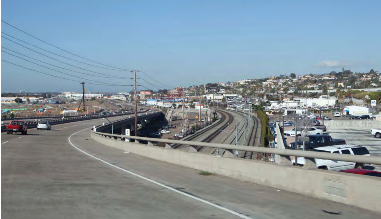
Existing view from PCH looking northwest