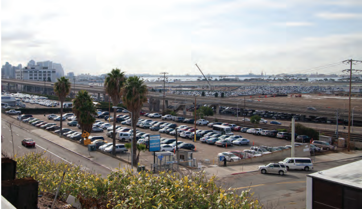
Existing view from I-5 Freeway southbound looking south west