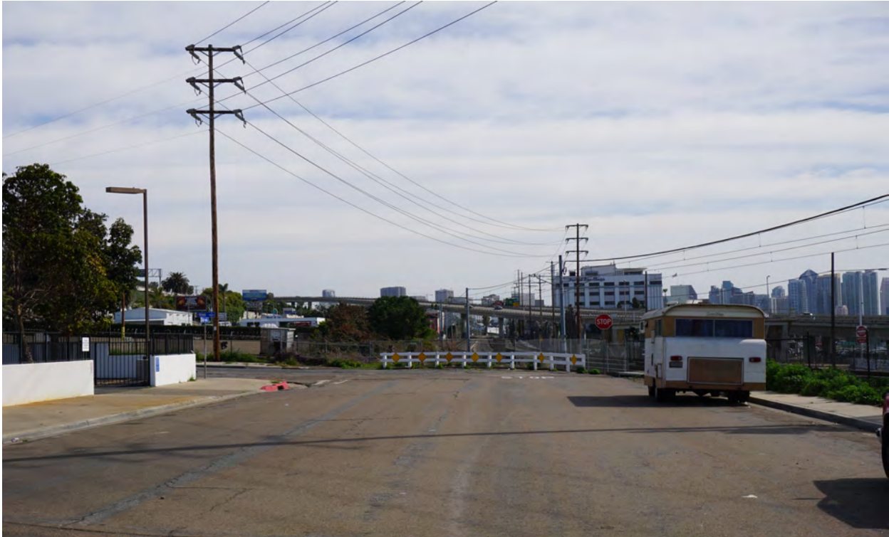
Existing view from California Street looking south-southeast