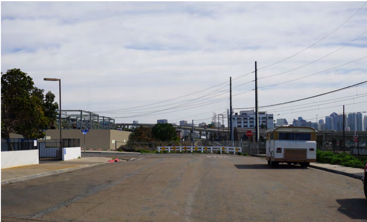
Visual simulation of the proposed Vine Substation and 69-kV loop-in