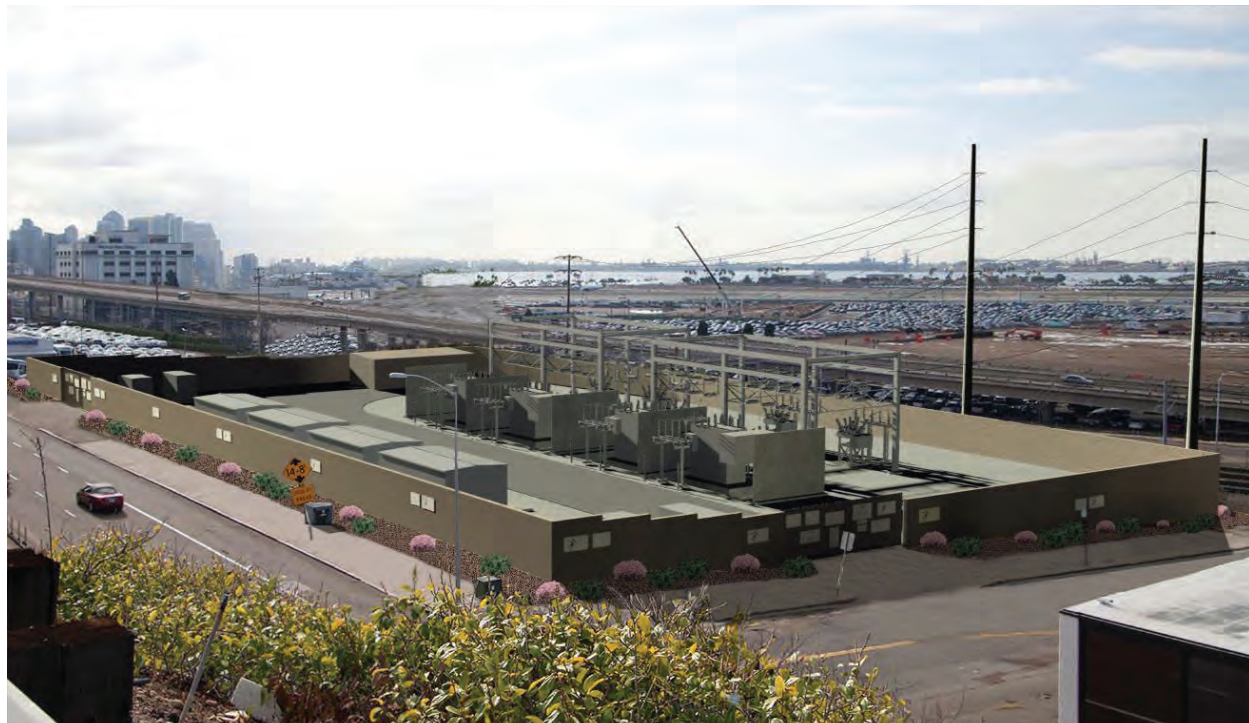
Visual simulation of proposed Vine Substation