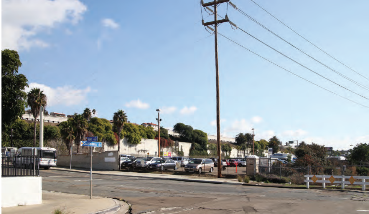
Existing view from California Street near Vine Street looking southeast