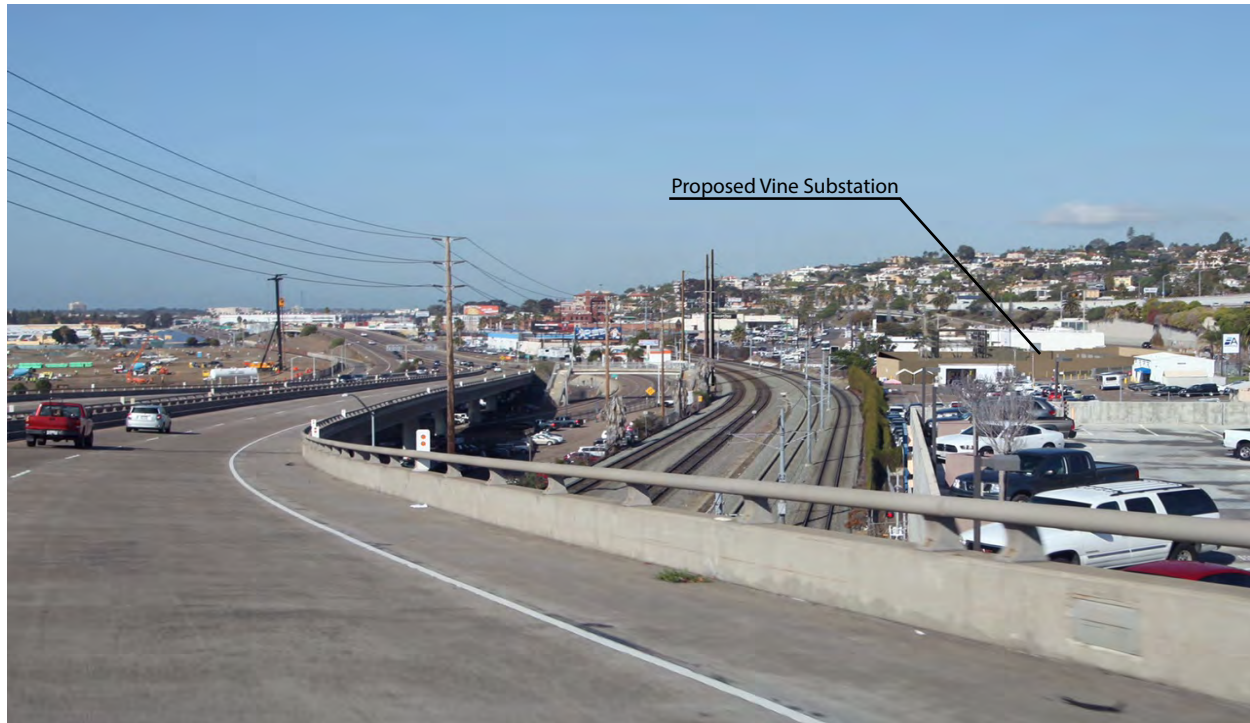
Visual simulation of proposed Vine Substation