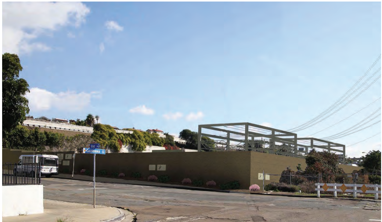
Visual simulation of the proposed Vine Substation