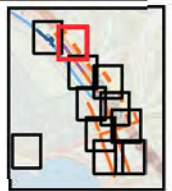
Figure B.1-3b: Detailed Project Components

Note: Underground alignments area preliminary and will not be finalized until final engineering is complete.