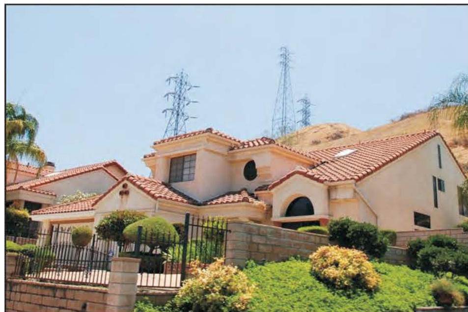
Photo 5. Segment 2 in Loma Linda by Prado Lane