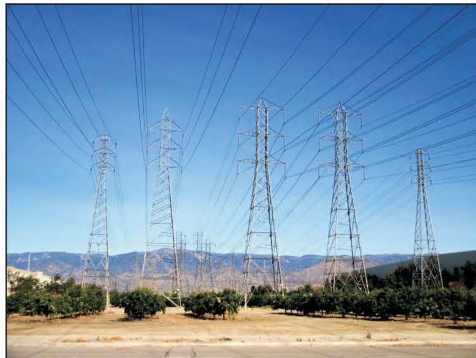
Photo 1. Segment 1 looking south from San Bernardino Substation