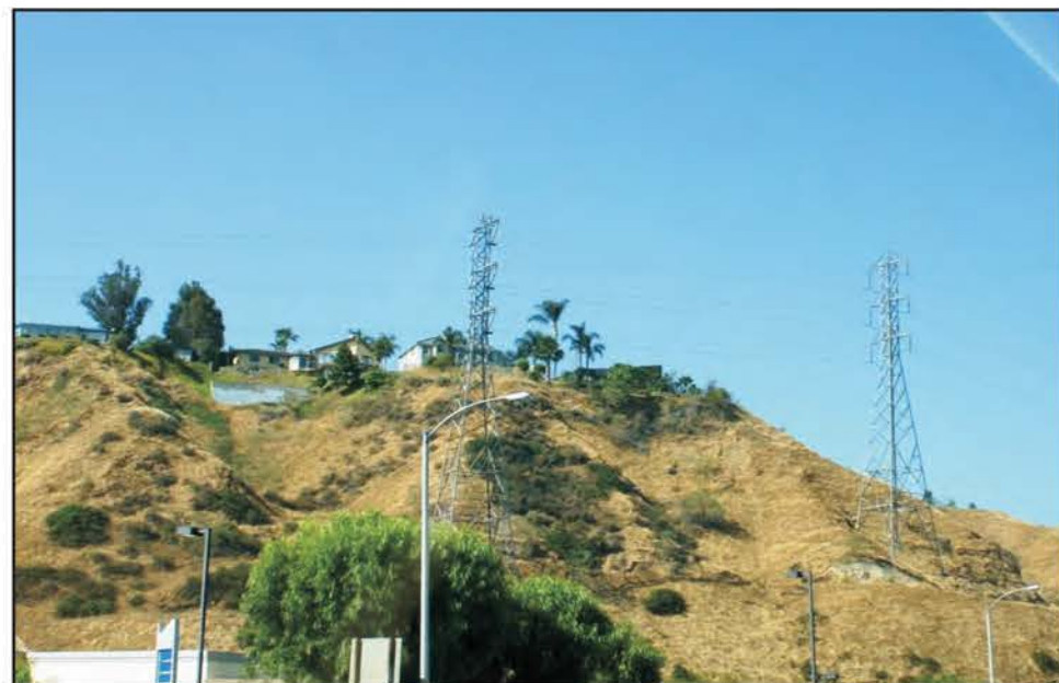
Photo 4. Segment 2 in Colton by Vista Grande Way