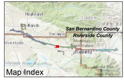
FIGURE 2 Southern California Edison West of Devers Upgrade Project Devers-Vista OPGW Connection from 4X35 to Oak Valley Parkway Proposed Disturbance Areas MPR #22