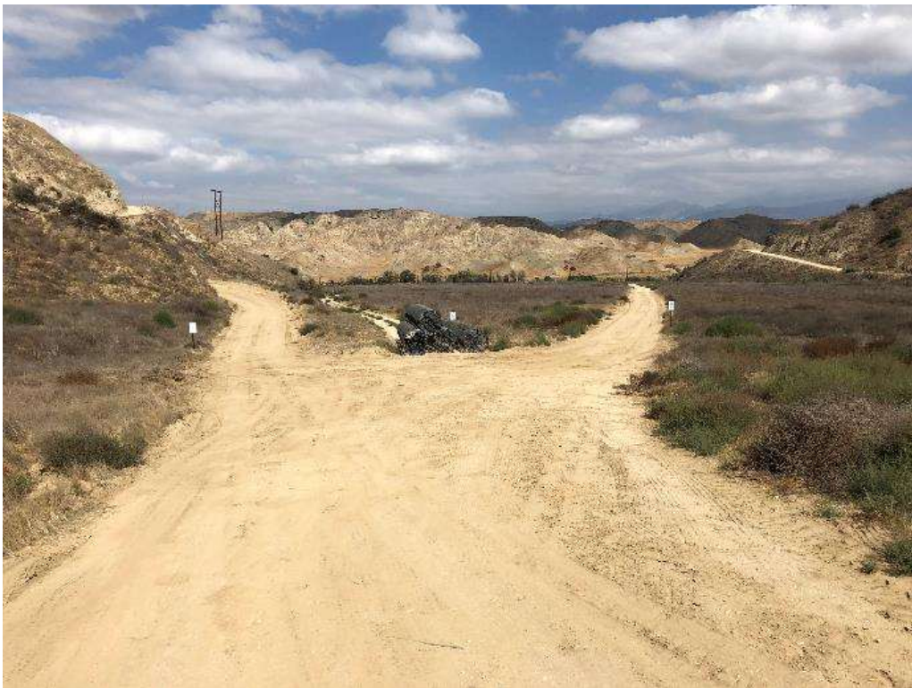
Photo 8 – Foundation cages staged outside approved limits near Site 3X20, Segment 3 (October 11, 2018).