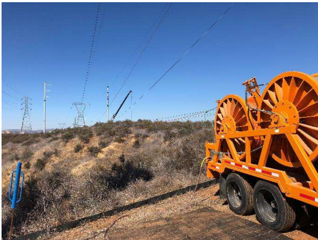
Photo 6 – Reeler set up for wire pulling activities between Sites 4X55 and 4N64, Segment 4 (October 8, 2018).