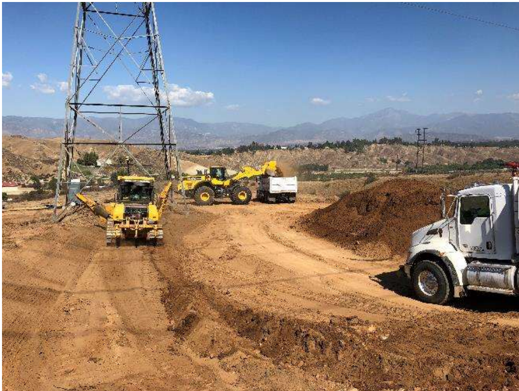
Photo 4 – Grading activities occurring at Site 3X57, Segment 3 (October 8, 2018).