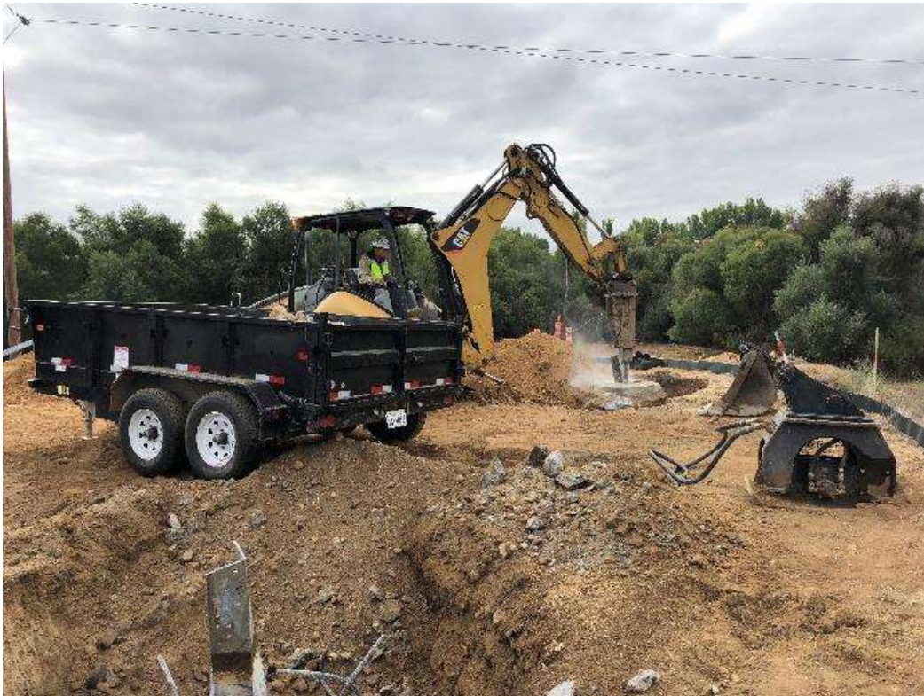
Photo 5 – CDC crew performing foundation demolition at Site 4N62, Segment 4 (October 11, 2018).