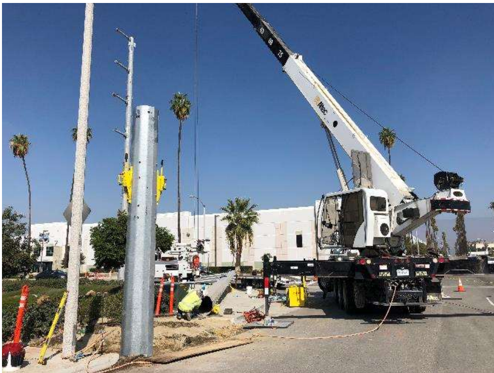
Photo 2 – Erection of LWTSP along Tennessee Relocation (October 9, 2018).