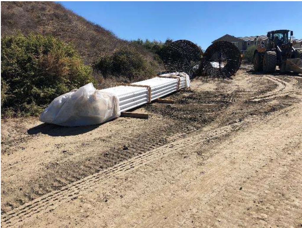
Photo 7 – Proper covering of pipes observed at Site 4S60, Segment 4 (October 8, 2018).