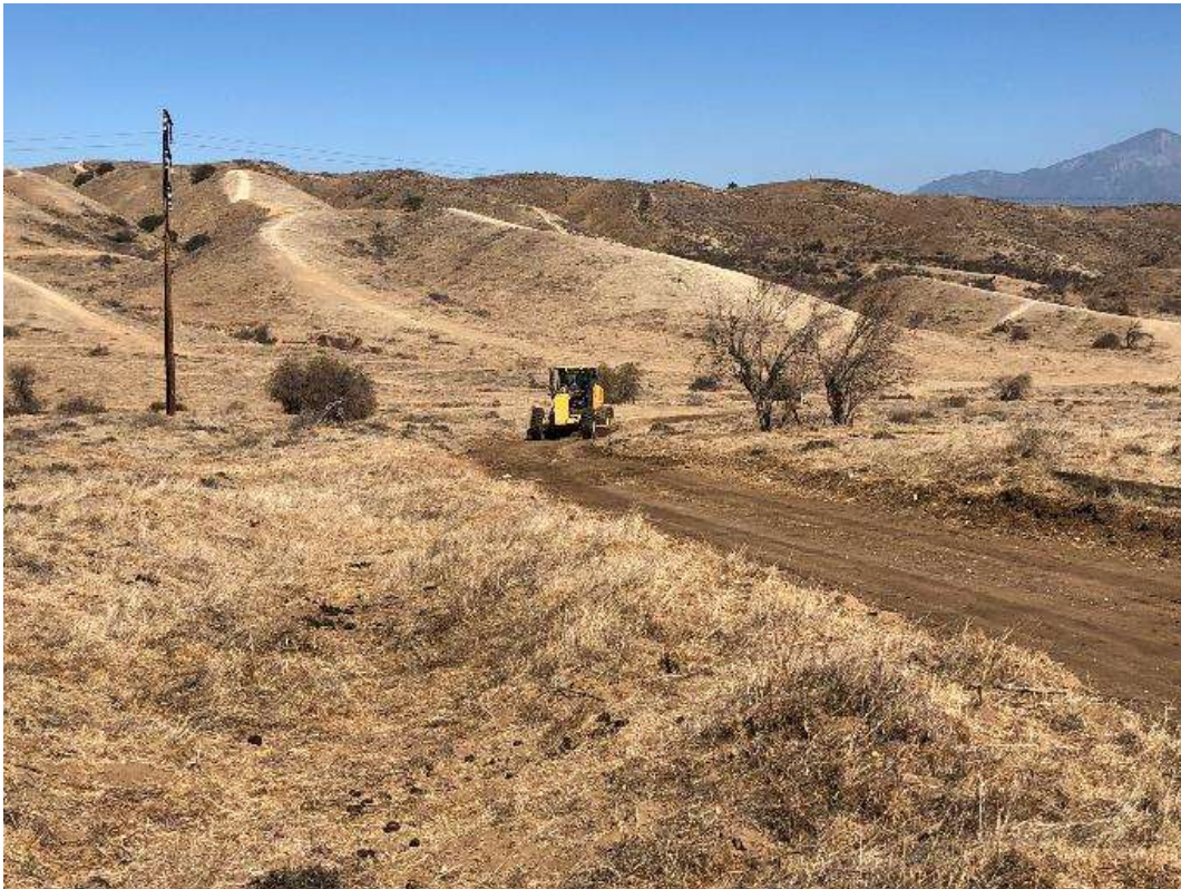
Photo 3 – Conducting road maintenance between Sites 3X50 and 3X62, Segment 3 (October 9, 2018).