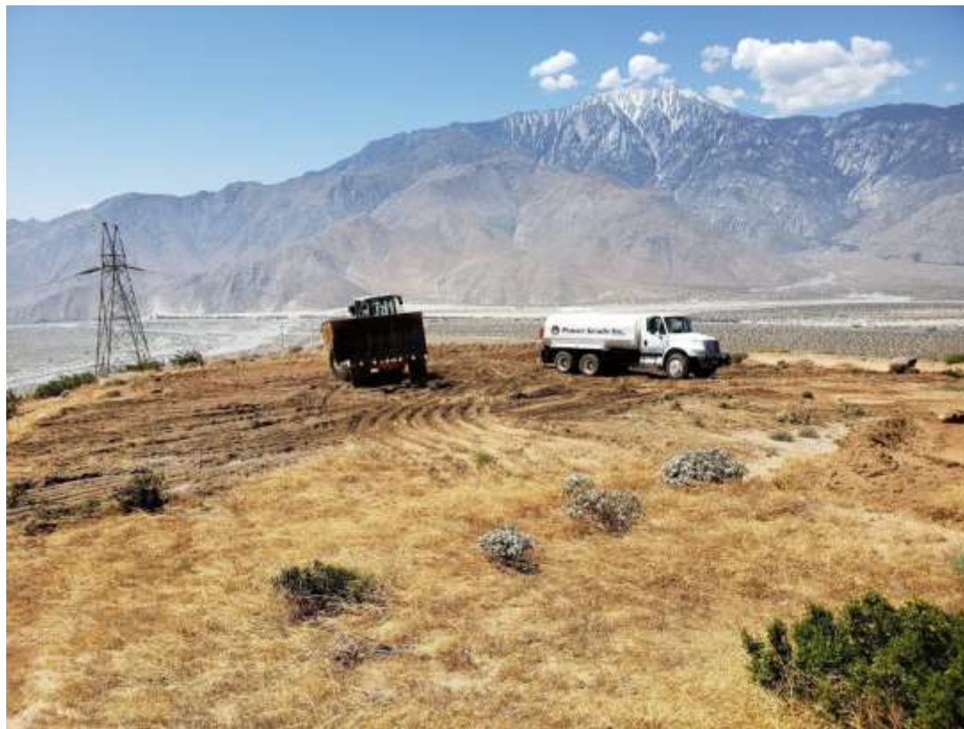
Photo 4 – Clearing, grubbing, and soil grading activities on Segment 6 (June 3, 2019)