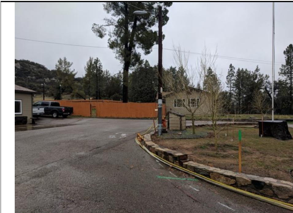
Photograph 2: North-facing view of the existing conditions at the requested temporary underground workspace at Pole P222133.