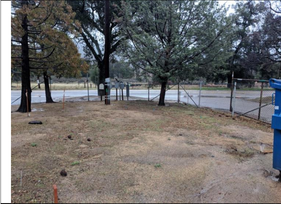
Photograph 3: East-facing view of the existing conditions at the requested temporary underground workspace at Pole P222132.