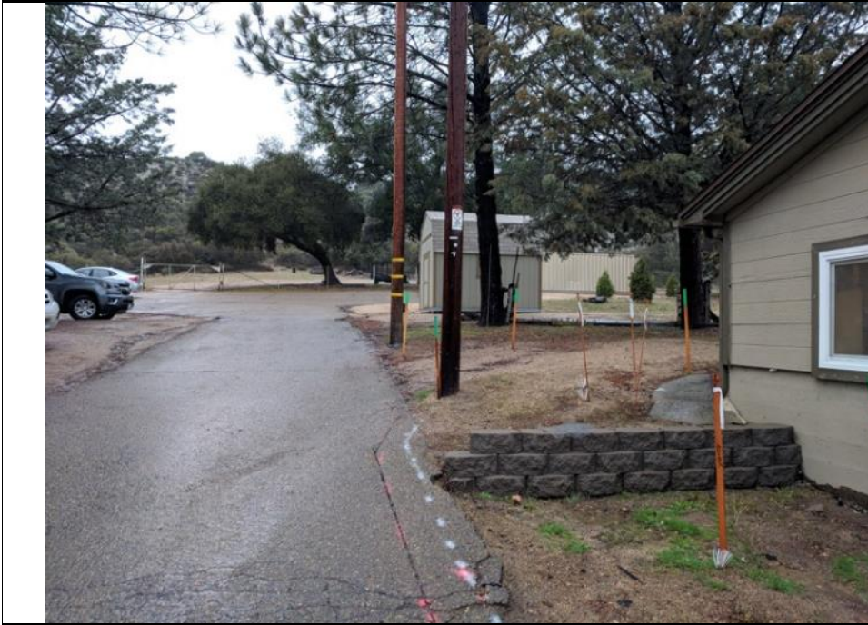
Photograph 1: West-facing view of the existing conditions at the requested temporary underground workspace at Pole P42735.