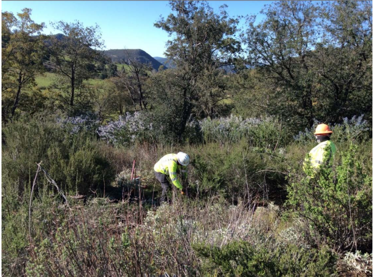
Photo 2: A biological monitor was observed monitoring vegetation removal at P259374 (TL 626 Conversion North (C 222)) in accordance with MM BIO-3 and MM BIO-22.