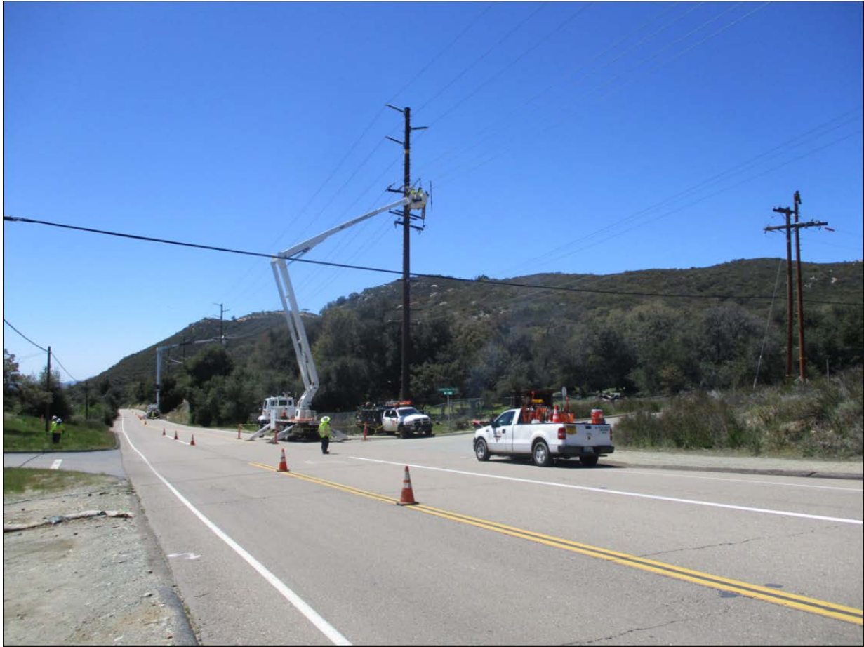
Photo 6: During clipping in of 12-kilovolt wire at Z272989 (TL 625C), personnel directed one-way traffic along Japatul Valley Road in accordance with APM TRANS-02.