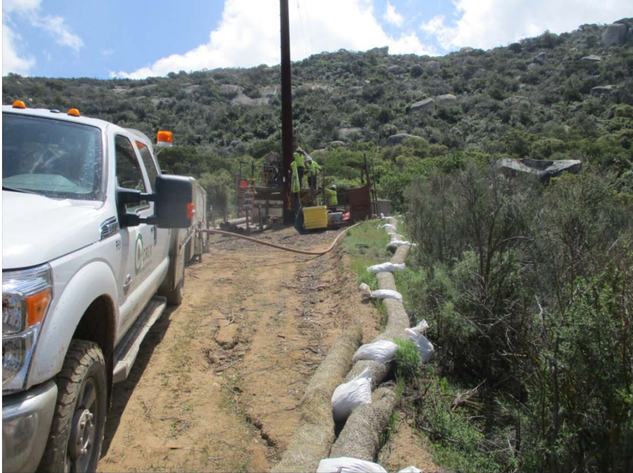
Photo 3: Perimeter fiber rolls at a micropile location along TL 6923 were weighted down with gravel bags instead of being trenched into the ground in order to prevent ground disturbance in an area with a higher potential for cultural resources, in accordance with the HPMP (MM CUL-1) and APM CUL-03.