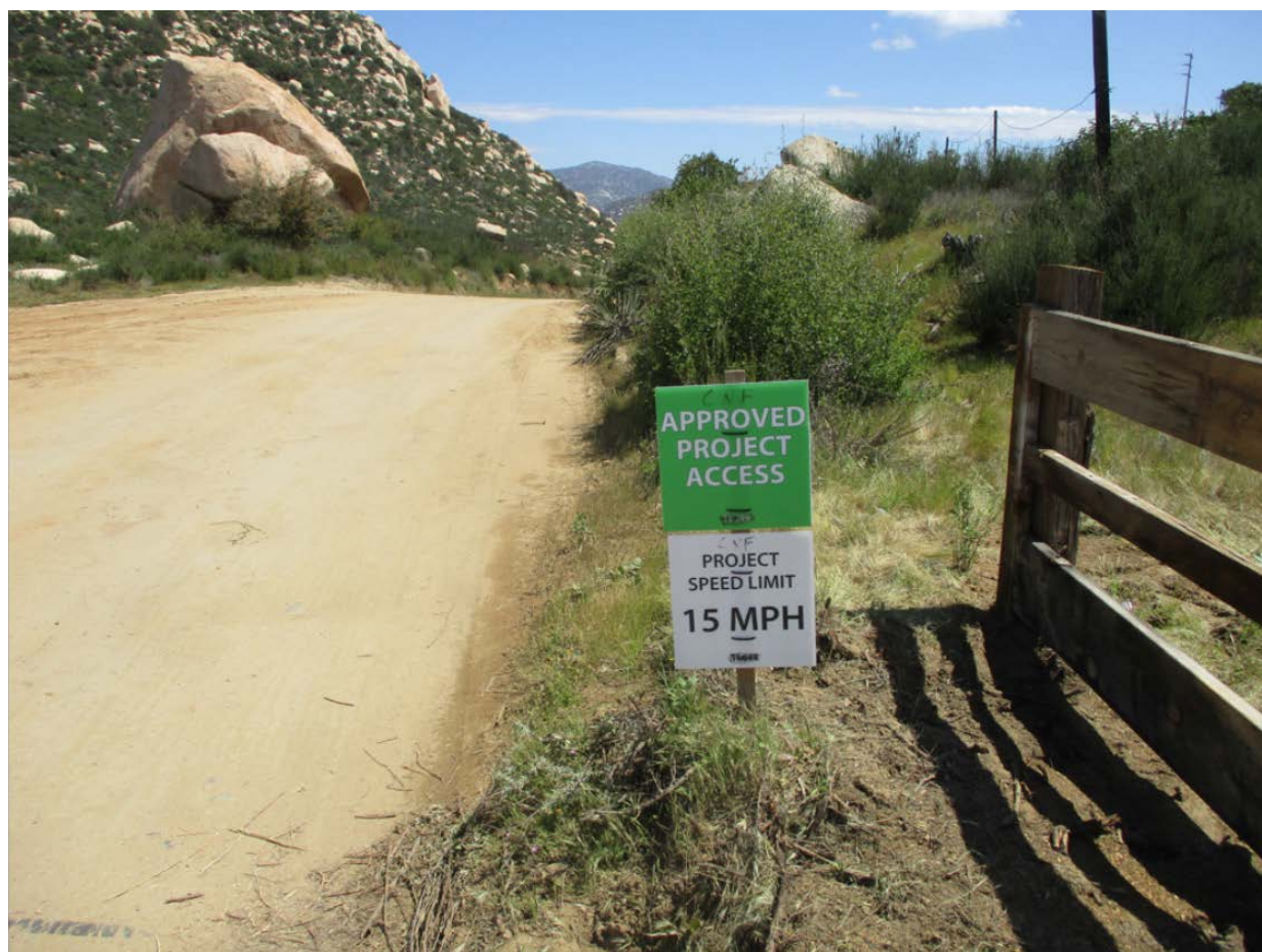
Photo 1: In accordance with APM AIR-03 and MM BIO-24, project personnel were observed abiding by the posted 15 mph speed limit (access road off Round Potrero Road near Z972808 (TL 6923)).