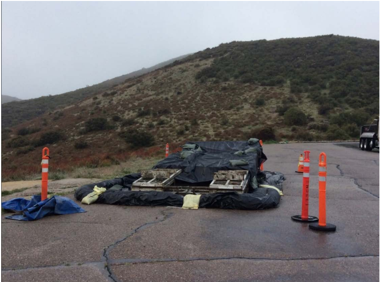
Photo 5: A designated concrete washout station at Staging Area 1 (C 440 Phase I) was observed to be covered in the morning, indicating that it had been covered during recent rain events in accordance with the project's SWPPP (MM HYD-1 and MM BIO-7).