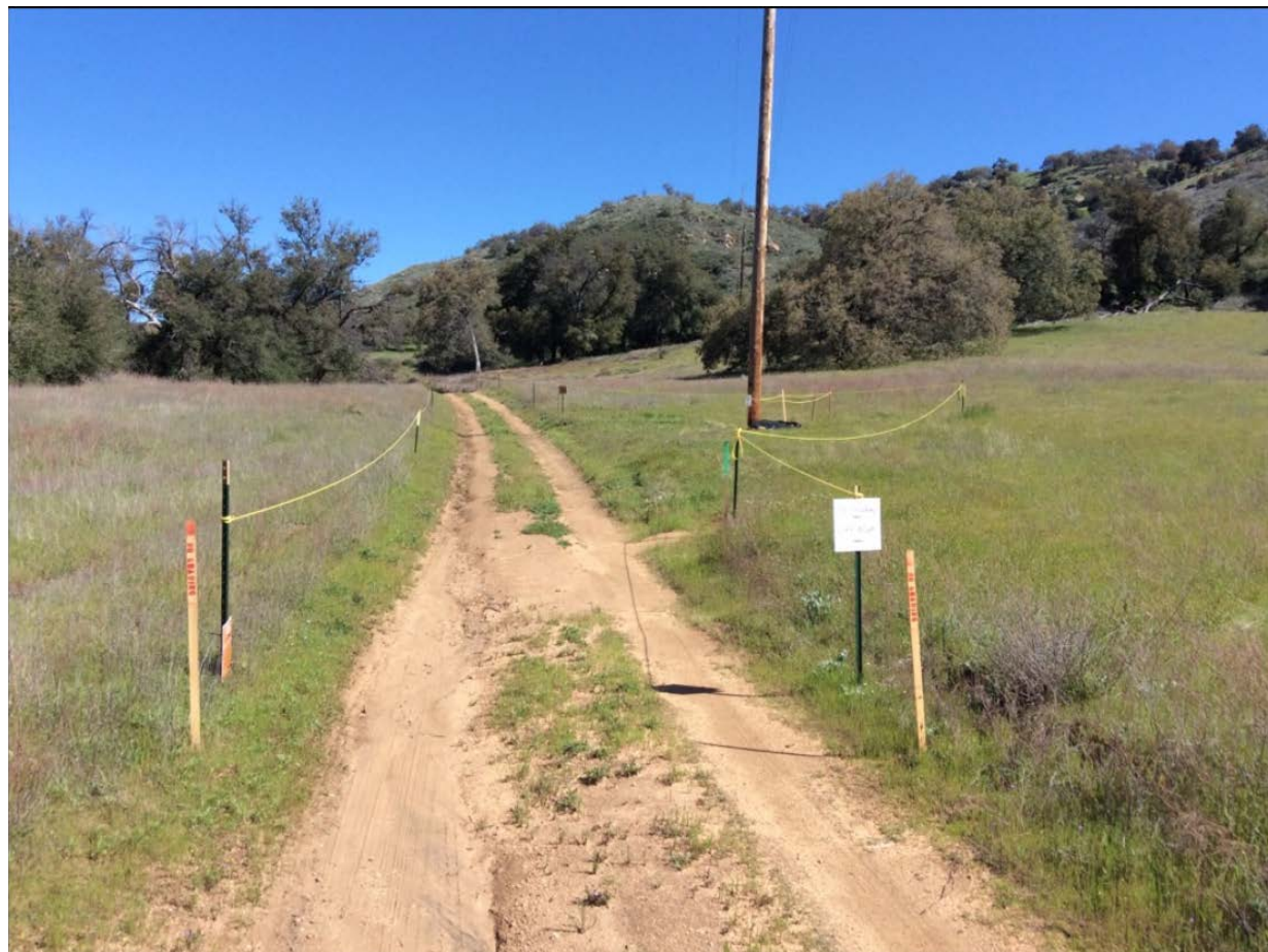
Photo 4: A cultural ESA surrounding a pole and access road along TL 626 Conversion North (C 222) was clearly delineated, and “no grading” signage was present on the road in accordance with the HPMP (MM CUL-1) and APM CUL-03.