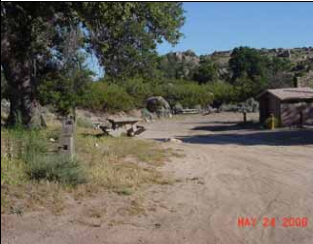
Campground facilities have surface disturbance areas as well as adjacent vegetated areas.