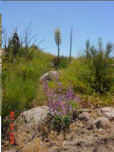
High variety of forms, line, color, pattern, and texture; seasonal color adds to visual interest.