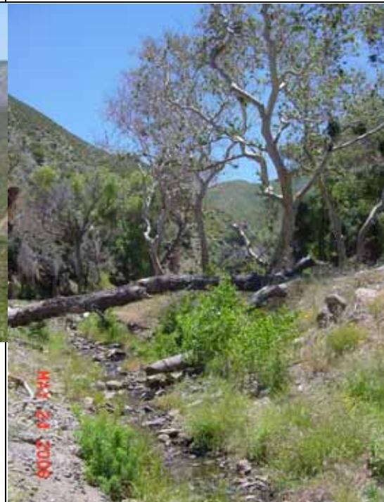
Large trees and intermittent flow along drainages are visually attractive and result in increased biodiversity and enhanced scenic quality.