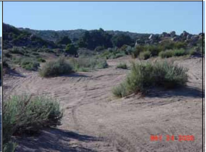
OHV area is characterized by open areas with little or not vegetative cover.