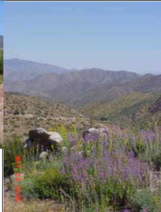
Dirt road cuts contrasts with adjacent non-disturbed areas in color and texture but do not dominate. Openness of landscape allows views of distant remote mountains.