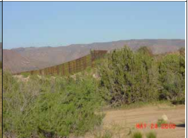
Metal border fence extends along southern tip of the mesa, partially up the mesa slopes.