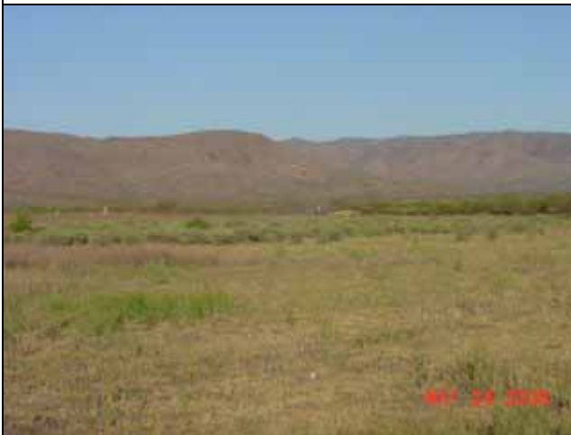
Landforms of mesa and adjacent mountains provide vertical relief in contrast to relatively level adjacent lowlands. Little or no variety and contrast in vegetation.