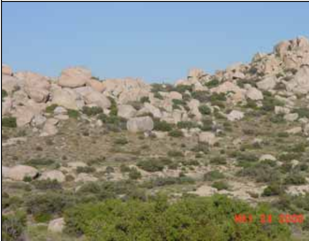
Rugged terrain of boulders and rock outcrops, and contrasting colors and texture of vegetation patterns.