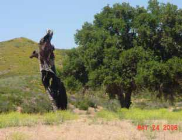
Large oaks and snags, particularly in the Grapevine Canyon / east side, provide visual interest, raptor nesting areas, and contribute to overall scenic quality.