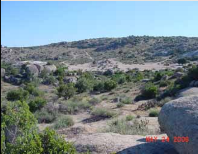
View of Lark Canyon OHV Area: surface disturbance contrasts strongly with adjacent non-disturbed areas in color and texture.