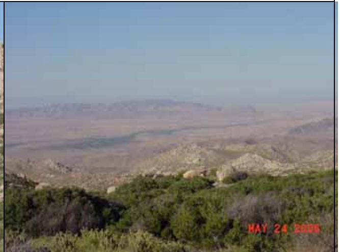
Drier, more rugged terrain in transition zone to Carrizo Gorge Wilderness area.