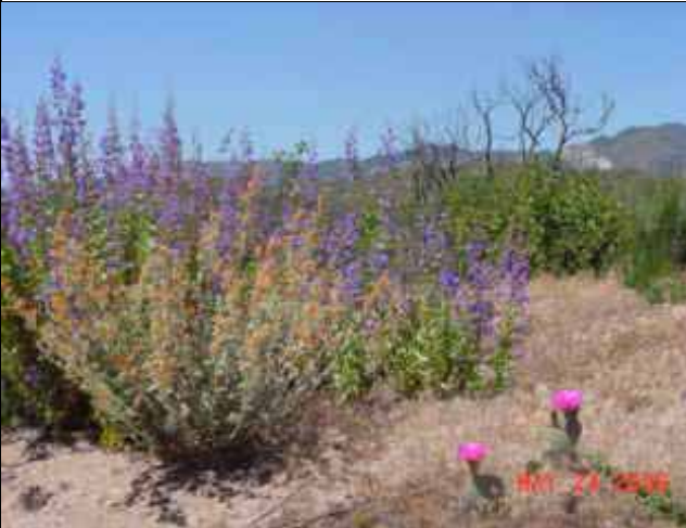
Variation in plant species and structure provides visual contrast; seasonal color of flowers is appealing. Rich color combinations are common.