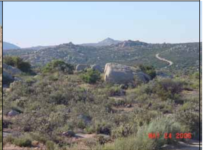
Distant road cut contrasts with adjacent non-disturbed areas in color and texture (view north).