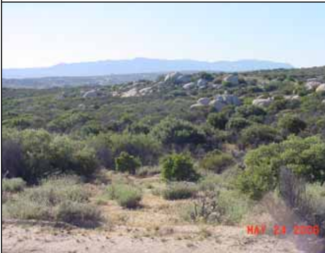
Boulders and relatively dense vegetation near Sacatone overlook area. Patches of less dense vegetation and lighter colors provide visual contrast.