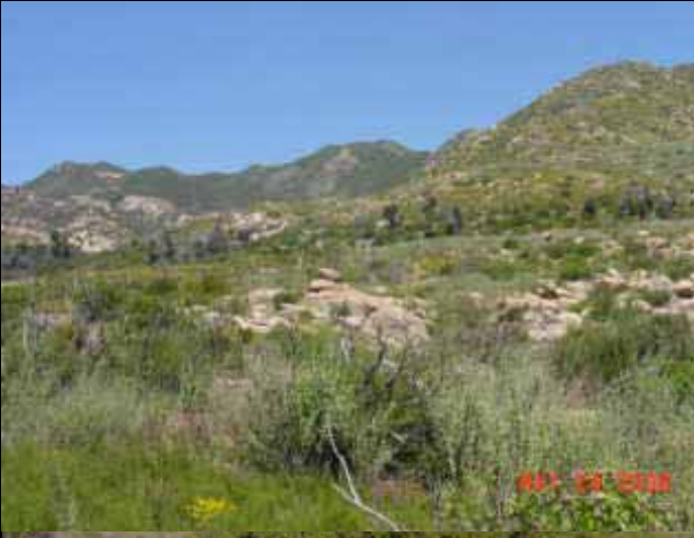
Steep to moderately sloped hills and mountainous, rugged terrain; numerous boulders and rock outcrops; contrasting colors and texture of vegetation patterns.