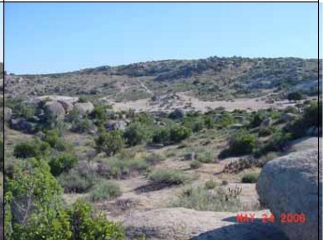
Transition between McCain Valley West area and Lark Canyon OHV Area: surface disturbance contrasts strongly with adjacent non-disturbed areas in color and texture.