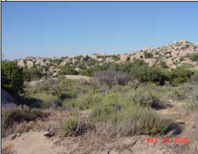
Boulders and relatively dense vegetation near Sacatone overlook area. Patches of less dense vegetation and lighter colors provide visual contrast.