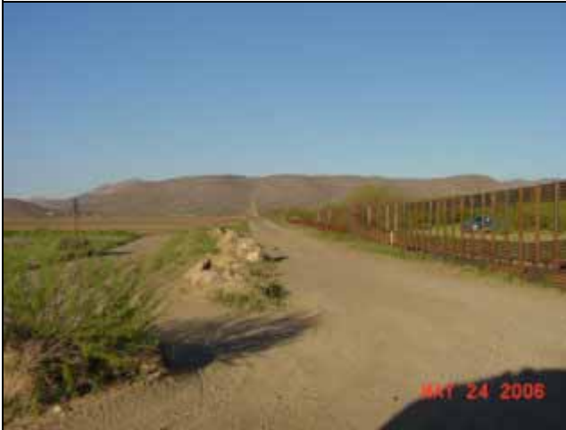
Rounded form of mesa rises from adjacent agricultural lands; graded road along International Border has a strong linear form and moderate to high visual contrast with adjacent undisturbed hillslopes. Metal border fence extends along southern tip of mesa, partially up the mesa slopes.