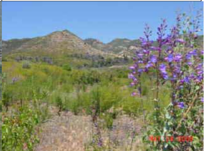
Low level of cultural modification and adjacent undisturbed lands contribute to sense of remoteness.