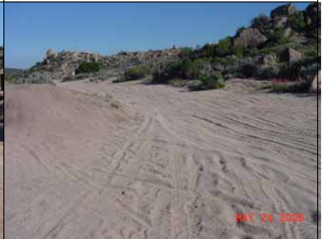
OHV use of sloped terrain results in noticeable visual contrast and scarring and erosion.