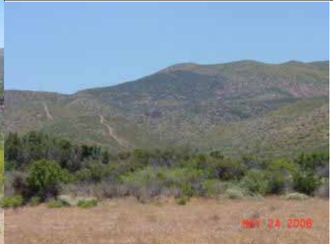
Road cuts are visible but are few and do not dominate.