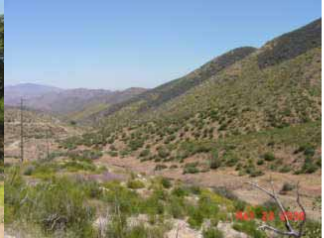
Area appears to receive relatively light use and vegetative cover is mostly intact. Overhead lines and poles are visible but do not dominate. Most of the area is highly visible in the foreground view from County Route S2, and from the unpaved roadway that follows Grapevine Canyon.