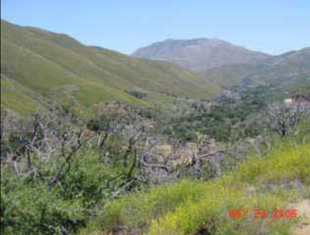
Openness of landscape allows views of distant remote mountains and valley floor. Vegetative density is higher along drainageways and results in contrasting darker patches of oaks and other plants, increased visual variety and enhanced visual quality.