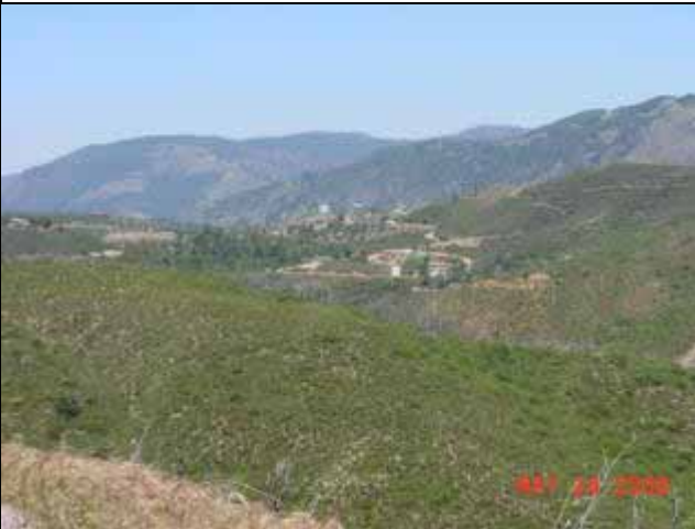
Adjacent development and structures in Whispering Pines area are noticeable and result in visual contrast in form, line, color and texture, but are not strongly discordant.