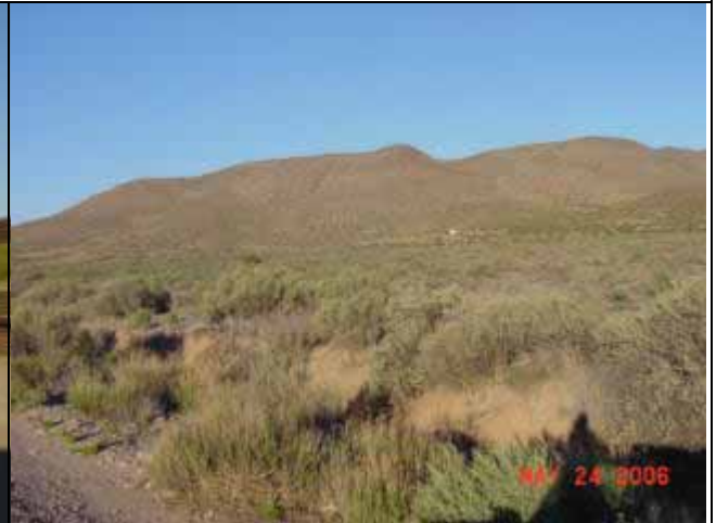
Vegetation of mesa and adjacent lowlands is relatively uniform in texture and color, with subtle differences in muted tones noticed at closer viewing range.