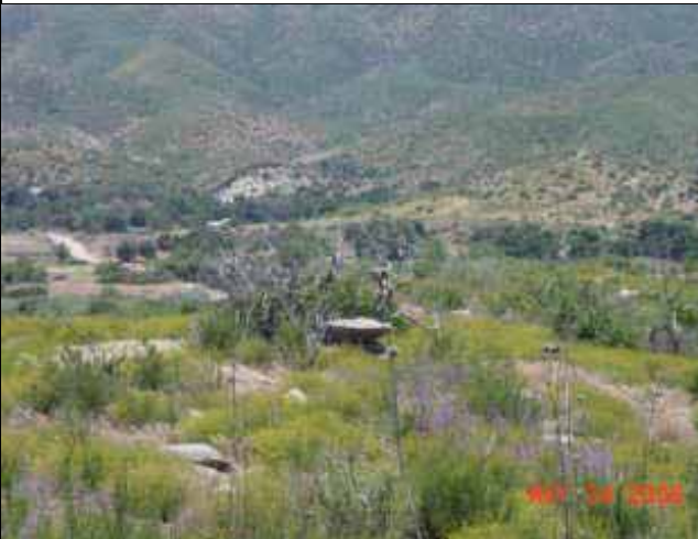
Variation in plant species, color and structure provides visual contrast. Dirt road cuts contrasts moderately with adjacent non-disturbed areas in color and texture.