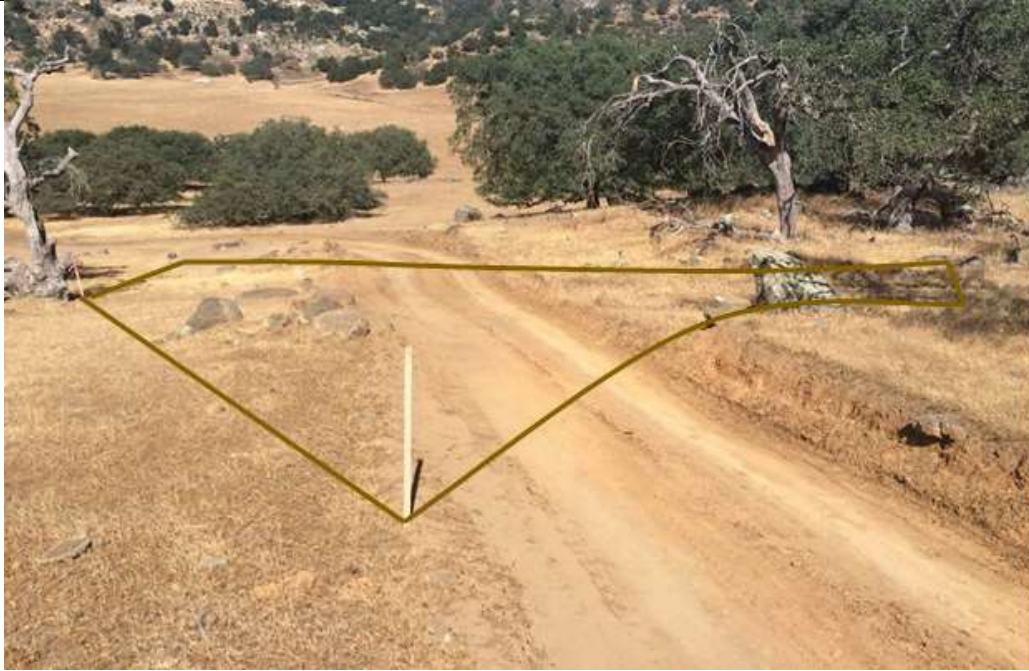
Photograph 3: Proposed SS-18 temporary workspace area (outline in brown), facing east.