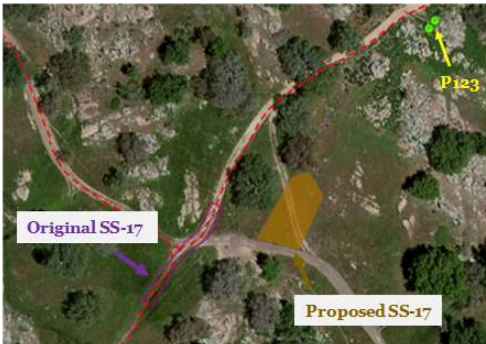
Figure 2: Aerial image of proposed Stringing Site No. 17 located southwest of Structure No. P123.