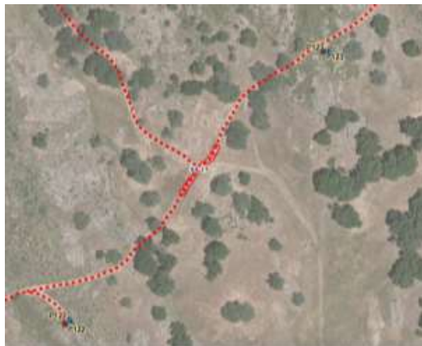
Figure 1a: MPR Overview Map showing the original stringing site location (SS-17), adjacent pole locations, and the existing approved Project access roads (dashed red lines).

Figures 1a and 1b (extracted from PEA Appendix 3-B, Sheet 35 of 50 and 44 of 55 respectively) depicts the originally proposed temporary workspace areas for Stringing Site Nos. 17 and 18. Figures 2, 3 and 4 depict the proposed new temporary workspace areas for SS-17, SS-17A and SS-17B, and SS-18, respectively. Photograph Nos. 1, 2 and 3 show the existing conditions and proposed new temporary workspace boundaries for SS-17, SS-17a and SS-17B, and SS-18, respectively.