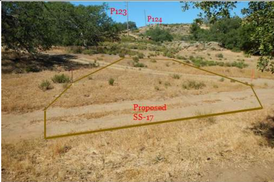
Photograph 1: Proposed SS-17 temporary workspace area (outlined in brown), facing east.