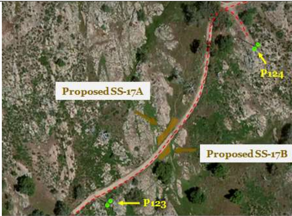
Figure 3: Aerial image of proposed Stringing Site Nos. 17A and 17B, located between Structure Nos. P123 and P124.