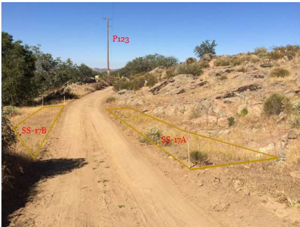
Photograph 2: Proposed SS-17A and SS-17B temporary workspace areas (outlined in brown), facing west.