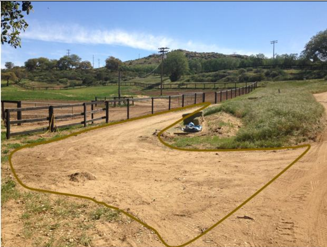
Photograph 4: Proposed temporary turn-around area (TA-4), facing northeast.