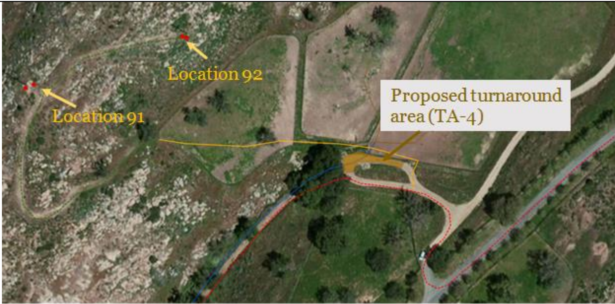
Figure 4: Aerial Image of proposed turn-around area (TA-4) southeast of Structure Nos. P91 and P92. Segment of overland travel route is shown as orange line.