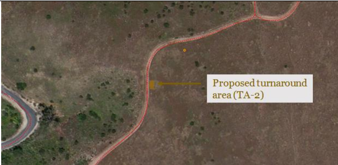
Figure 2b: Close-up Aerial Image of proposed turn-around area (TA-2) along main access road.