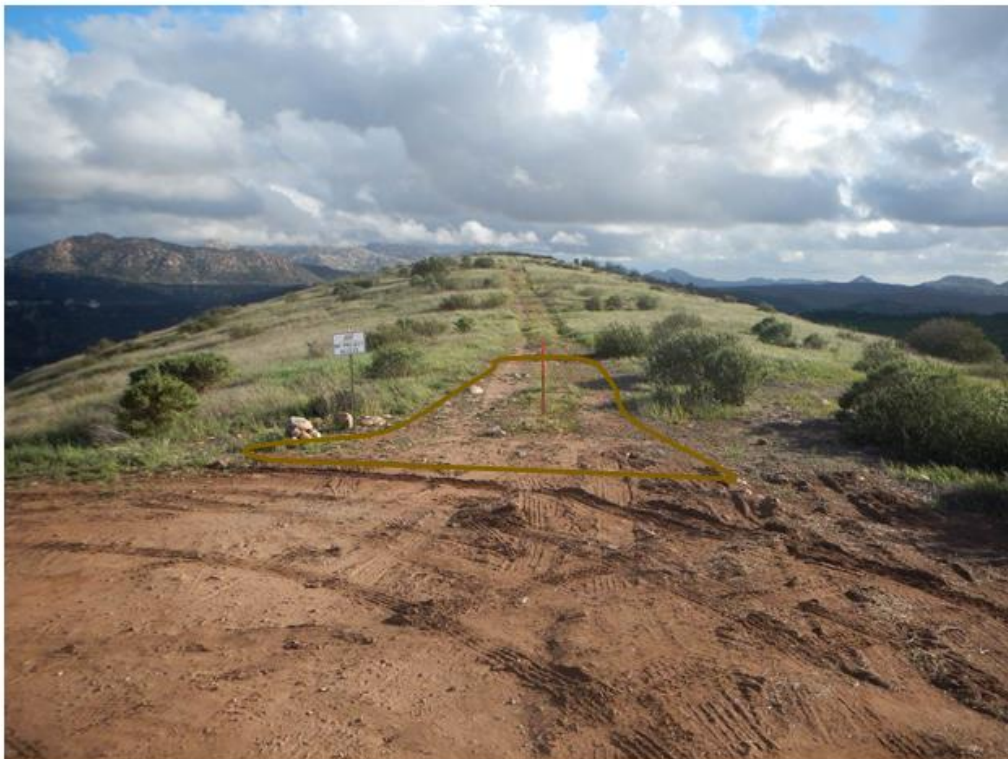
Photograph 3: Proposed temporary turn-around area (TA-3), facing south.