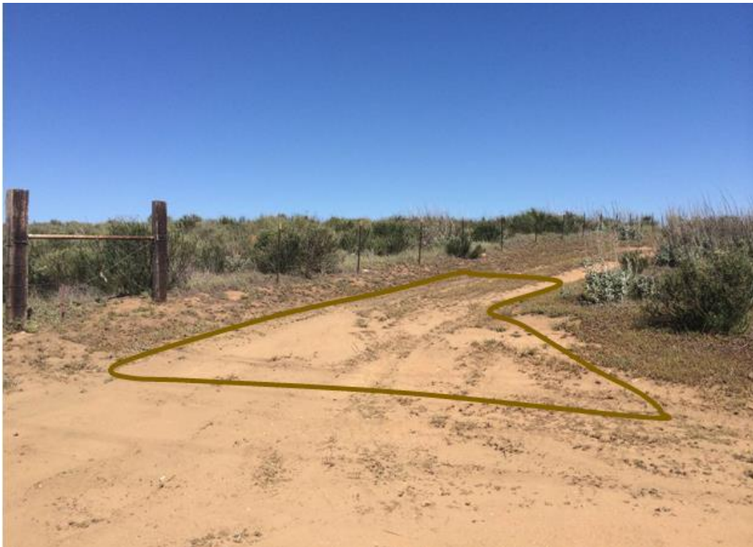
Photograph 5: Proposed temporary turn-around area (TA-5), facing northwest.