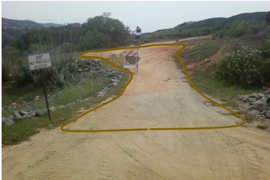
Photograph 1b: Proposed temporary turn-around area (TA-1), facing south.