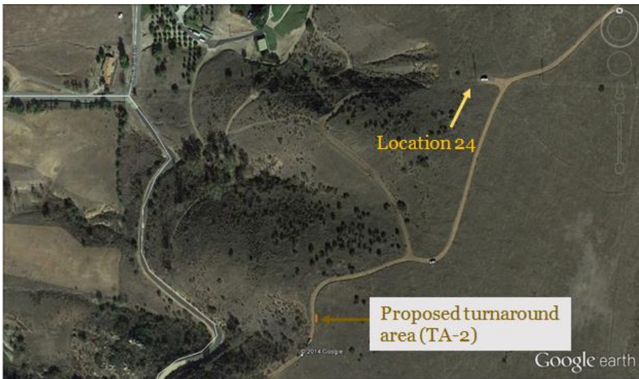
Figure 2a: Aerial Image of proposed turn-around area (TA-2) south of Structure No. P24 along main access road.