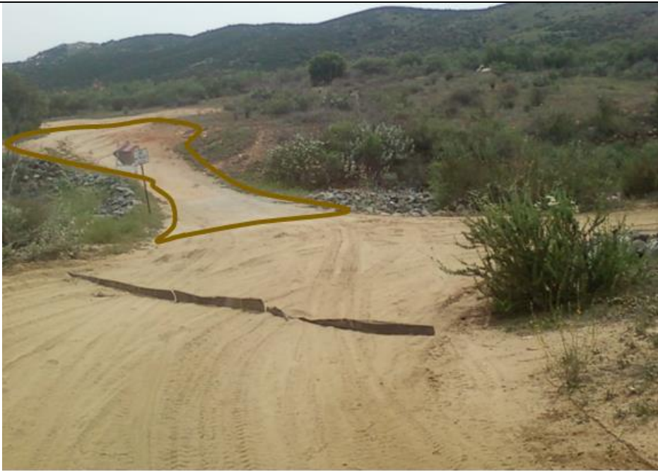
Photograph 1a: Proposed temporary turn-around area (TA-1), facing southwest.