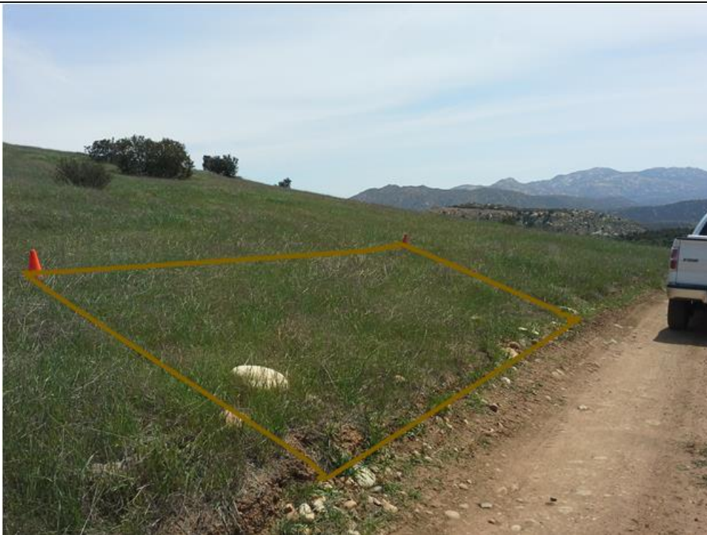
Photograph 2: Proposed temporary turn-around area (TA-2), facing southeast.