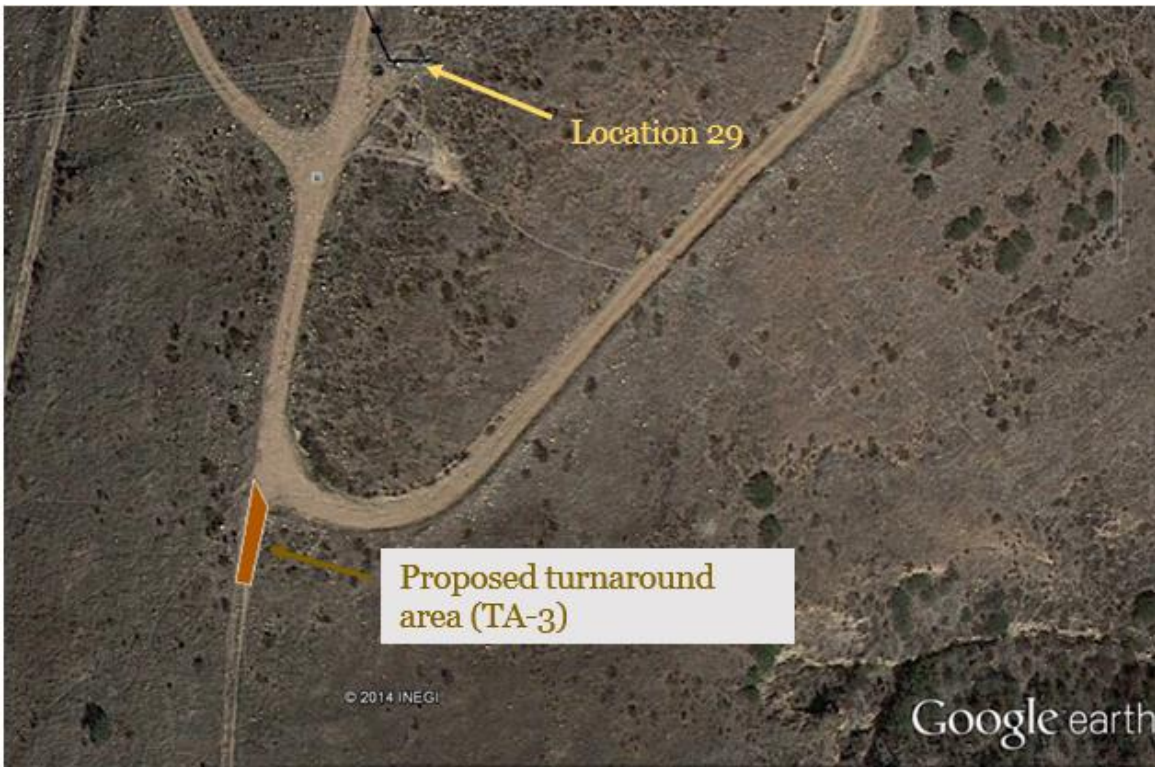
Figure 3: Aerial Image of proposed turn-around area (TA-3) south of the main access road south of Structure No. P29.