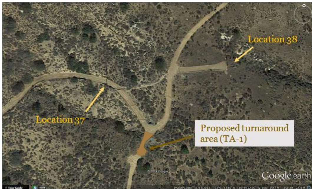
Figure 1: Aerial Image of proposed turn-around area (TA-1) south of the main access road between Structure Nos. P37 and P38.

Figures 1 through 5 depict the proposed temporary turn-around areas (TA-1, TA-2, TA-3, TA-4 and TA-5). Photograph Nos. 1 through 5 show the existing conditions of the proposed temporary turn-around areas (TA-1, TA-2, TA-3, TA-4 and TA-5) and approximate boundaries of the proposed temporary workspace. Refer to Table 1 for references to figures and photographs for each of the identified turn-around areas.