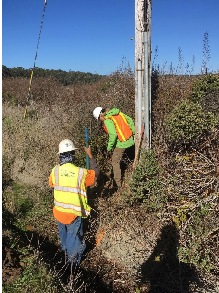
Photo 3: Monitoring biologist inspecting for special status species prior to ground disturbance.