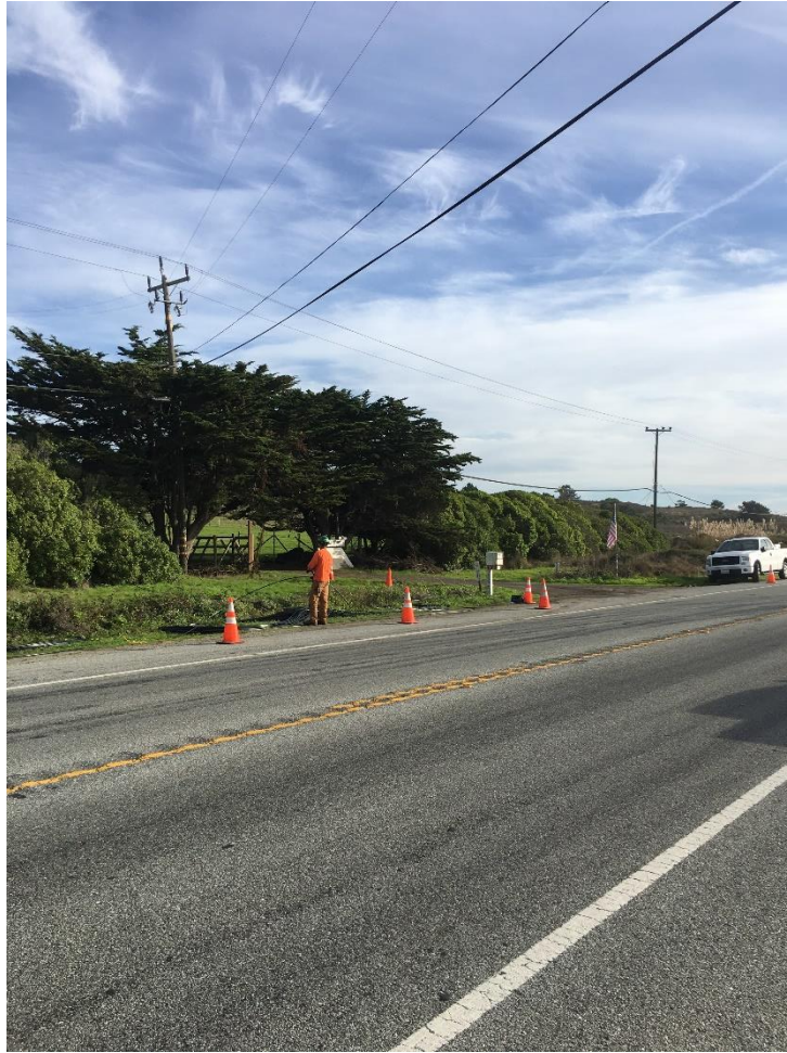
Photo 6: Aerial fiber-optic line installation on Highway 1 northbound.