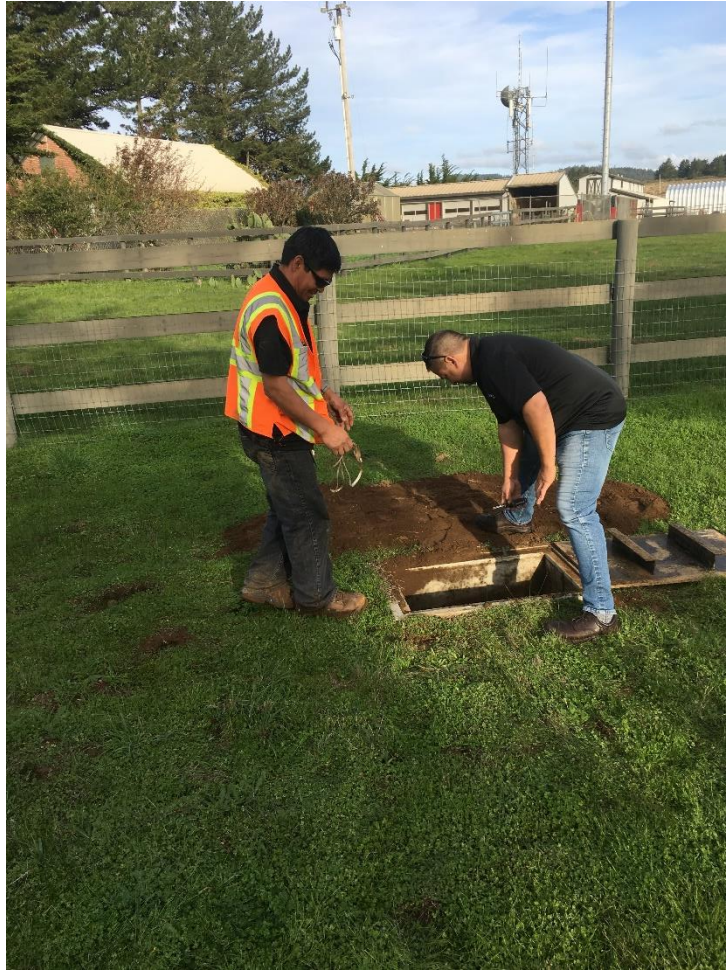
Photo 7: Preparing aerial/underground union and utility box at Pigeon Point Road hub.