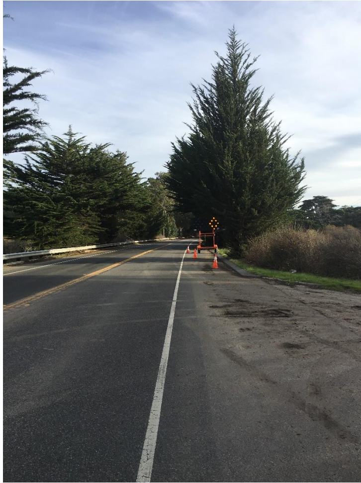
Photo 8: Traffic control signage on Highway 1 southbound shoulder.