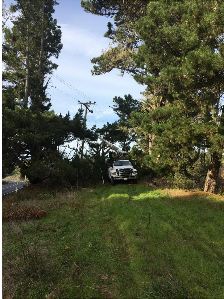
Photo 5: Aerial fiber-optic line installation on lower Bean Hollow Road.