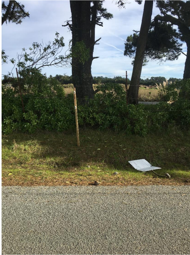
Photo 4: Damaged project information sign on upper Bean Hollow Road.