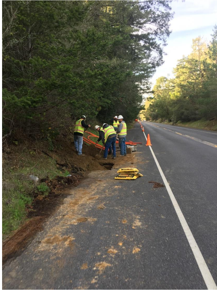
Photo 9: HDD crew filling excavated holes on Highway 1 southbound shoulder.