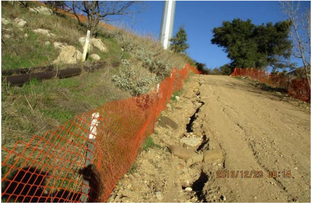
Photo 3: Gravel bag check dams placed along a rill that was formed by stormwater erosion. December 20, 2016