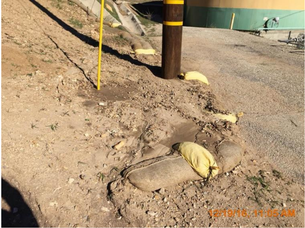
Photo 2: Sediment build-up on straw wattles at the base of the 12kV/TSP-A2 access road, where it meets the paved road. December 19, 2016