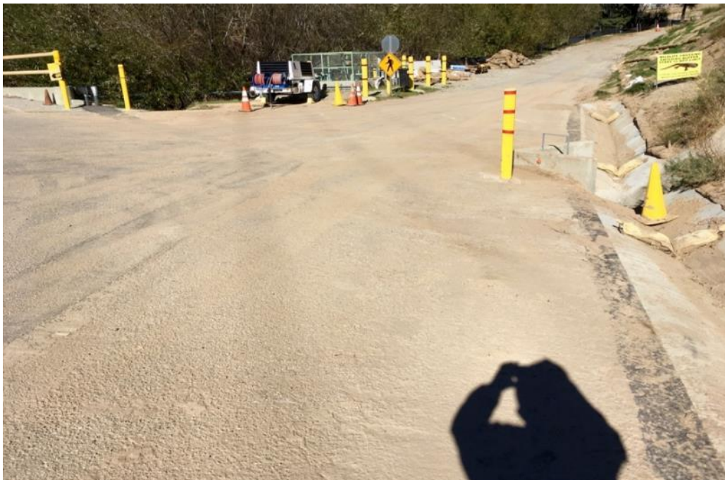
Photo 8: Sediment accumulated at the base of the CCS. December 29, 2016