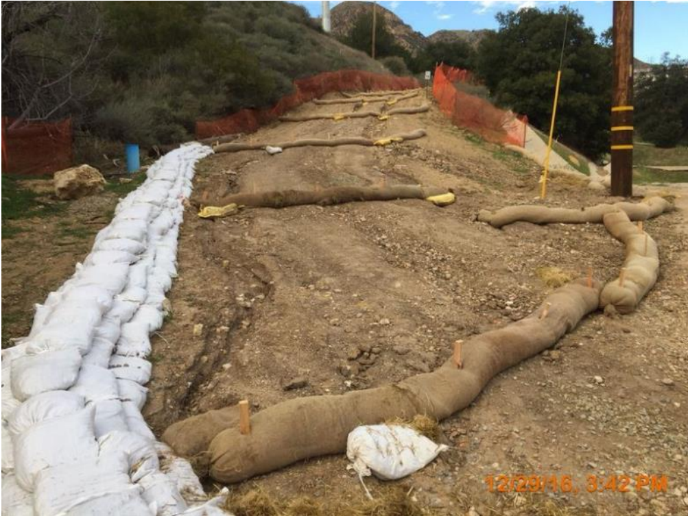
Photo 10: SCG installed straw wattles and gravel bags. December 29, 2016.