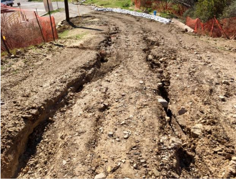
Photo 5: 12kv/TSP-A2 access road with deep rills. December 29, 2016