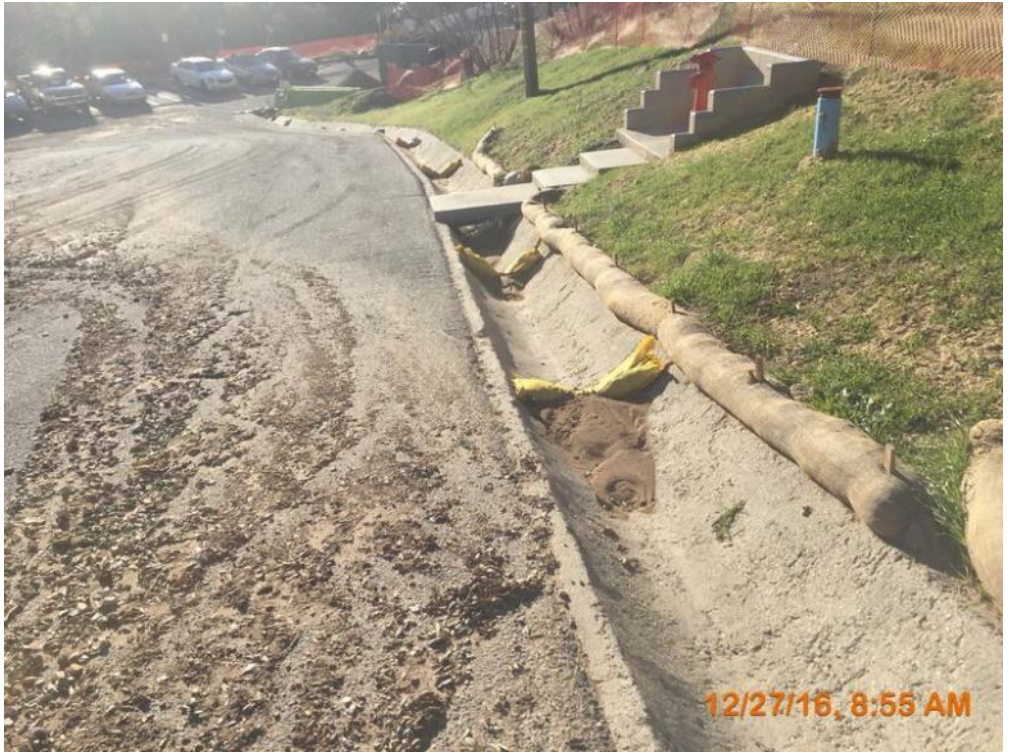
Photo 4: Sediment on the paved road below the TSP-A2 access road and sediment accumulated on check dams. December 27, 2016