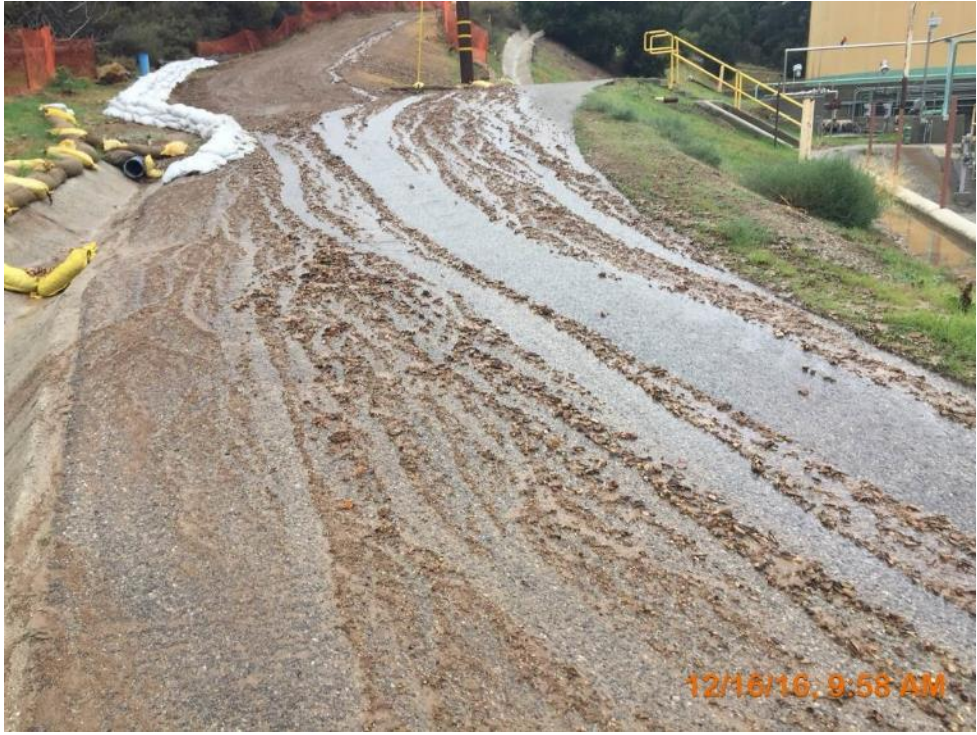
Photo 1: Stormwater runoff from the 12kV/TSP-A2 access road (in distance) onto the paved road. Sediment from the TSP-A2 dirt access road appears to have been moved by stormwater and deposited on paved road. December 16, 2016