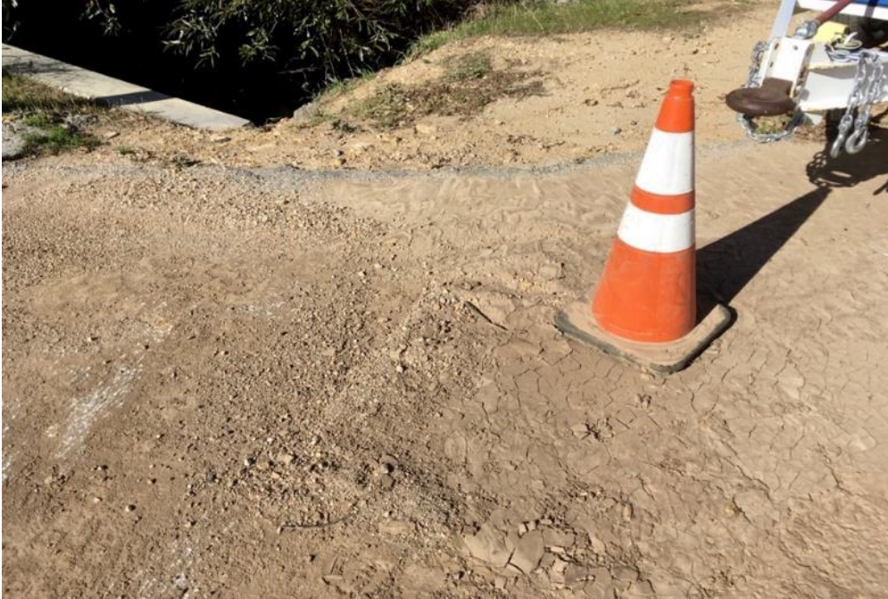
Photo 9: Sediment accumulated near the upper retention pond and likely flowed into the pond. December 29, 2016