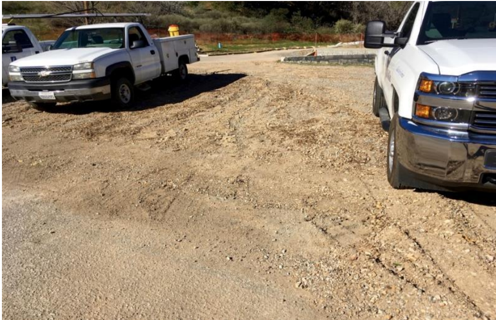
Photo 7: Sediment traveled from the TSP-A2 access road, in the background, through the parking area. December 29, 2016