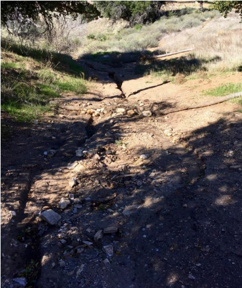
Photo 6: Erosion and rills where the oak swale meets the 12kv/TSP-A2 access road. December 29, 2016