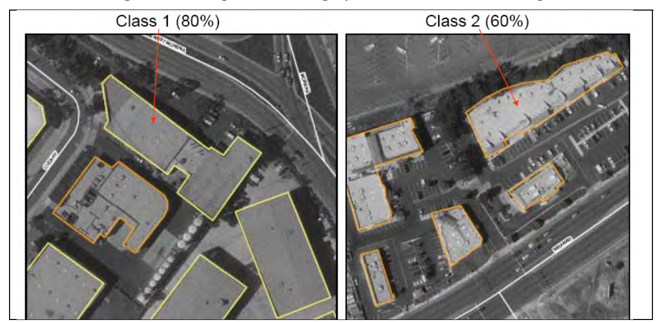
Figure 2. Aerial photos of Category 1 and 2 commercial rooftops

Commercial building rooftops are classified as Category 1 and Category 2 in the 2005 rooftop inventory. Category 1 means 80 percent or more of the rooftop is available for PV. See photographs of Category 1 and Category 2 commercial rooftops in Figure 2. Approximately eighty (80) percent of the commercial building PV potential in San Diego County is classified as Category 1. This means there is over 1,500 MWac of PV potential on Category 1 commercial rooftops in San Diego County, sufficient for the equivalent capacity of six 250 MW GSEP projects.