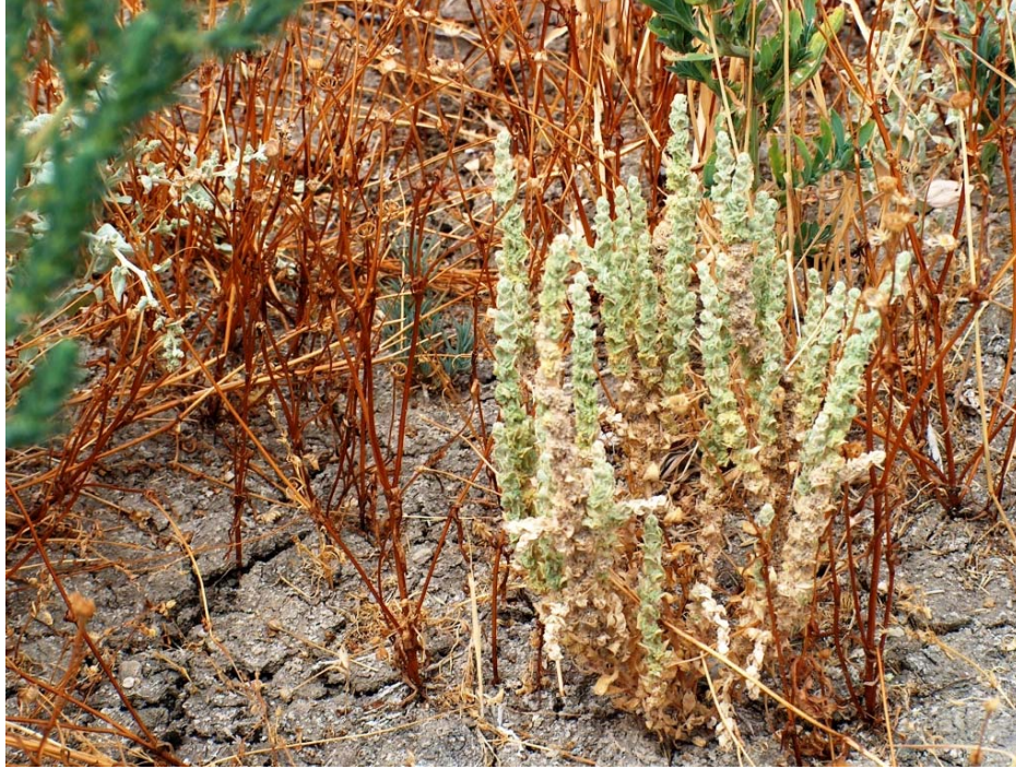
Photo San Jacinto Valley Crownscale. Baker Street area, 28 July 2006