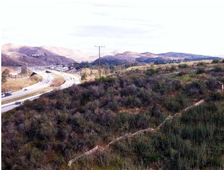
Photo Chamise Chaparral. Looking east from within the Richland Tract, 28 February 2012. Interstate 15 in background.