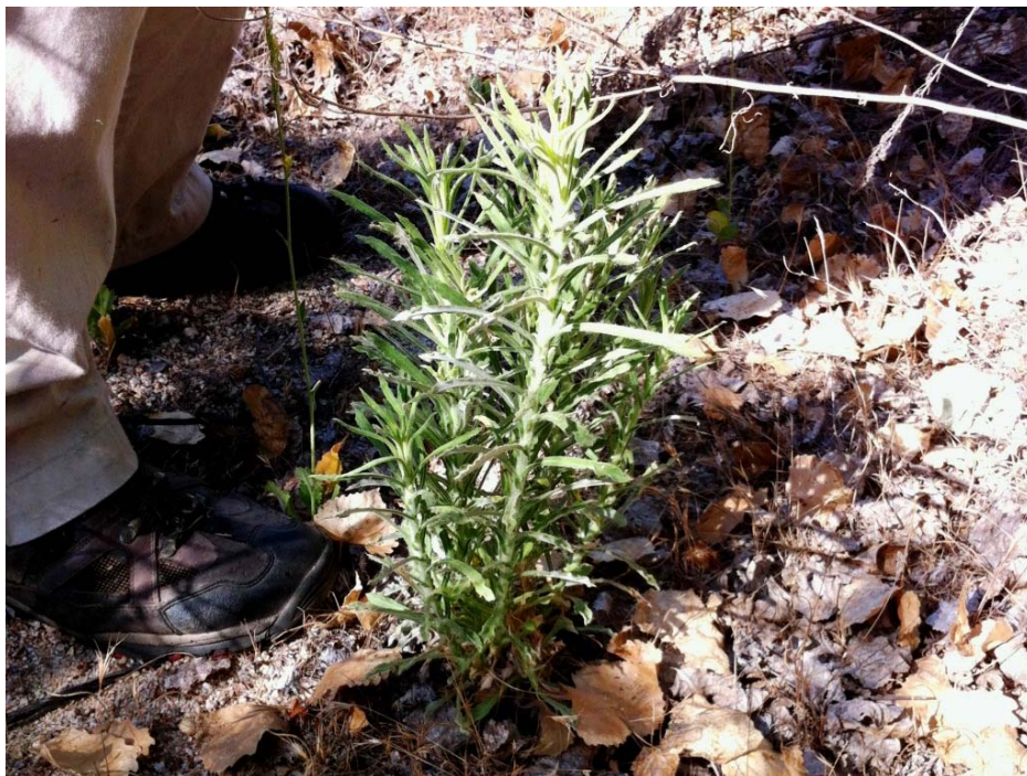
Photo White Rabbit-tobacco, Richland Tract, 1 June 2012.