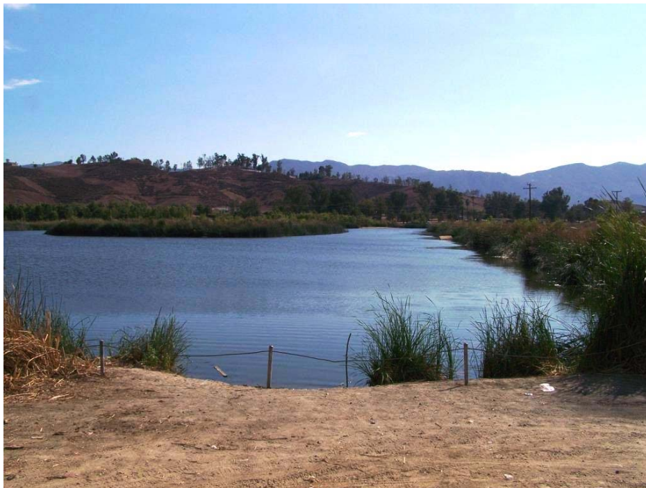
Photo Open Water. Looking west from near the corner of Baker Street and Bromley Avenue, 1 August 2006.