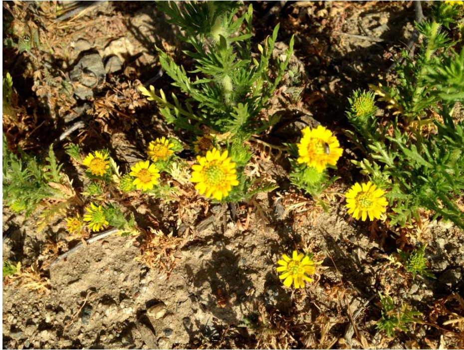
Photo Smooth Tarplant. Vicinity of Third Street and Pasadena Avenue, 26 April 2013.