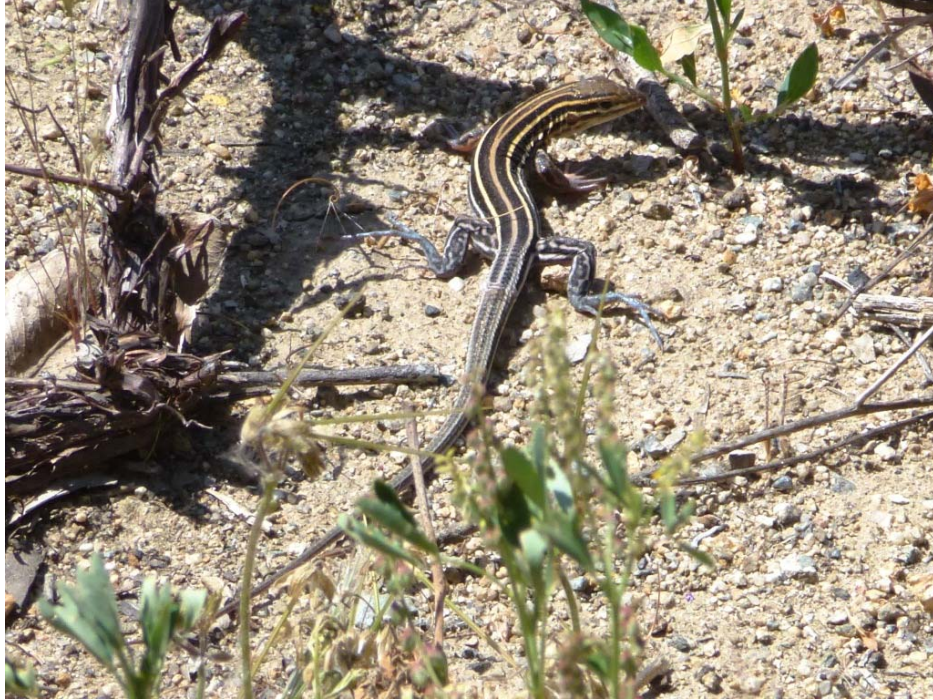
Photo Orange-throated Whiptail. Southeast of the intersection of Lake Street and Nichols Road, 26 March 2013.