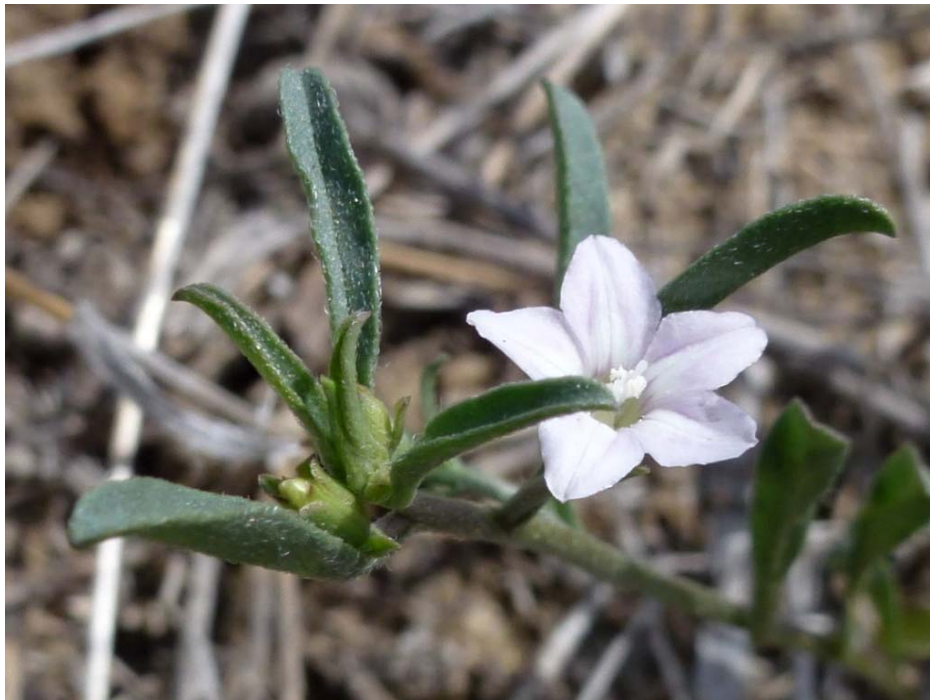
Photo Small-flowered Morning Glory. Off Nichols Road near Coal Avenue, 27 March 2013.