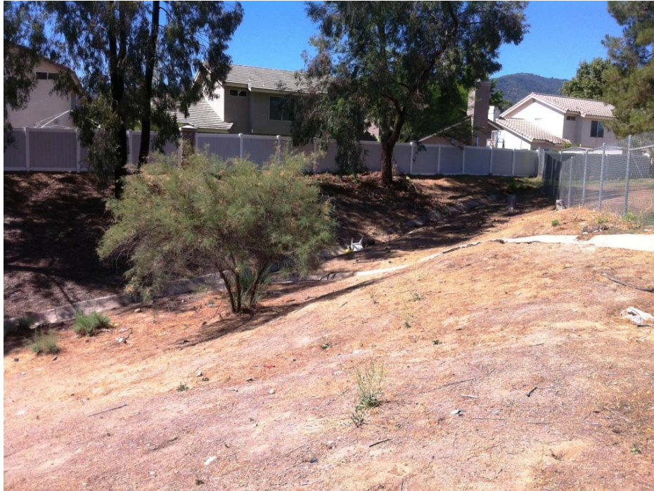
Photo Residential/Urban/Exotic. Looking south from the edge of the Richland Tract near Horsethief Canyon Road, 25 June 2012.