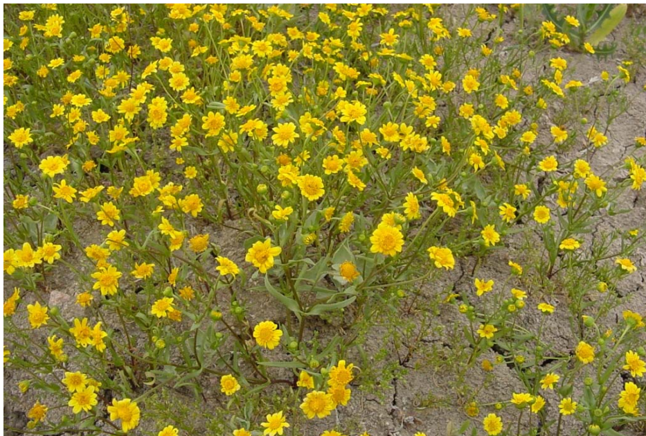
Photo . Coulter's Goldfields. Along Baker Street, south of Pierce Street, 5 May 2006.