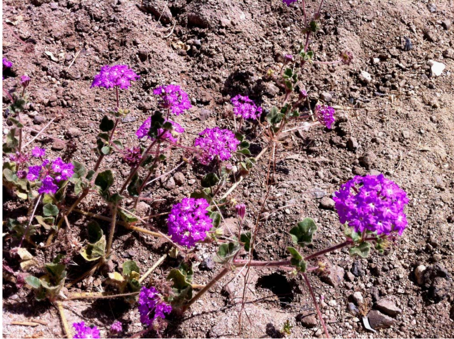
Photo Chaparral Sand-verbena. Temescal Canyon Road near El Hermano Road, 1 June 2012.