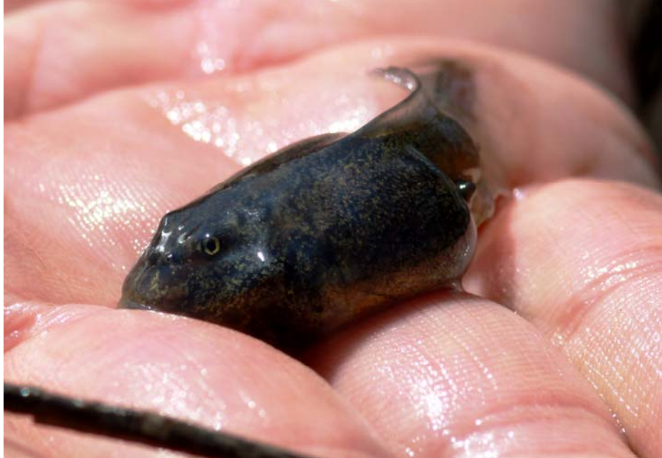
Photo Western Spadefoot Toad tadpole. Near Nichols Road and Lake Street, 12 April 2011.