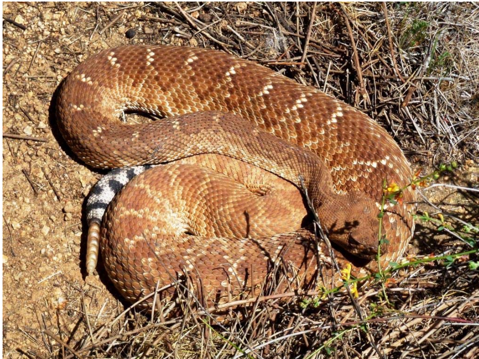
Photo Red Diamond Rattlesnake. Near Temescal Canyon and El Hermano Roads, 6 April 2012.