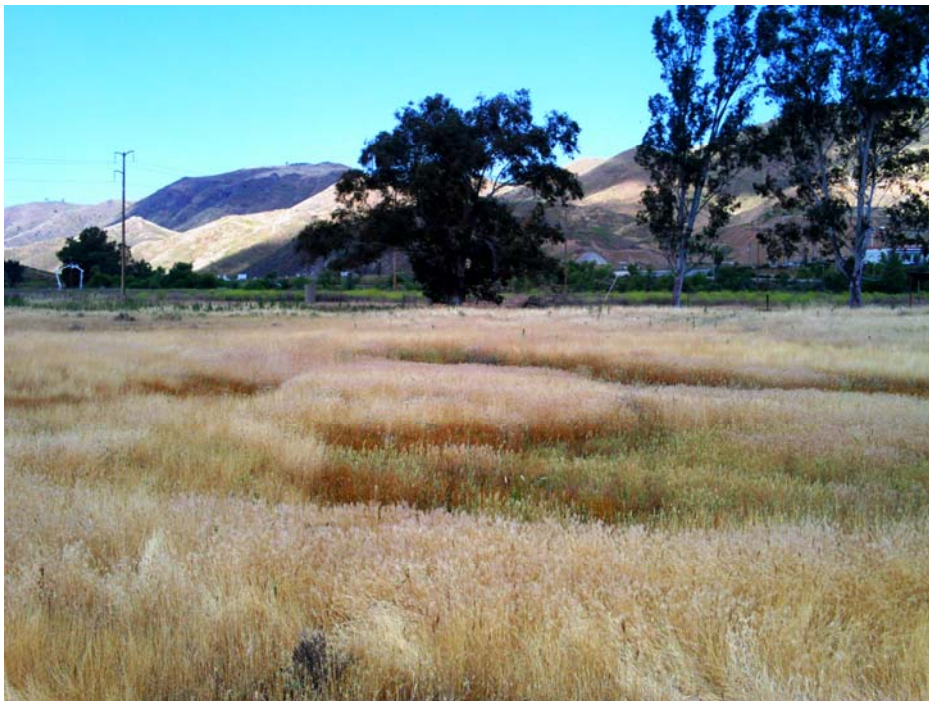
Photo Non-native Grassland. Looking northeast from the vicinity of Baker and Pierce Streets. 10 May 2011.