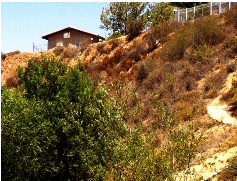
Photo Disturbed Chamise Chaparral (at right). . Near Bolo Court in the Richland Tract, 25 June 2012.