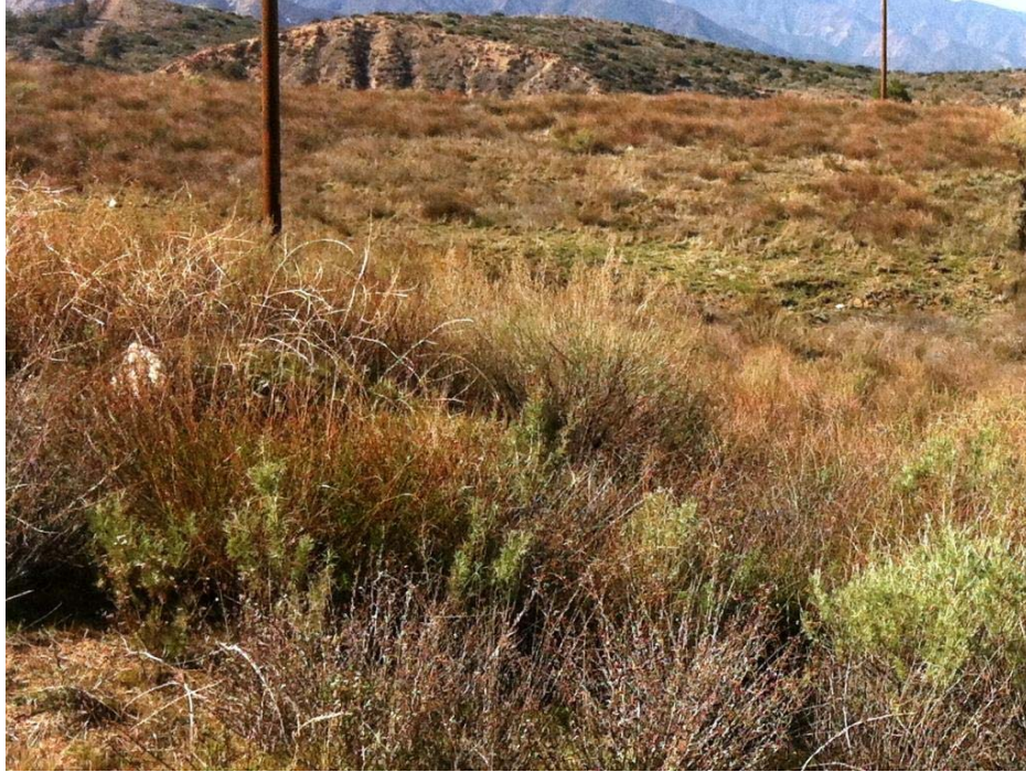
Photo . Riversidean Sage Scrub. Looking west on the Richland Tract, east of Horsethief Canyon Road, 31 January 2012.