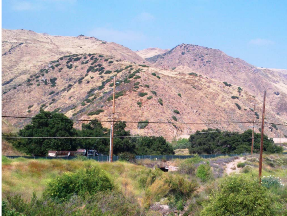
Photo Coast Live Oak Woodland. Temescal Canyon Road near Indian Truck Trail, 8 June 2011.