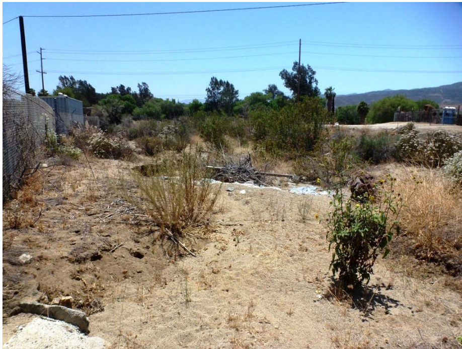
Photo Disturbed Riversidean Alluvial Fan Sage Scrub. Looking south near Temescal Canyon & Hostettler Roads, 6-13-12.