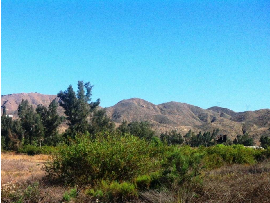
Photo Mulefat Scrub. Looking east at from near Lake Street and Temescal Canyon Road, 28 June 2012.