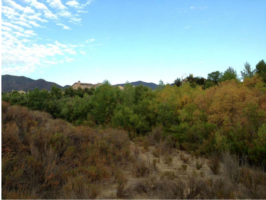
Photo . Southern Cottonwood/Willow Riparian. Looking west near the intersection of Campbell Ranch & Mayhew Canyon Roads, 9 July 2013.