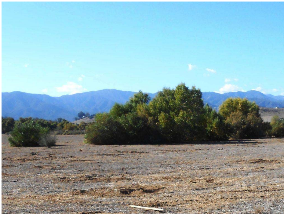
Photo . Upland Southern Willow Scrub near the corner of Collier and Riverside Avenues (Highway 74). 17 December 2012.