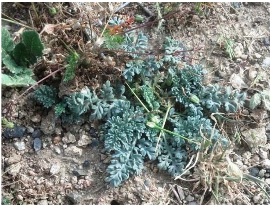
Photo San Diego Ambrosia. Off Pierce Street near Baker Street, 1 April 2013.