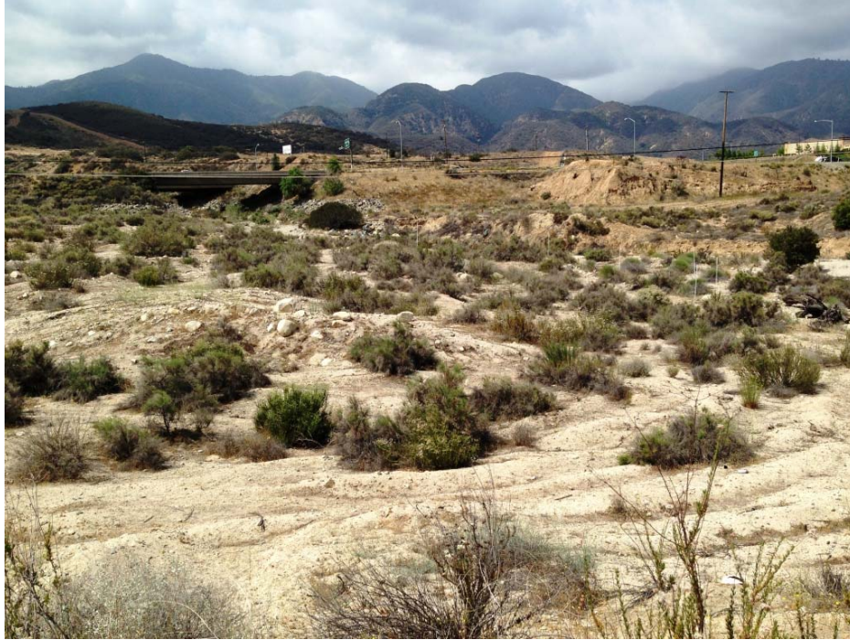
Photo Riversidean Alluvial Fan Sage Scrub. Looking south near Indian Truck Trail & Temescal Canyon Road, 17 May 2013.