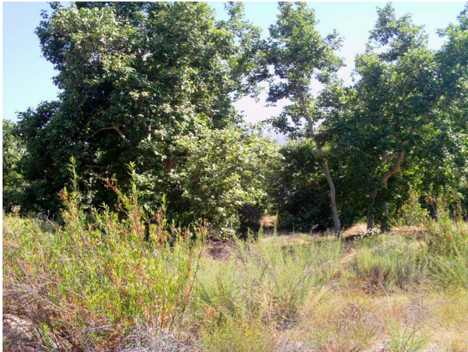
Photo . Southern Sycamore/Alder Riparian Woodland. Looking south from near the corner of Campbell Ranch Road & Temescal Canyon Road, 14 June 2011.