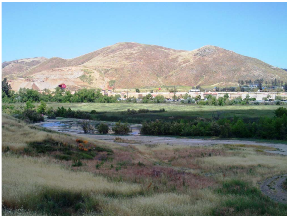
Photo Coastal and Valley Freshwater Marsh (and Alkali Marsh). Looking north from Baker Street, north of Turnbull Avenue, 10 May 2011.