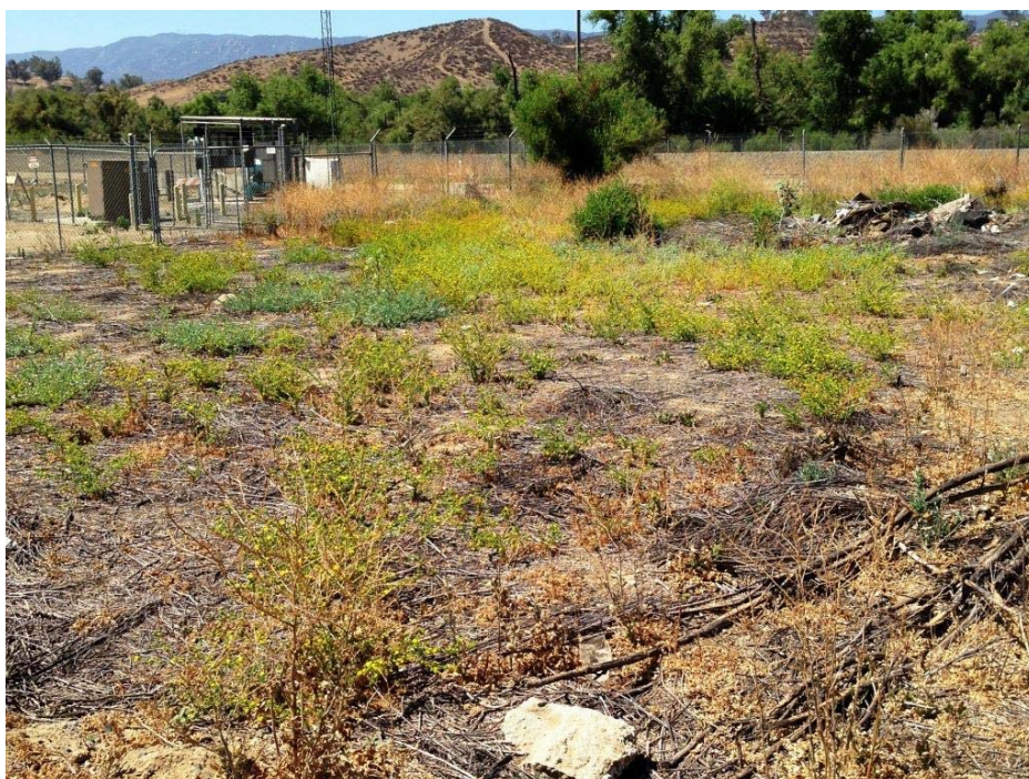
Photo Disturbed Alkali Marsh. Looking south from near the north end of Pasadena Street, 19 June 2013.