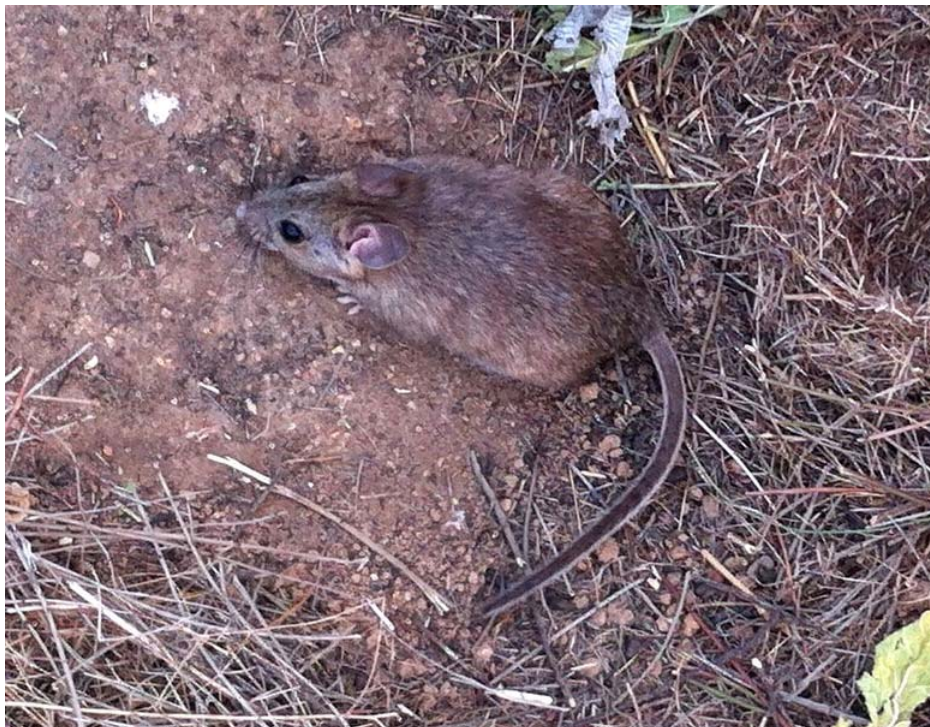
Photo San Diego Desert Woodrat. Near Temescal Canyon and El Hermano Roads, 2 June 2012.