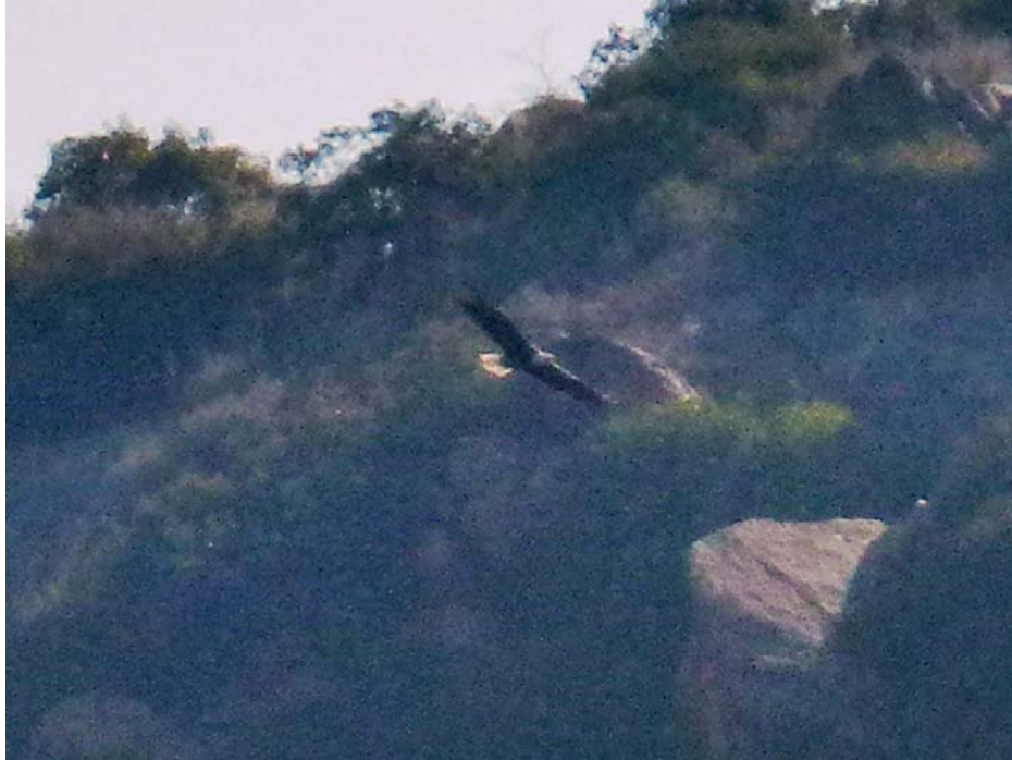
Photo Bald Eagle. Near Temescal Canyon Road and Indian Truck Trail, 13 June 2012.