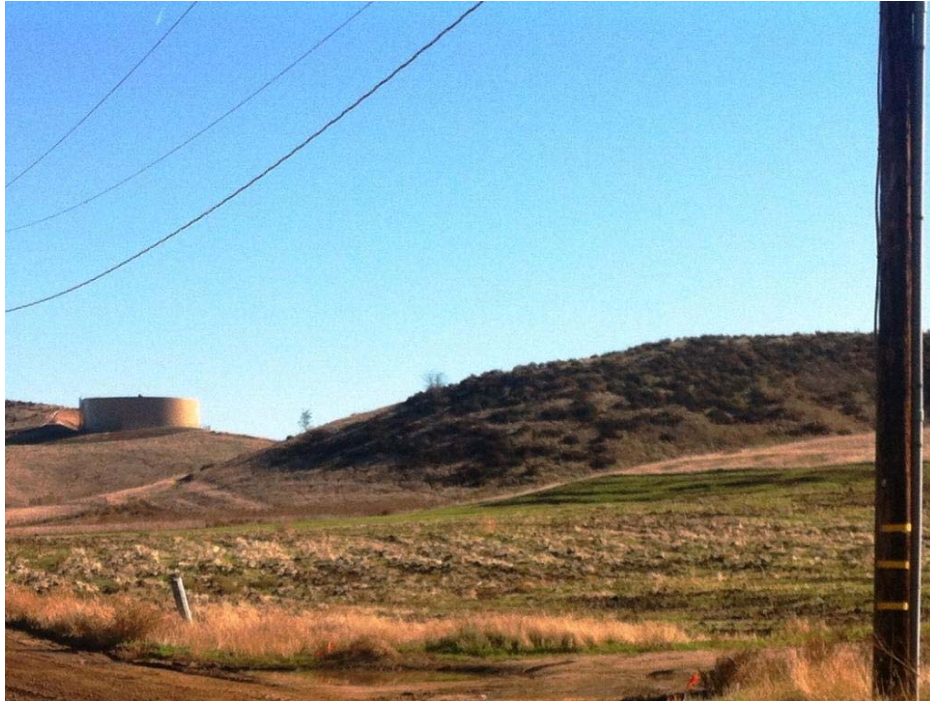
Photo Disturbed Non-native Grassland. Looking south from along Baker Street south of Pierce Street, 22 November 2011.