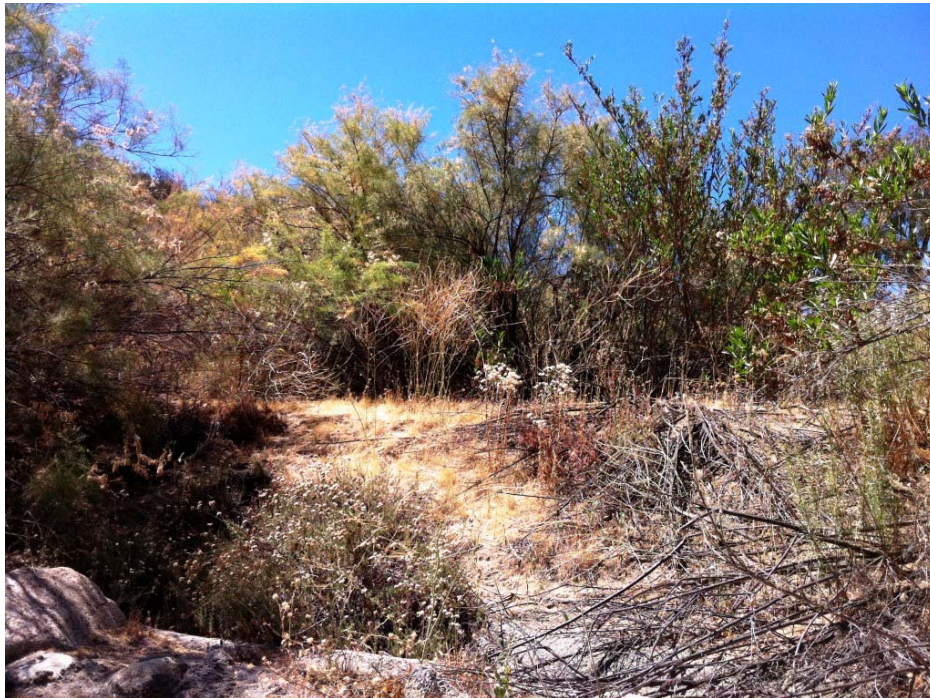
Photo Riparian Scrub. Looking northwest near Horsethief Canyon Road in the Richland Tract, 25 June 2012.