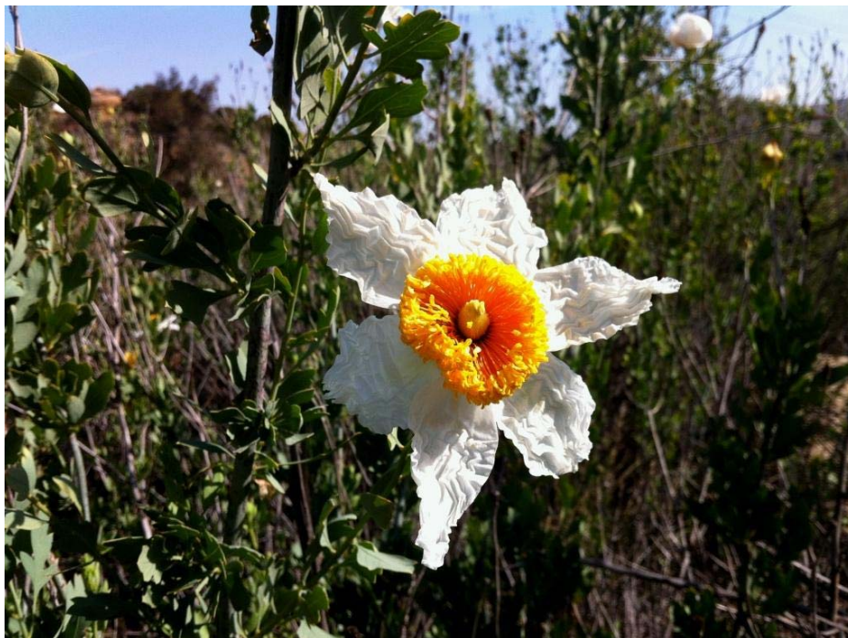
Photo Matilja Poppy. Near Ivyglen Substation, 6 April 2012.