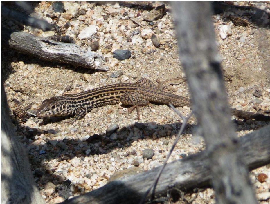
Photo Coastal Western Whiptail. In the vicinity of El Hermano and Temescal Canyon Roads, 6 April 2012.