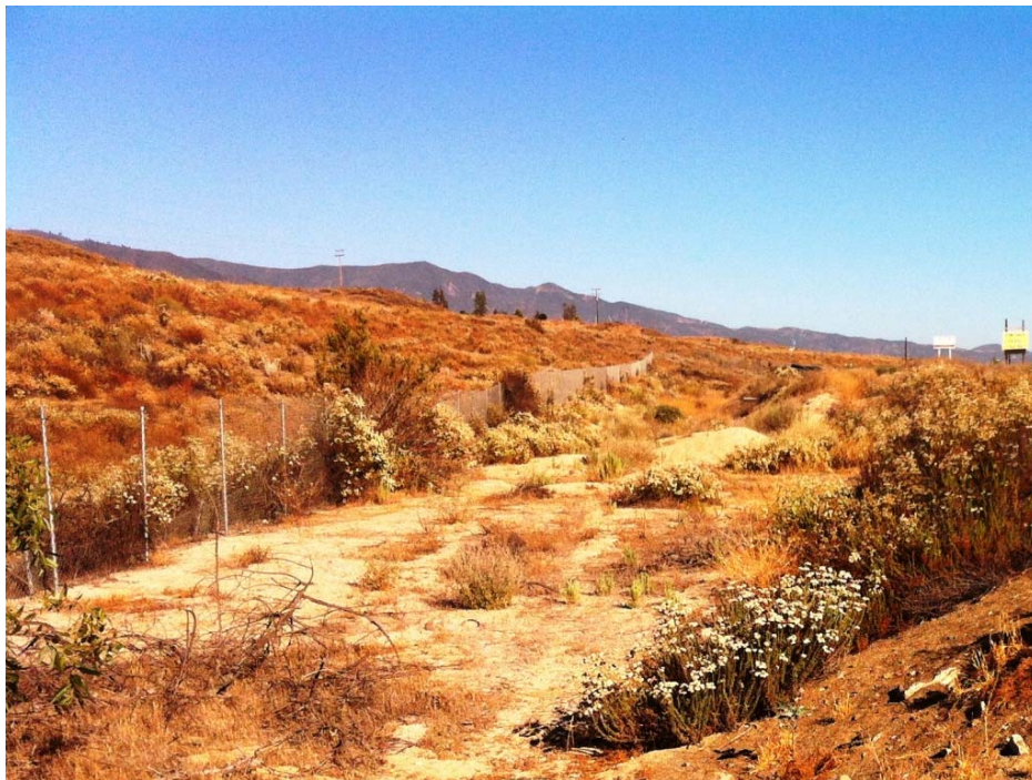
Photo . Disturbed Riversidean Sage Scrub. Looking west along Interstate 15 near Temescal Wash undercrossing, 6-25-12.