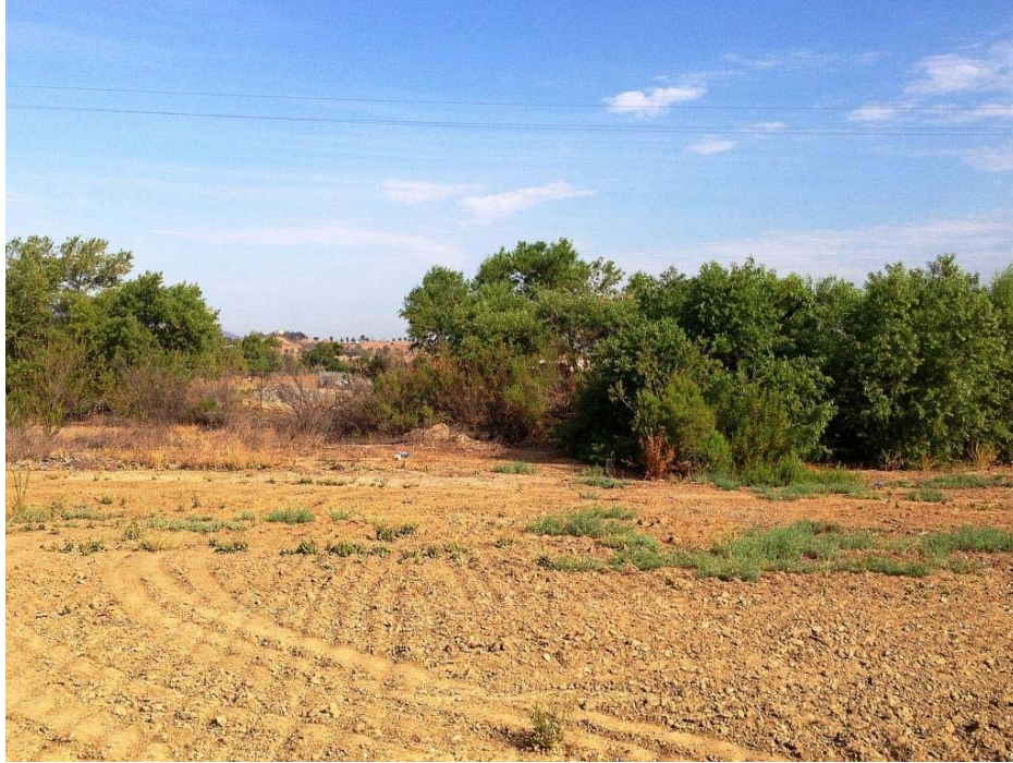
Photo . Southern Willow Scrub. Looking northwest from vicinity of Third Street and Pasadena Avenue, 3 July 2013.