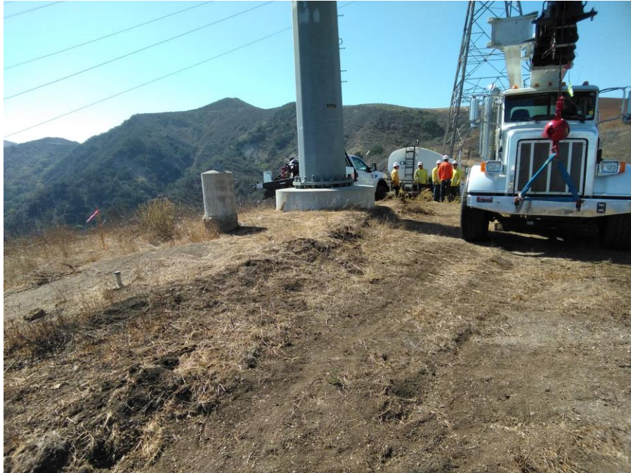
Photo 3: An H&M crew began welding brackets onto TSPs along Segment 3A before a pre-construction clearance sweep was conducted. October 18, 2017