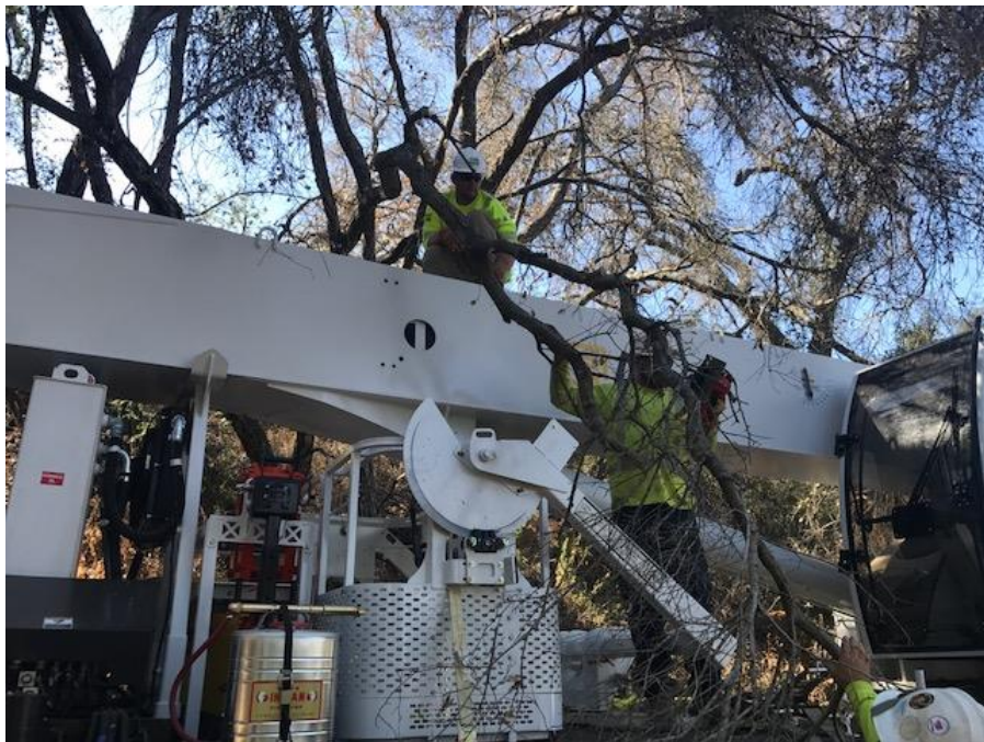
Photo 2: An H&M crew trimming a coast live oak tree along Segment 2 without an arborist present. October 18, 2017