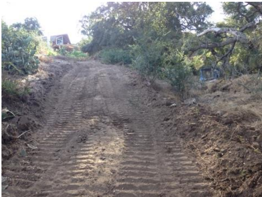
Photo 12: New road bulldozed outside the approved project area near Construct 70 on Segment 3B. November 21, 2017