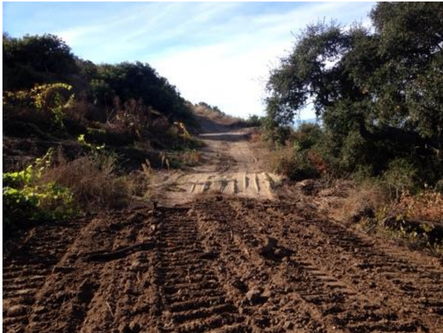
Photo 14: End of new road bulldozed outside of disturbance limits near Construct 70 on Segment 3B. November 21, 2017