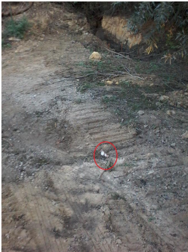
Photo 10: ESA flagging and a stake knocked over and underneath bulldozer tracks within the Rincon Creek ESA buffer along Segment 3B. November 21, 2017