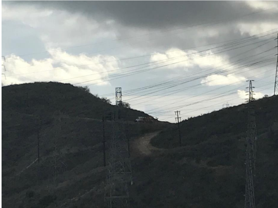
Photo 5: An H&M crew mobilized and staged equipment along Segment 3A prior to a pre-construction clearance sweep. November 3, 2017