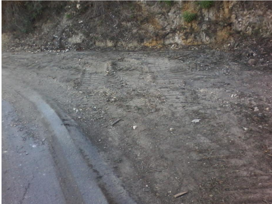
Photo 9: Bulldozer tracks within the Rincon Creek ESA buffer along Segment 38. November 21, 2017