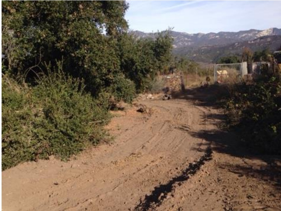
Photo 13: Oak woodland impacted by the new road incident near Construct 70 on Segment 3B. November 21, 2017