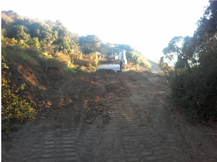
Photo 11: An H&M crew bulldozing road outside of the approved project area near Construct 70 on Segment 3B. November 21, 2017