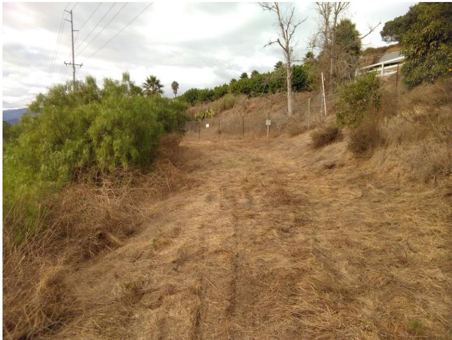
Photo 4: Areas where an H&M crew trimmed and cleared vegetation along Segment 3A prior to a pre-construction clearance sweep. November 2, 2017