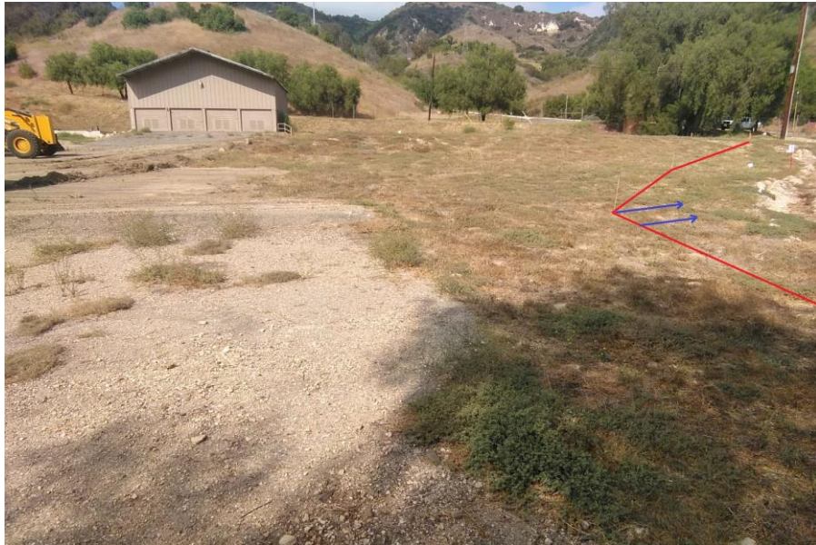
Photo 1: Area where an H&M backhoe went outside of disturbance limits at the Teen Challenge Yard. The area is staked indicating the disturbance limits. September 20, 2017