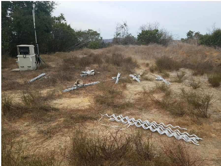
Photo 6: Materials were staged outside of disturbance limits along Segment 1. November 12, 2017