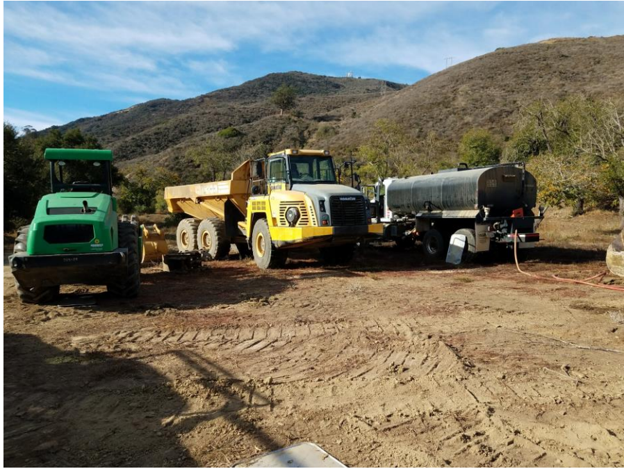
Photo 7: H&M staged equipment outside of project disturbance limits along Segment 3B. November 20, 2017