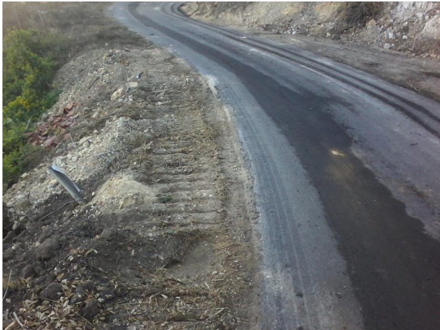
Photo 8: Bulldozer tracks outside of disturbance limits within the Rincon Creek ESA along Segment 3B. November 21, 2017