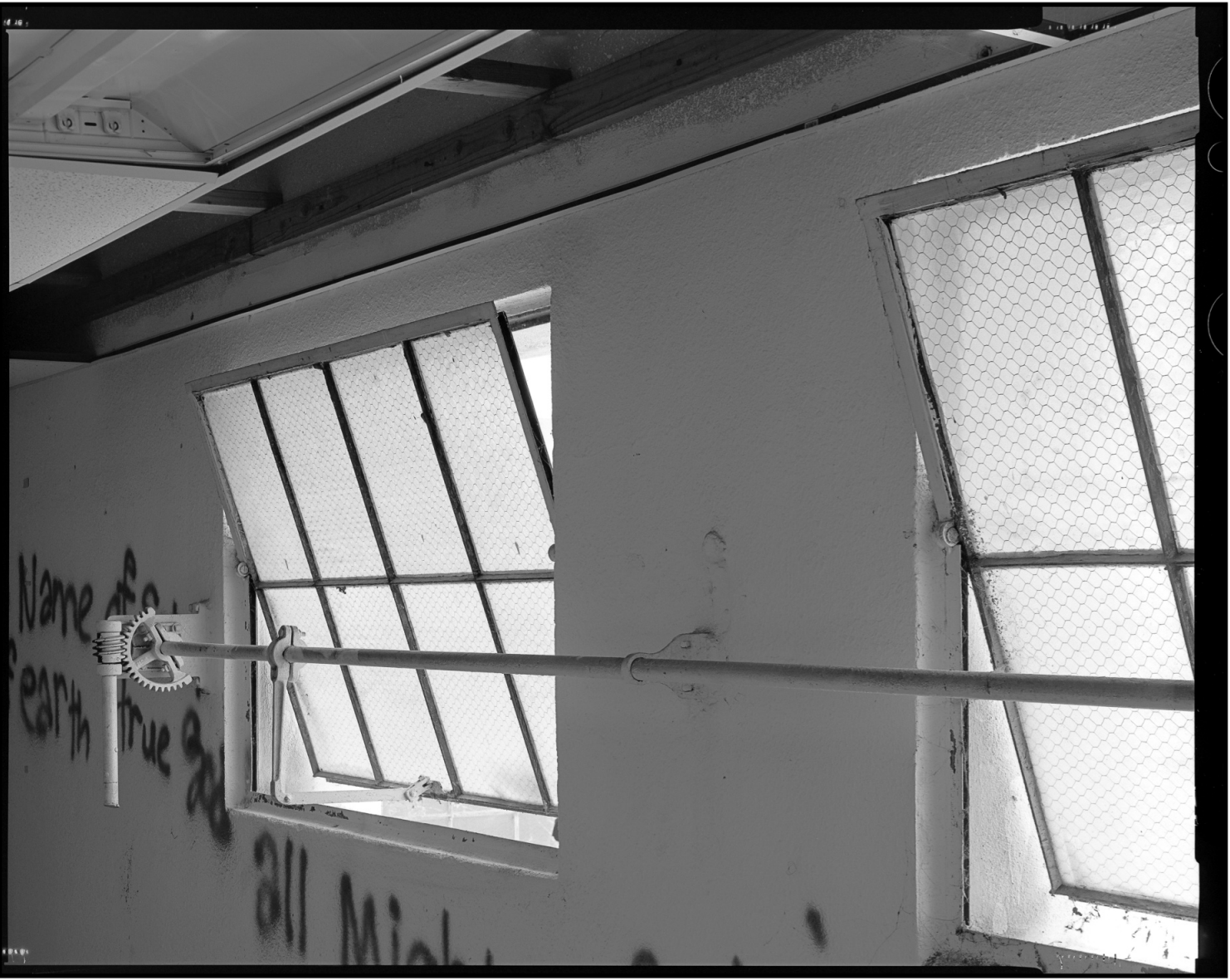
HAER-CA-2340 PHOTO #38

HISTORIC AMERICAN ENGINEERING RECORD SOUTHERN CALIFORNIA EDISON COMPANY CAPISTRANO SUBSTATION SEE PHOTO INDEX FOR CAPTION