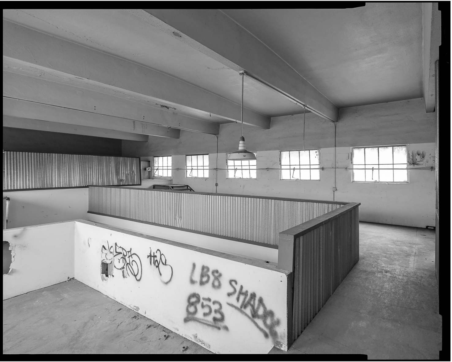
HAER-CA-2340 PHOTO #37