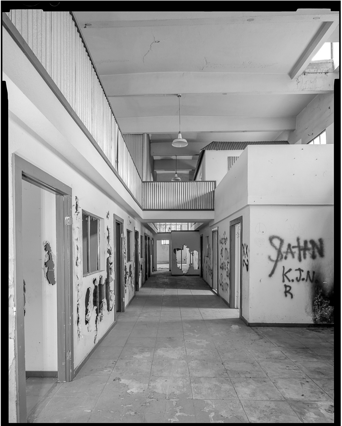
HAER-CA-2340 PHOTO #35