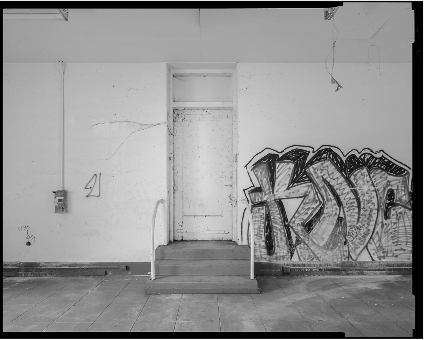
HAER-CA-2340 PHOTO #36

HISTORIC AMERICAN ENGINEERING RECORD SOUTHERN CALIFORNIA EDISON COMPANY CAPISTRANO SUBSTATION SEE PHOTO INDEX FOR CAPTION