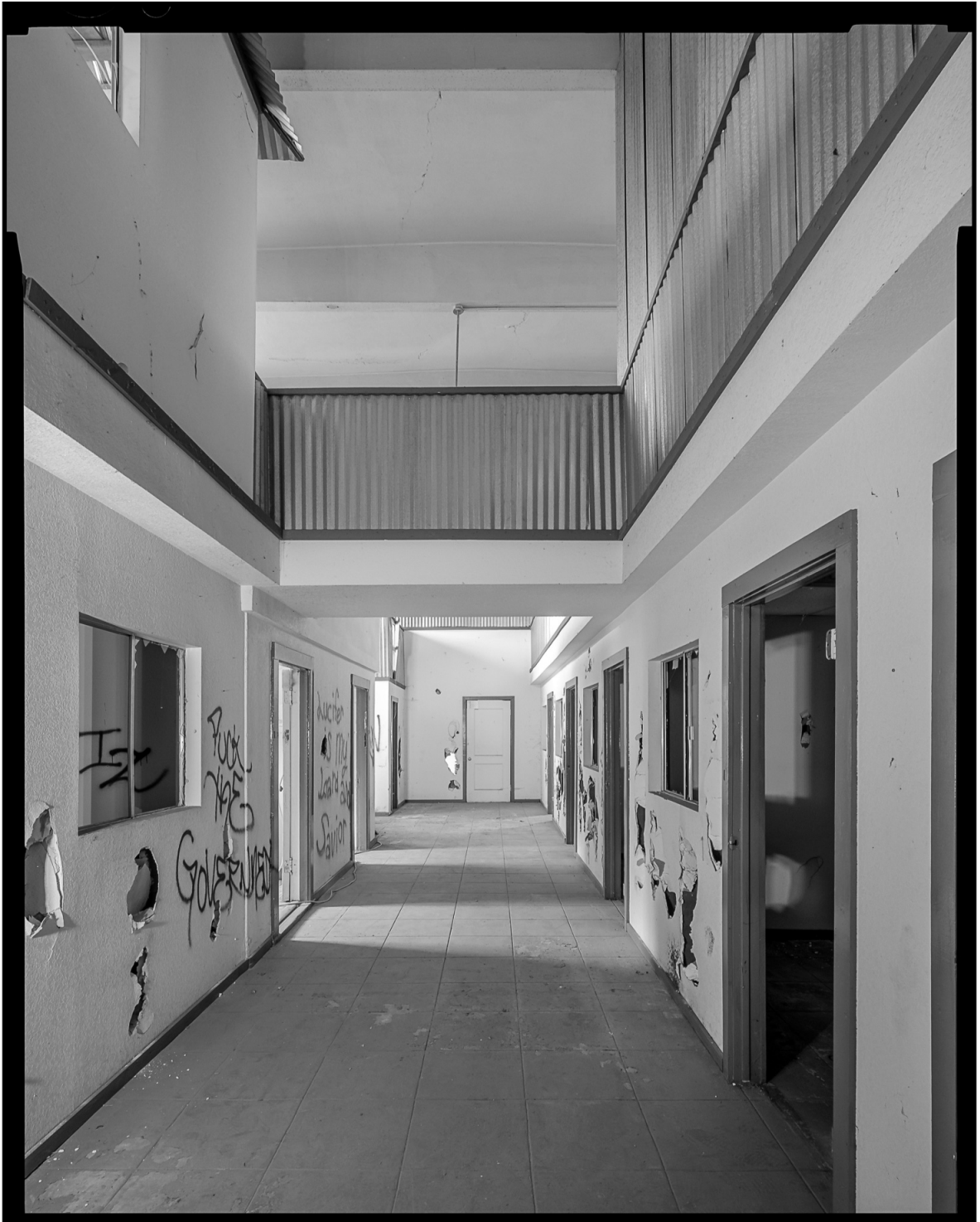
HAER-CA-2340 PHOTO #34