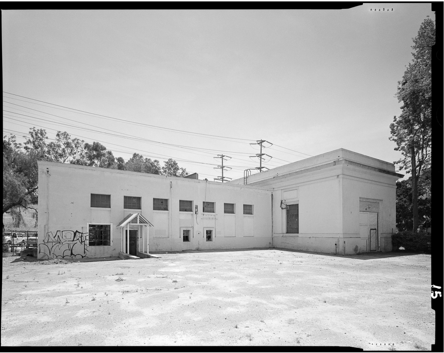
HAER-CA-2340 PHOTO #15