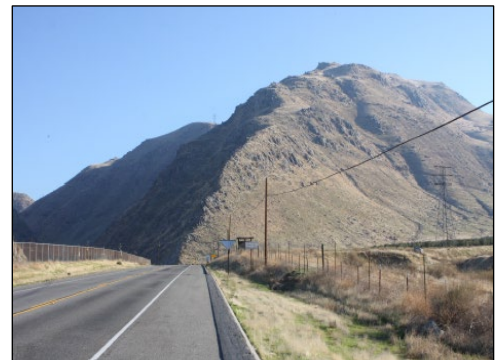
Segment 1; State Route-178 east of Bakersfield – facing northeast

Segment 3 is located in the Tehachapi Mountains. The existing structures and conductor would be removed, and new structures and conductor would be installed along the 4.1 linear miles of Segment 3. OPGW would be installed on the new structures.