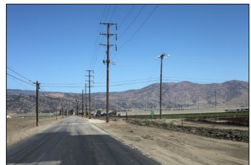
Segment 5; Pellisier Road near Banducci Substation - facing north

Segment 5 is located in the Cummings Valley. Existing structures would be removed, replacement structures would be installed, and other structures would be modified. The existing conductor and cable attached to the existing structures would be transferred to the replacement poles; third-party infrastructure may be left in-place on existing structures. Insulators and other hardware on adjoining structures may be modified to accommodate the taller replacement structures. Segment 5 includes 3 linear miles of All-Dielectric Self-Supporting (ADSS) fiber optic cable.