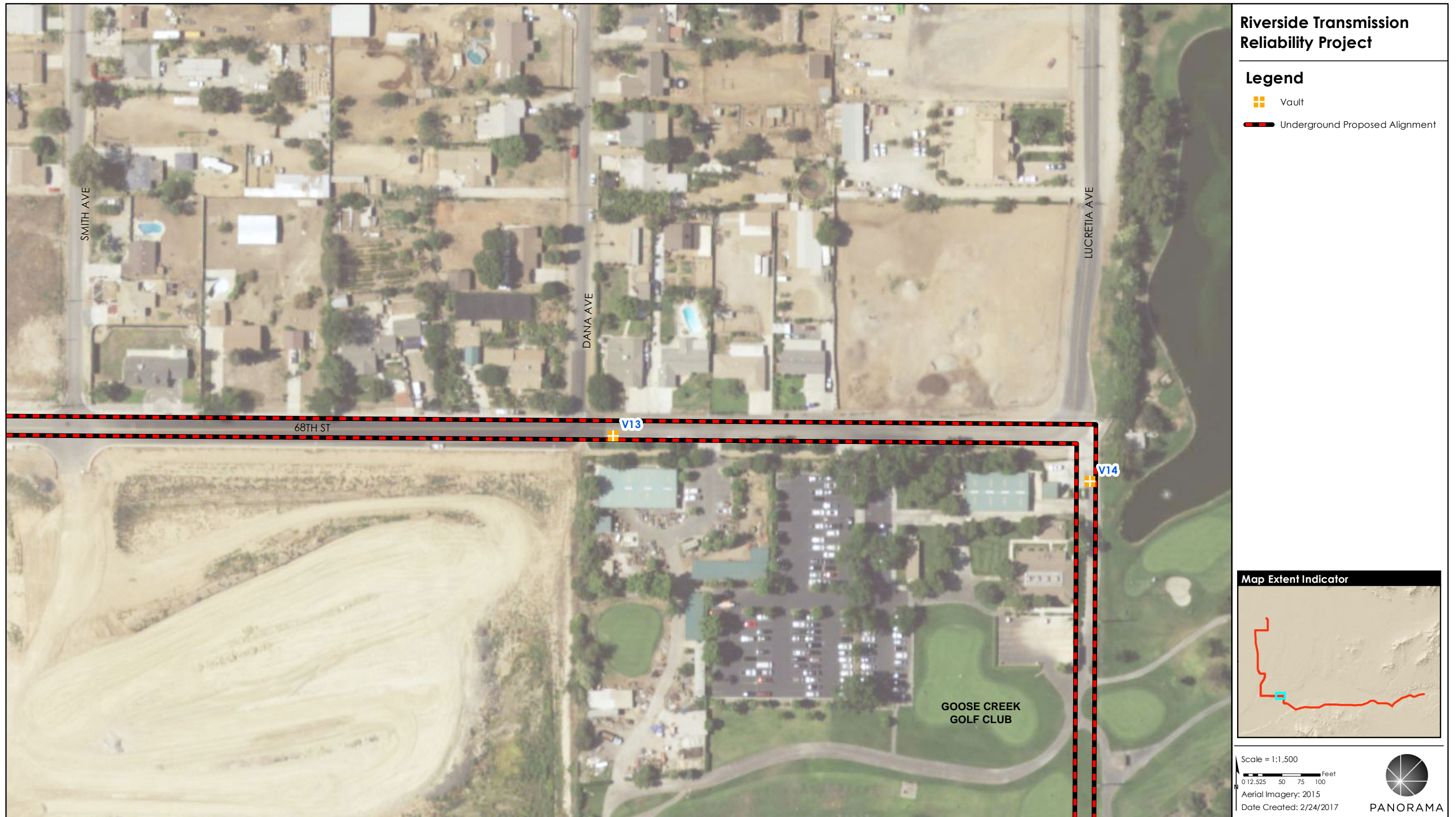
Exhibit A: Underground Transmission Line Route (Map 1)