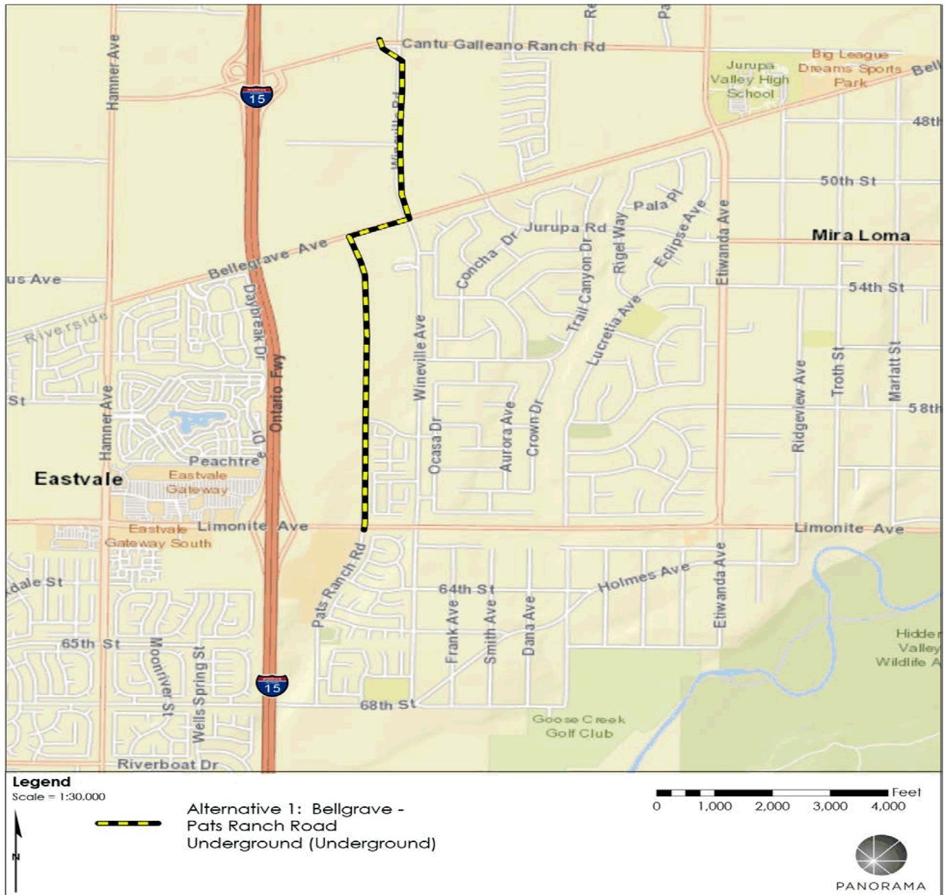
Figure 1: Bellegrave - Pats Ranch Road Underground

11. Anticipated total construction duration for the underground portion of alternatives.