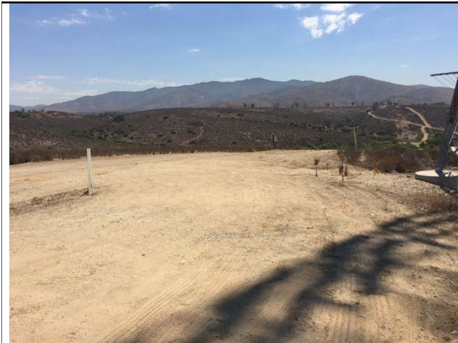
Photograph 2: View 2 of additional disturbance area.