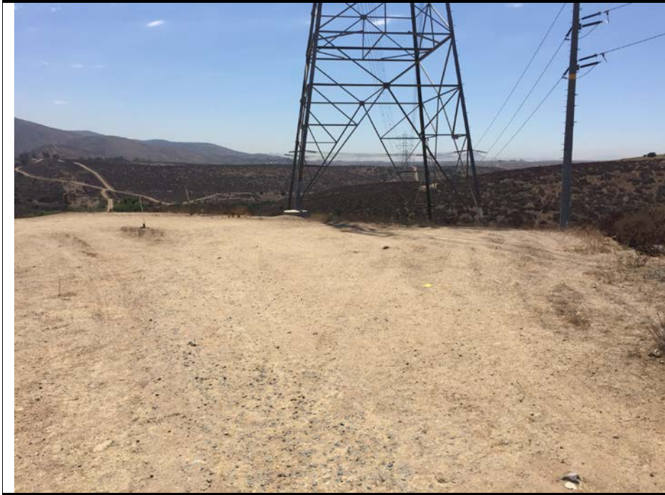
Photograph 1: View 1 of additional disturbance area.