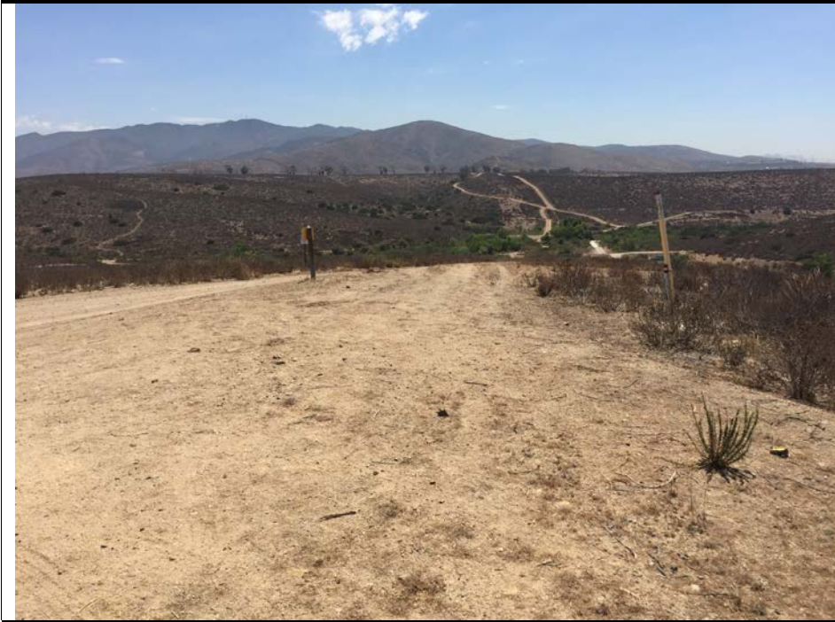
Photograph 3: View 3 of additional disturbance area.