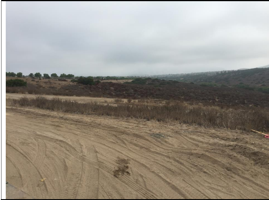
Photograph 1: View north of additional disturbance area.