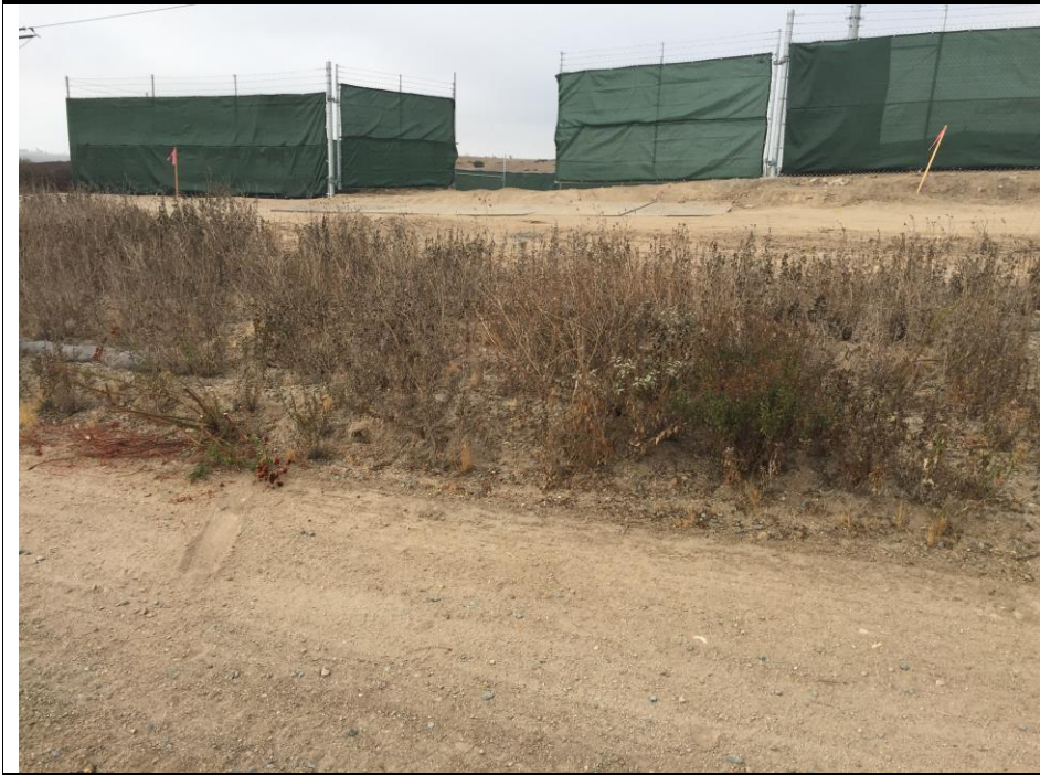
Photograph 3: View south of additional disturbance area.