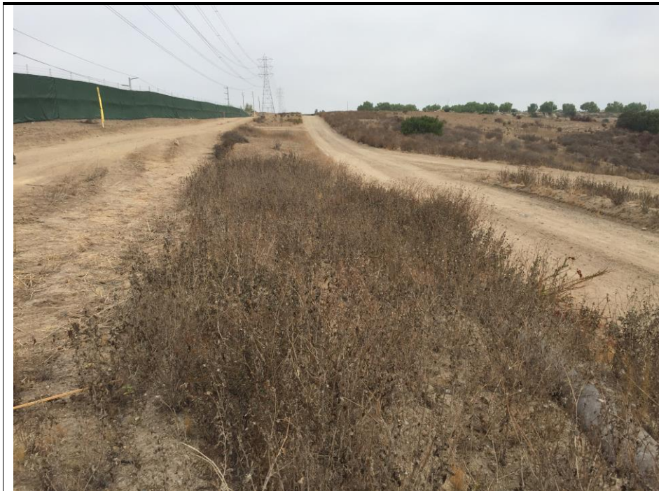
Photograph 2: View west of additional disturbance area.