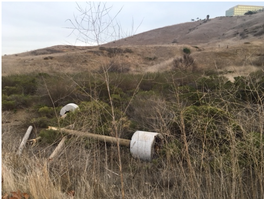
South-facing view from Sorrento Valley Blvd of collapsed guard structure (before removal).