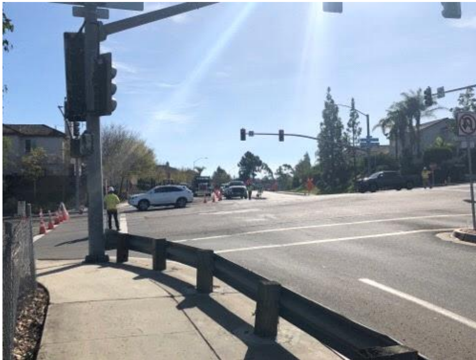
Caption Paving, and traffic control at Pomerado Road and Spring Canyon Road.

Photo Attributes Capture Date/Time: Thu Jan 18 2018 13:19:53 GMT-0800 (PST) Coordinates: 32.922008, -117.062607 View Direction: South