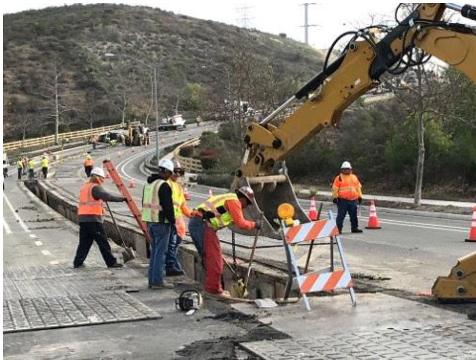
Caption Trench work on Stonebridge Parkway.

Photo Attributes Capture Date/Time: Fri Jan 19 2018 09:20:39 GMT-0800 (PST) Coordinates: 32.921491, -117.047811 View Direction: North