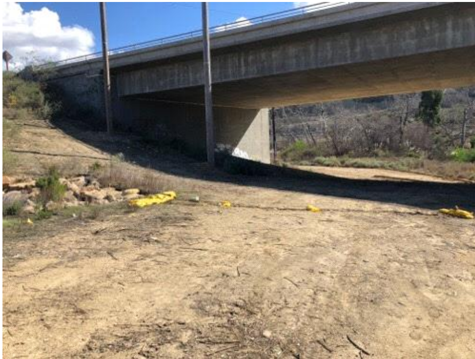
Caption BMPs south of CC MM CP.

Photo Attributes Capture Date/Time: Sat Jan 20 2018 11:03:24 GMT-0800 (PST) Coordinates: 32.889308, -117.202965 View Direction: South