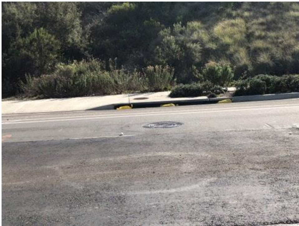
Caption BMPs on Stonebridge Parkway.

Photo Attributes Capture Date/Time: Thu Jan 18 2018 13:34:28 GMT-0800 (PST) Coordinates: 32.921279, -117.055964 View Direction: South