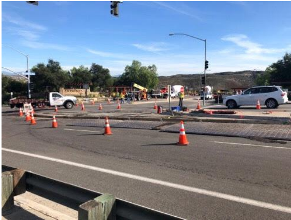
Caption Trench work on Pomerado Road and Stonebridge Parkway.

Photo Attributes Capture Date/Time: Thu Jan 18 2018 13:26:27 GMT-0800 (PST) Coordinates: 32.923003, -117.059369 View Direction: East