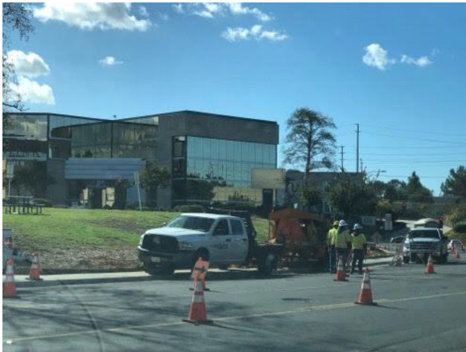
Caption Vault mandreling on Activity Road.

Photo Attributes Capture Date/Time: Sat Jan 20 2018 12:37:39 GMT-0800 (PST) Coordinates: 32.896473, -117.133669 View Direction: West