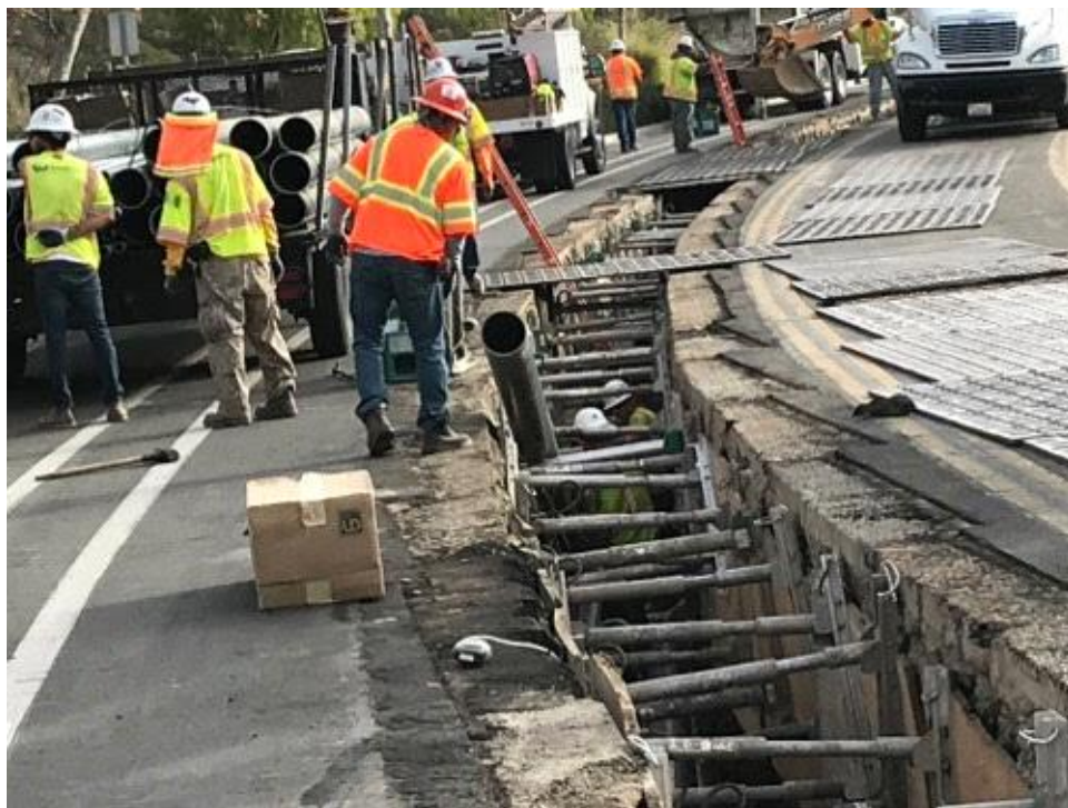
Caption Laying conduit on Stonebridge Parkway.

Photo Attributes Capture Date/Time: Fri Jan 19 2018 09:25:36 GMT-0800 (PST) Coordinates: 32.921973, -117.046532 View Direction: South