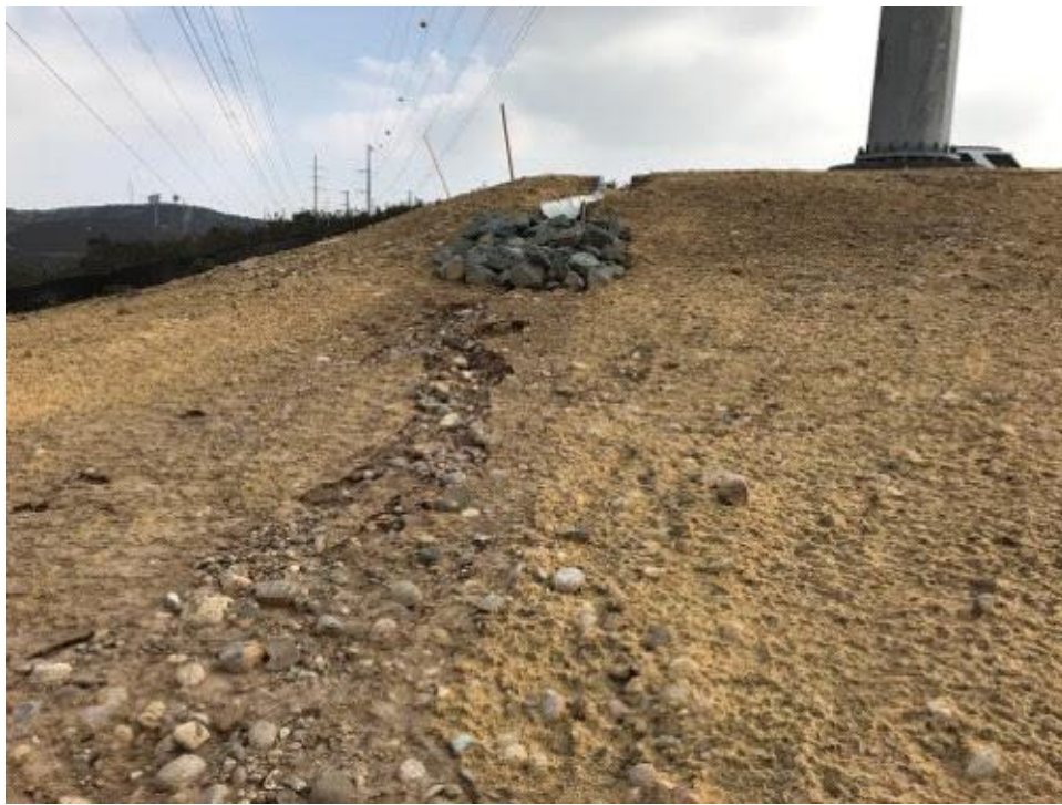
Caption Erosion below rip-rap occurring at P04.

Photo Attributes Capture Date/Time: Fri Jan 19 2018 11:50:08 GMT-0800 (PST) Coordinates: 32.921136, -117.036876 View Direction: East