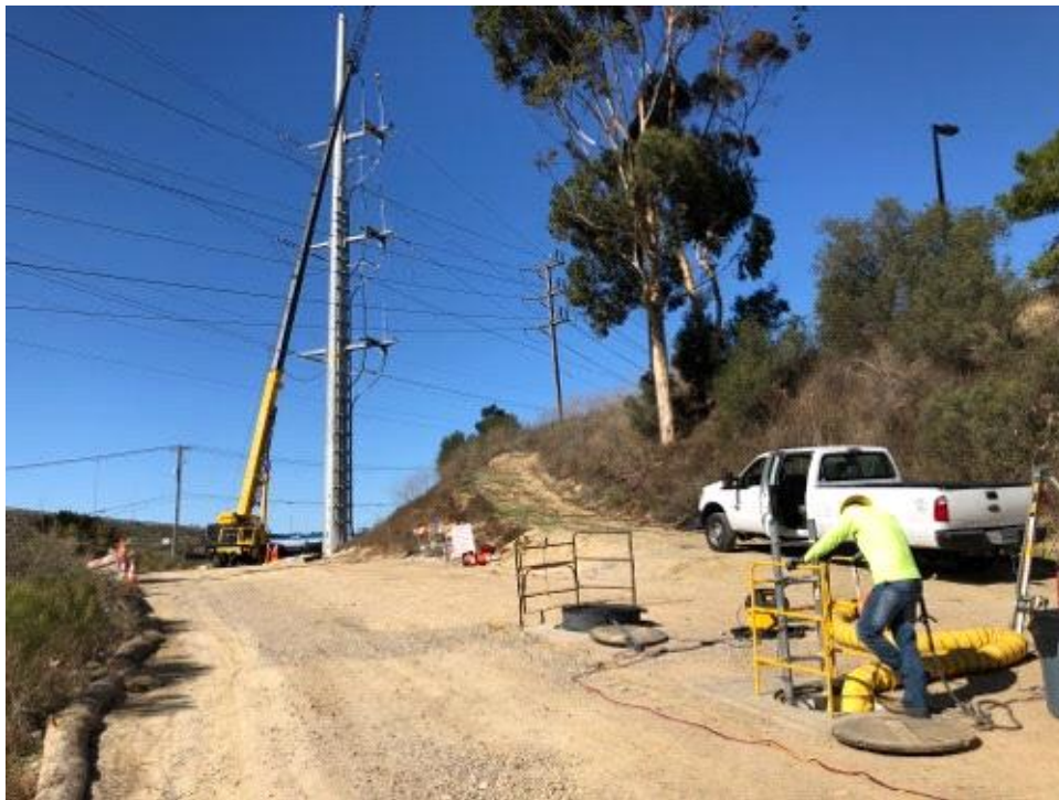
Caption Vault and pole work at CC MM CP.

Photo Attributes Capture Date/Time: Sat Jan 20 2018 10:38:12 GMT-0800 (PST) Coordinates: 32.889603, -117.202378 View Direction: North