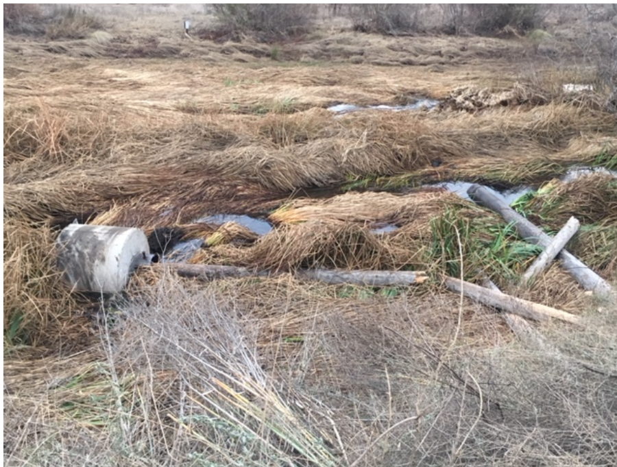
North-facing view from Sorrento Valley Blvd of collapsed guard structure in Los Penasquitos Creek (before removal).