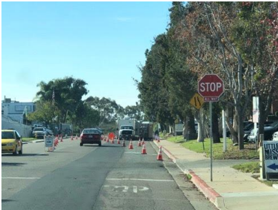
Caption Vault cable install.

Photo Attributes Capture Date/Time: Thu Jan 18 2018 14:10:07 GMT-0800 (PST) Coordinates: 32.894441, -117.146081 View Direction: West