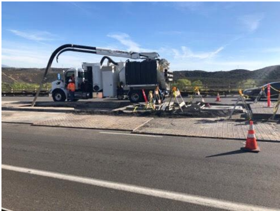
Caption Vault and pothole truck on Pomerado Raod.

Photo Attributes Capture Date/Time: Thu Jan 18 2018 13:23:58 GMT-0800 (PST) Coordinates: 32.922486, -117.060401 View Direction: Southeast