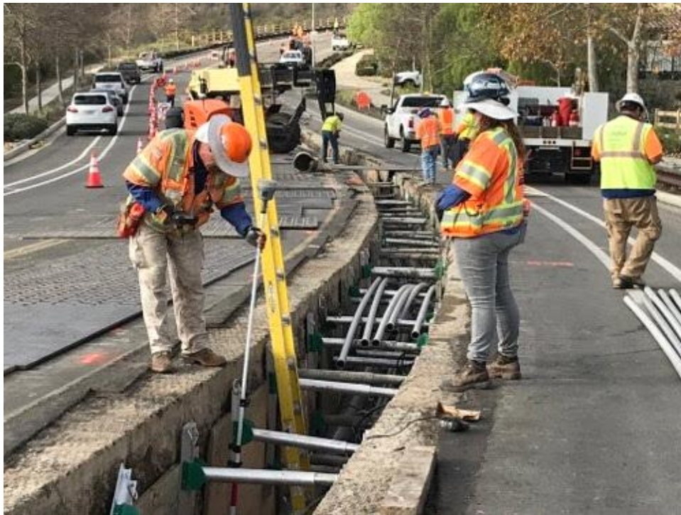
Caption Laying conduit on Stonebridge Parkway.

Photo Attributes Capture Date/Time: Fri Jan 19 2018 09:27:14 GMT-0800 (PST) Coordinates: 32.921970, -117.046562 View Direction: South