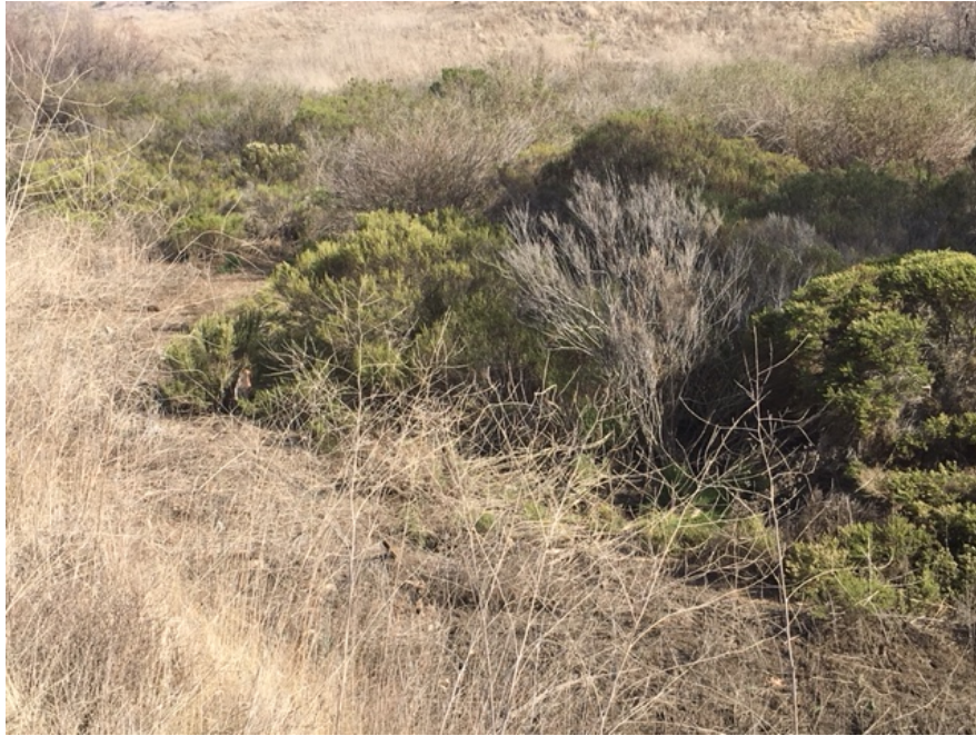
South-facing view from Sorrento Valley Blvd of collapsed guard structure (after removal).