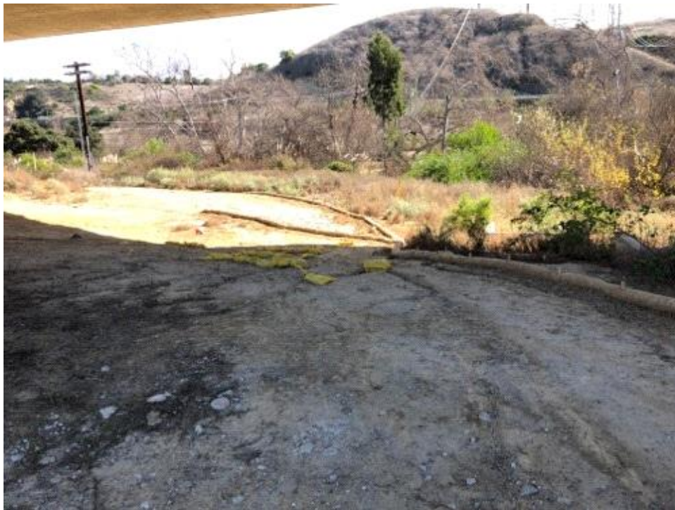
Caption BMPs under Carroll Canyon Bridge.

Photo Attributes Capture Date/Time: Sat Jan 20 2018 10:51:16 GMT-0800 (PST) Coordinates: 32.889261, -117.202884 View Direction: South