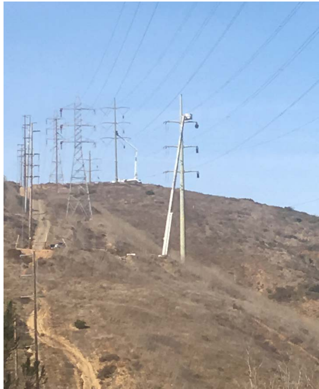
View of E42 (Z479062) where conductor break occurred