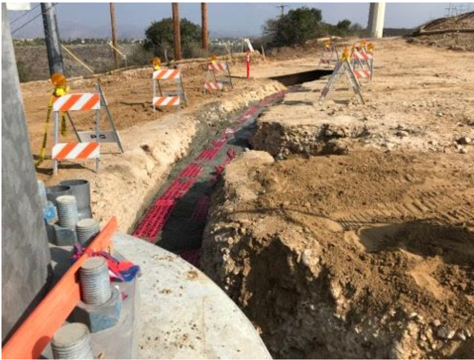
Caption Getaway at P04 with fresh slurry.

Photo Attributes Capture Date/Time: Fri Jan 19 2018 12:09:14 GMT-0800 (PST) Coordinates: 32.919704, -117.032254 View Direction: Southeast