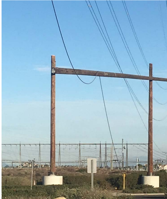
Fallen line on guard structure located on East Ocean Air Drive.