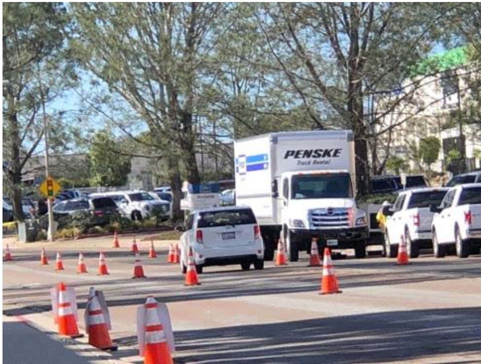
Caption Traffic control for vault mandreling on Activity Road.

Photo Attributes Capture Date/Time: Sat Jan 20 2018 12:13:04 GMT-0800 (PST) Coordinates: 32.895880, -117.142171 View Direction: West