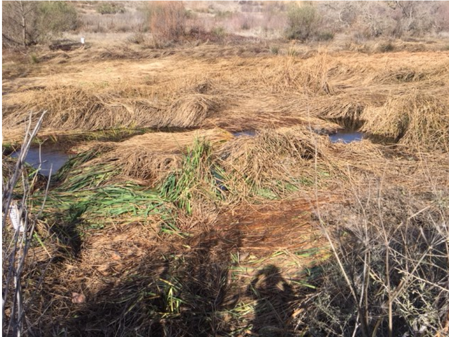
North-facing view from Sorrento Valley Blvd of collapsed guard structure in Los Penasquitos Creek (after removal)