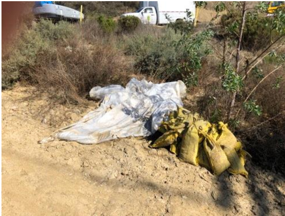
Caption Stockpile at CC MM CP.

Photo Attributes Capture Date/Time: Sat Jan 20 2018 10:59:44 GMT-0800 (PST) Coordinates: 32.889725, -117.203348 View Direction: East