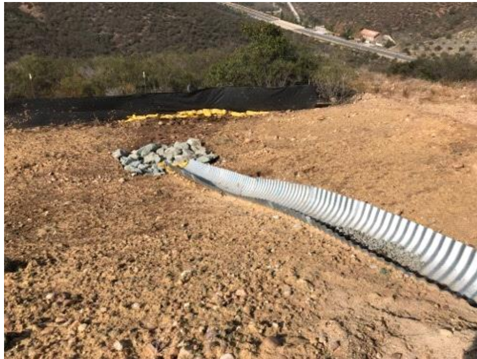
Caption McCarthy drain at P03 working well.

Photo Attributes Capture Date/Time: Fri Jan 19 2018 12:06:24 GMT-0800 (PST) Coordinates: 32.919870, -117.032379 View Direction: Northwest