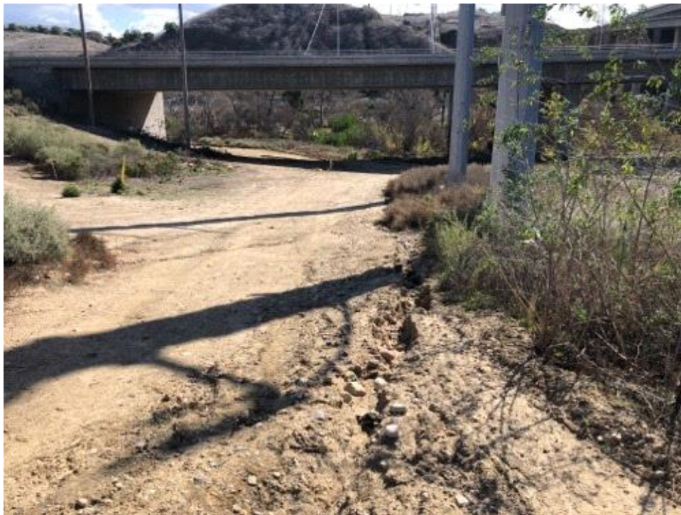
Caption Erosion on road.

Photo Attributes Capture Date/Time: Sat Jan 20 2018 11:07:59 GMT-0800 (PST) Coordinates: 32.889677, -117.203327 View Direction: South