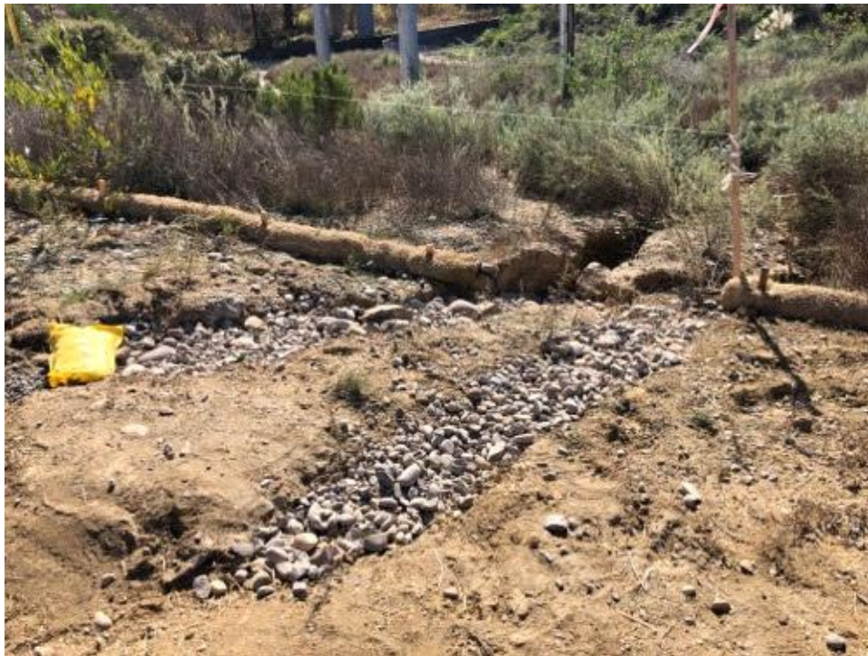
Caption Erosion north of CC MM CP pole adjacent to road.

Photo Attributes Capture Date/Time: Sat Jan 20 2018 11:53:52 GMT-0800 (PST) Coordinates: 32.889854, -117.203219 View Direction: West