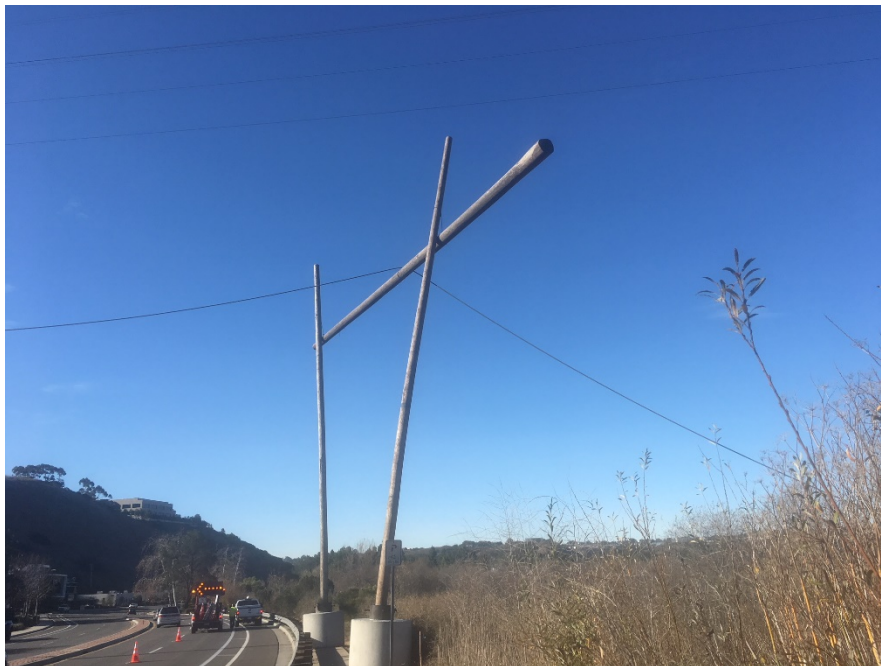
Fallen line on guard structure located on northern side of Sorrento Valley Blvd.