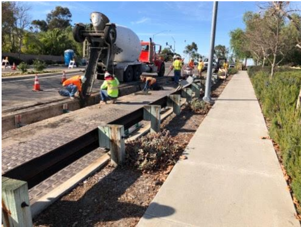
Caption Concrete work on Stonebridge Parkway.

Photo Attributes Capture Date/Time: Thu Jan 18 2018 13:41:28 GMT-0800 (PST) Coordinates: 32.922434, -117.058346 View Direction: West