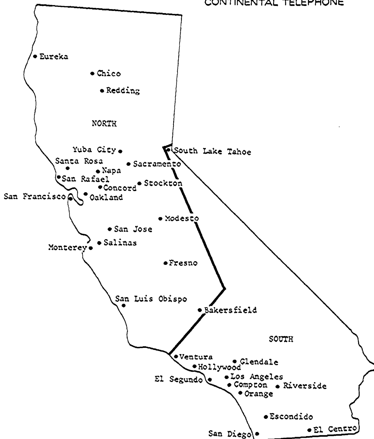
FIGURE C REPORTING UNITS CONTINENTAL TELEPHONE