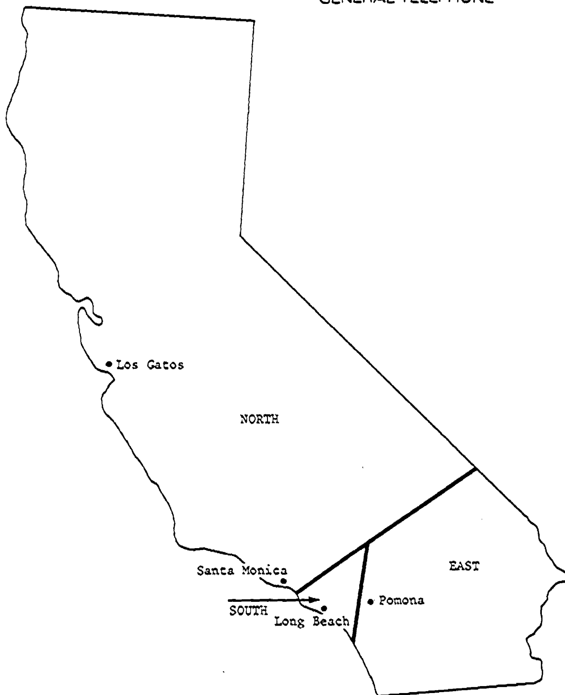
FIGURE B REPORTING UNITS GENERAL TELEPHONE