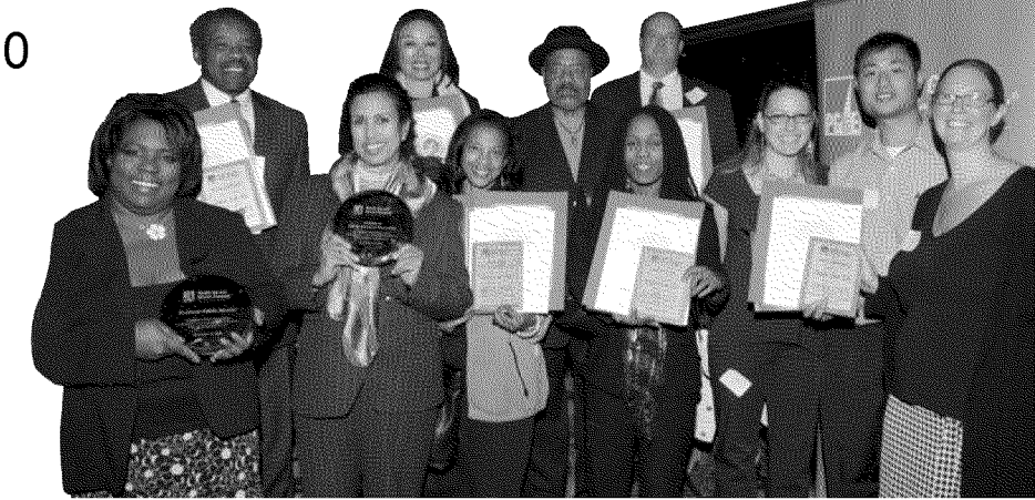
above: The Green Heroes awards were given to representatives from: Fruitvale Public Market, Cypress Mandela Training Center, Friends of Oakland Parks & Recreation, Oakland Chinatown Chamber of Commerce, East Oakland Youth Development Program, Regional Technical Training Center, Urban Releaf, Children's Fairyland, Habitat for Humanity East Bay, GRID Alternatives