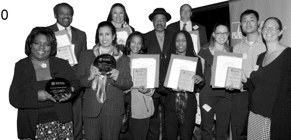
above: The Green Heroes awards were given to representatives from: Fruitvale Public Market, Cypress Mandela Training Center, Friends of Oakland Parks & Recreation, Oakland Chinatown Chamber of Commerce, East Oakland Youth Development Program, Regional Technical Training Center, Urban Releaf, Children's Fairyland, Habitat for Humanity East Bay, GRID Alternatives