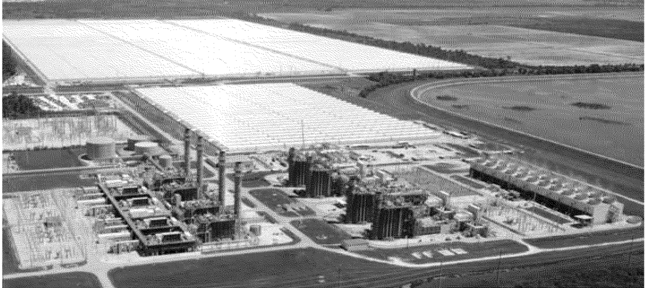
The largest concentrating solar power (CSP) project in nearly 20 years in the United States was installed in 2010. It is a hybrid CSP-natural gas facility owned by Florida Power & Light.