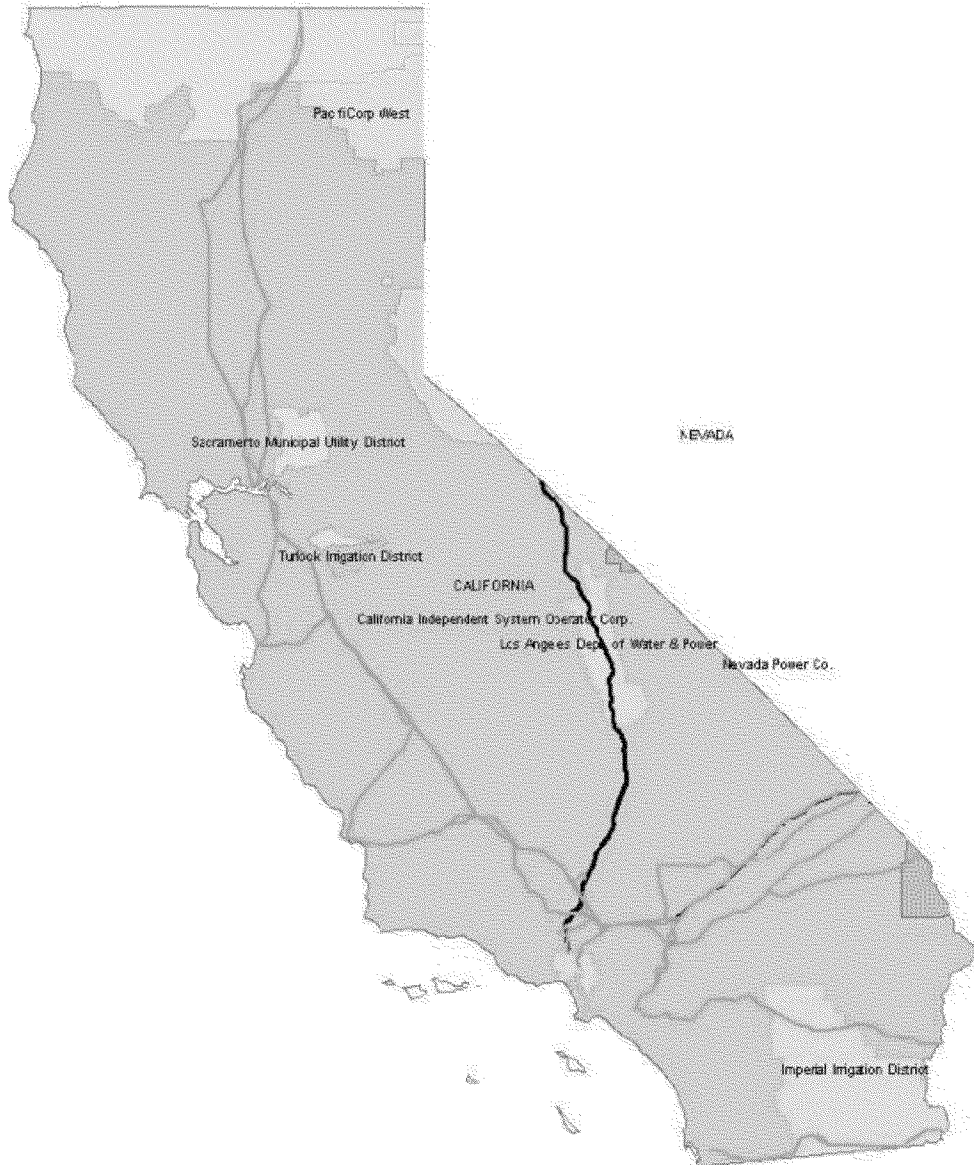
Figure 5 – Map of the California ISO Balancing Authority Area

Map taken from Page 46 of the CTPG Final Statewide Transmission Plan. 1